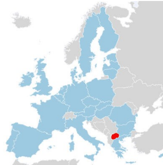
Macedonia and EU-27