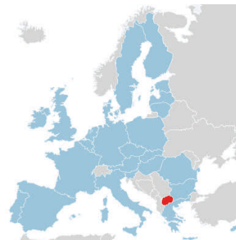
Macedonia and EU-27

The Department of Agricultural Economics and Organization at St Cyril and Methodius University in Macedonia (UKIM) has been cooperating with the Department of Economics at SLU in Sweden since 2000. Visit our website .