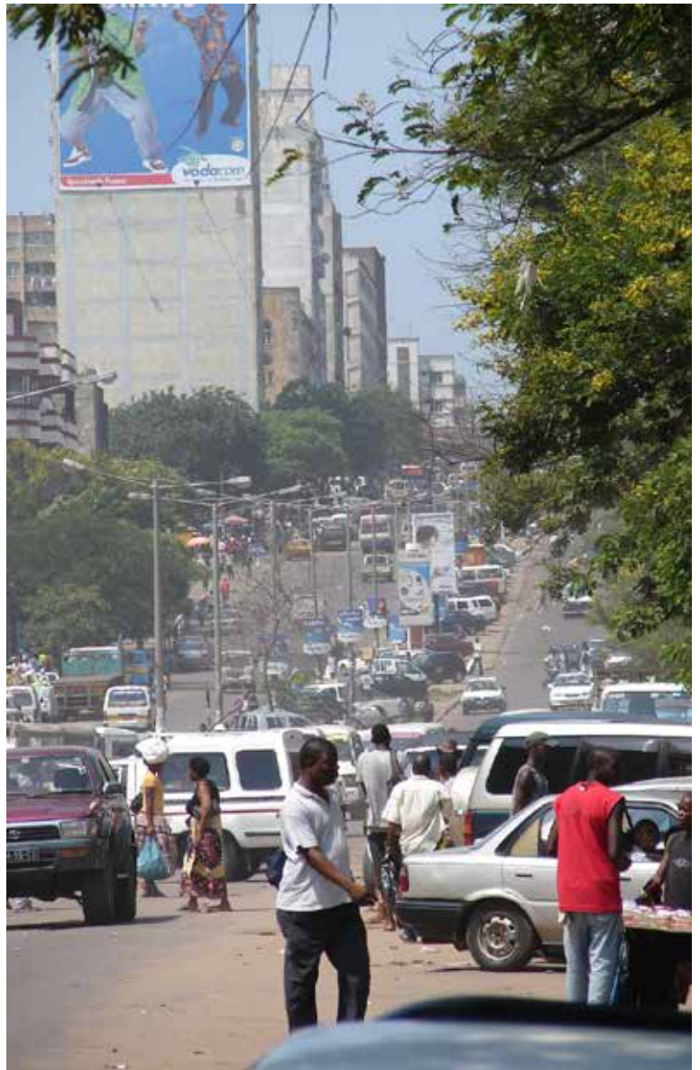
View over Avenida Eduardo Mondlane, Maputo, Mozambique.

“The idea is that several SLU administrative divisions will work together and with their counterparts at Eduardo Mondlane University.”