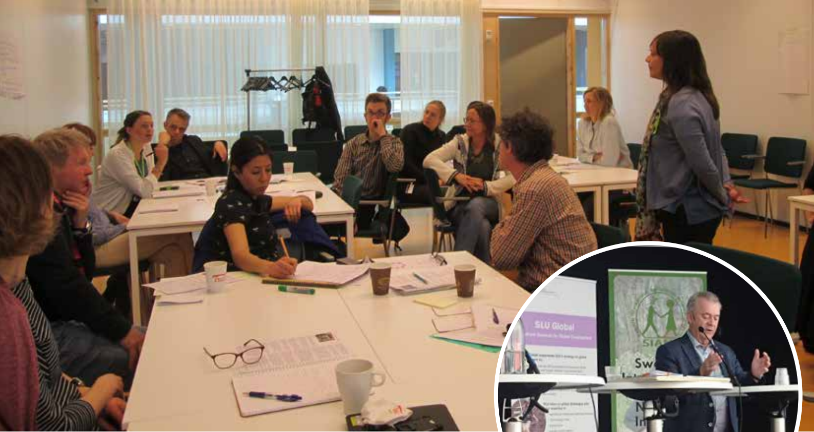
Above: Participants in the workshop Theory of change for Agricultural Development .