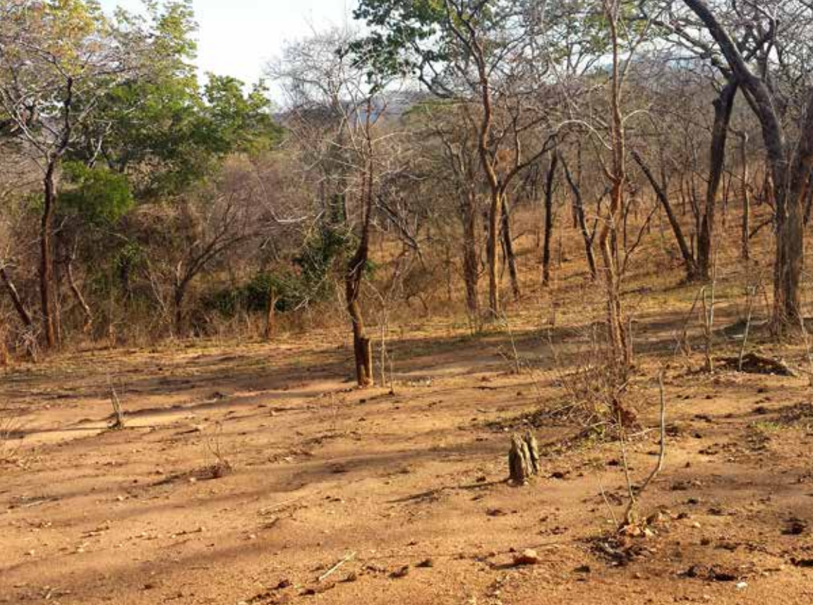
Pasture during dry season in Kilosa in the Miombo forest, Tanzania.