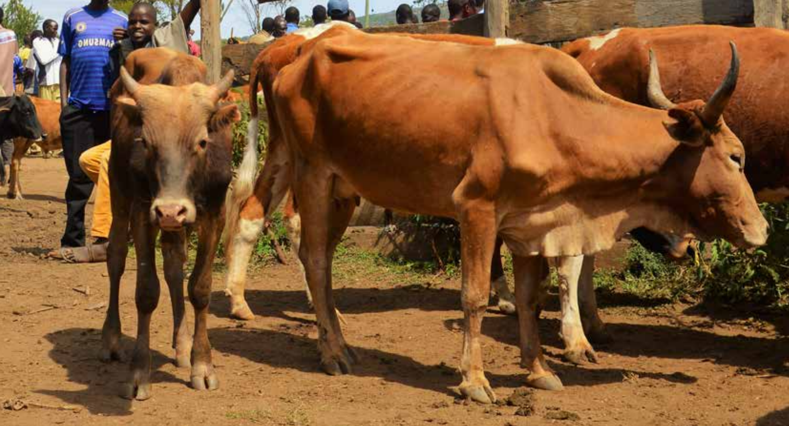
Cattle in West Pokot, Kenya.