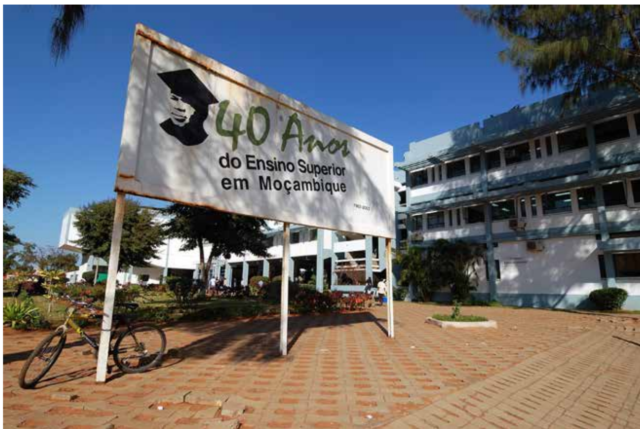
Eduardo Mondlane University, Maputo, Mozambique.