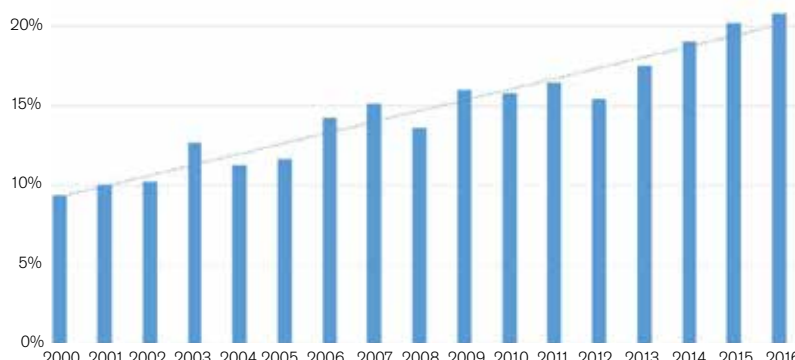
Fig 1. Share of SLU publications jointly with authors from low- and middle-income countries (as defined by the OECD DAC list* of countries eligible for official development support) out of total number of SLU publications per year. (ISI Web of Science by SLU Library)

The result shows citations from articles with SSA co-authorship from 37 Sub-Saharan African countries. Among countries in SSA, South Africa is dominating (5%), while Kenya (2.5%) and Ethiopia are in a class in-between, before an asymptotic tail with Zimbabwe, Burkina Faso, Uganda, Tanzania, Nigeria and Ghana in the lead with between 1 – 0.5% (approx. 72 – 36 articles for each country during those years).