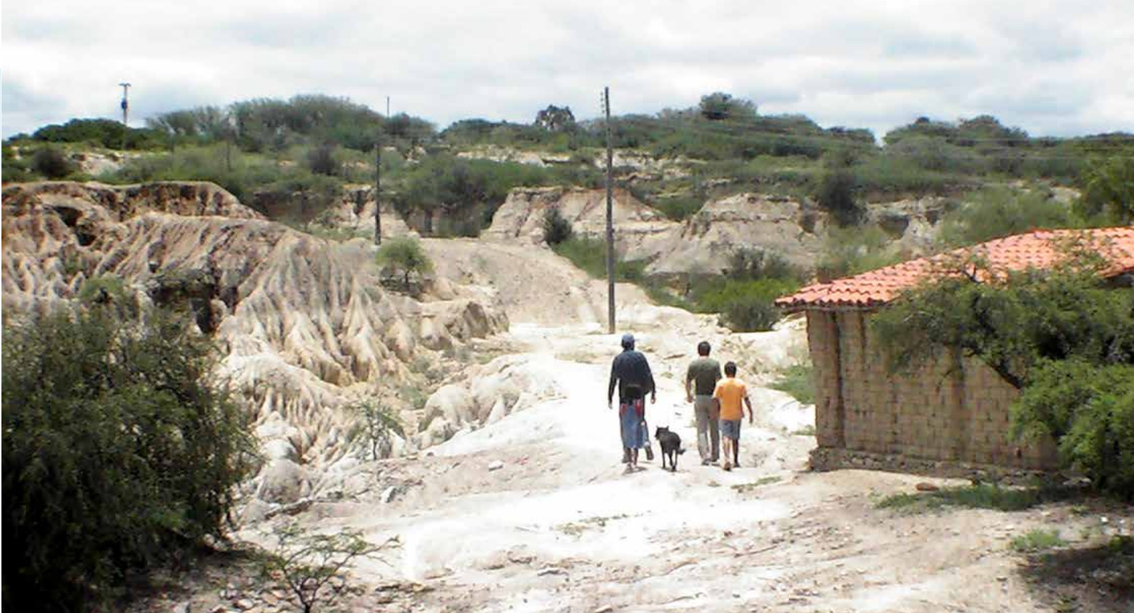
Several metres of soil washed away by intensive rains in dryland of Bolivia.