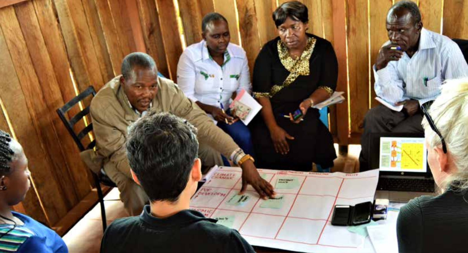
Active participants in the Triple-L dryland scenario workshop in West Pokot, Kenya.