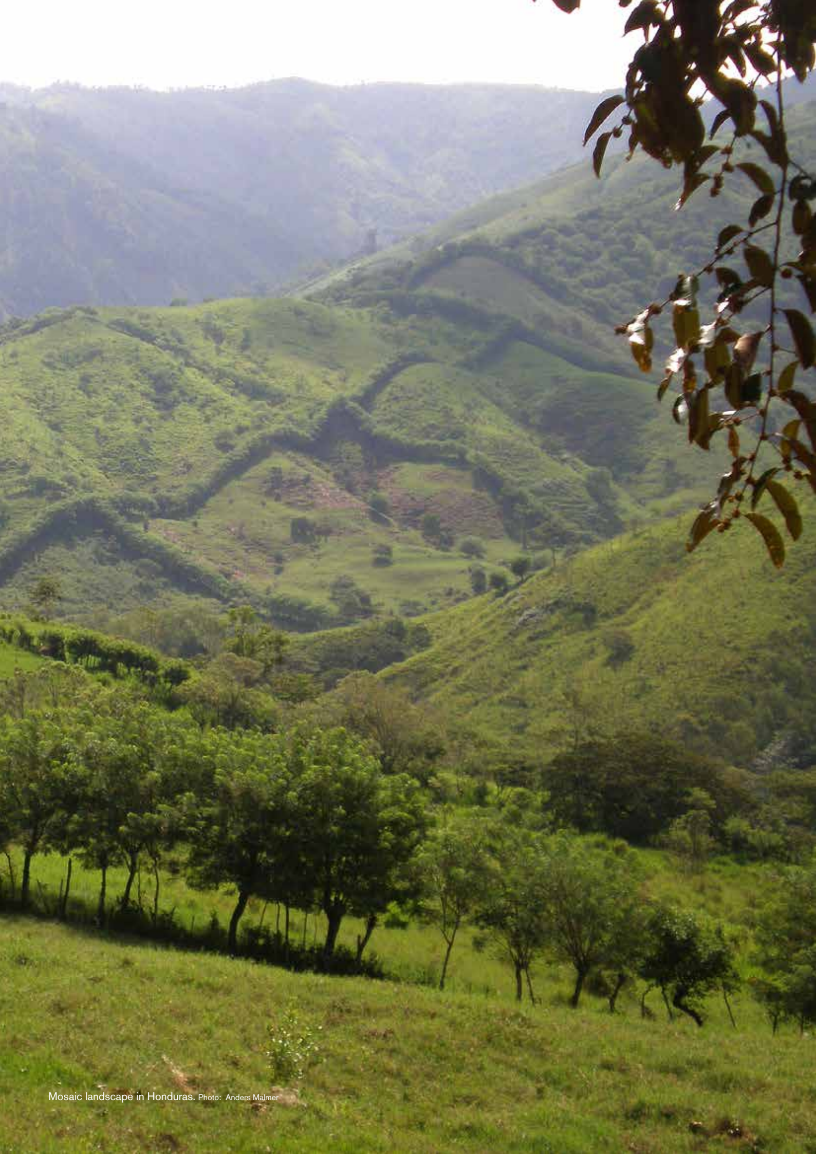
Mosaic landscape in Honduras.