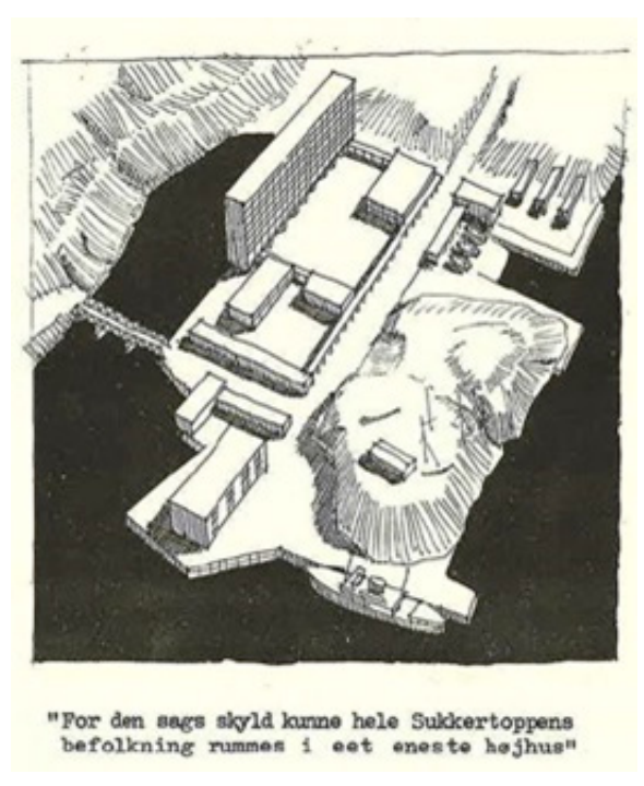
FIGURE 1. An unrealised example of modernist planning in Greenland: 'For that matter, the whole population of Sukkkertoppen [now Maniitsoq] could be accommodated in a single high-rise' (Department of Greenland (Denmark), 1951).

of architectural determinism still pervaded. In the Arctic, this is evident in the writings of British/ Swedish architect Ralph Erskine. While his proposals for settlement designs in the Scandinavian and Canadian North paid lip service to the desires and aspirations of locals, and despite their "softened" architectural language, they were still ultimately modernist in their proposals for uto-