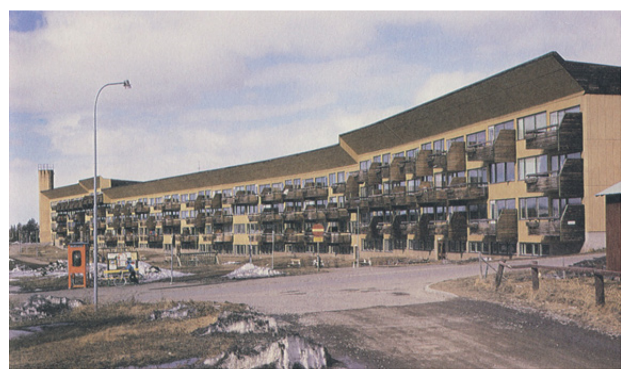
FIGURE 2. Ormen Långe windbreak building (Svappavaara, Sweden, 1965). Design: Ralph Erskine (photo in public domain).

Landscape urbanism as a discourse emerged in the mid-1990s and can be traced to postmodern architectural thinking and the critique of the abstraction of modernism (Waldheim, 2016). The development of the field also represented a move away from the ecological modernism that had dominated landscape architecture, while simultaneously echoing the foregrounding of environmental thinking and, more recently, climate change adaptation and mitigation strategies in the