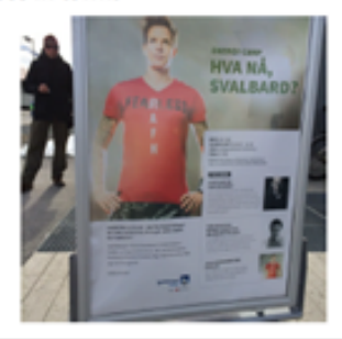
FIGURE 4. Excerpt from transect journal. Longyearbyen (Svalbard), May 26, 2015.

Following the transect line as closely as practically possible, we noticed posters for an event the following evening directed at local businesses on the future of Svalbard, and the need for individual courage and a collective spirit among the commercial and industrial actors in the town.