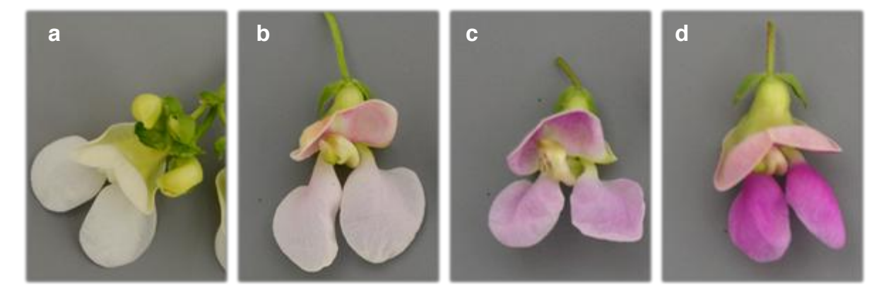
Figure 4. P. vulgaris flowers. a) Variety Nordstern scored 1 for white. b) NGB17815.2 from Sanda scored 2 for light pink. c) NGB11761.4 black bean from Gotland scored 3 for pink. d) NGB17807.2 from Harplinge scored 4 for violet.

Flower colour (Figure 4) was estimated separately for the standard of the flower and the flower wings on a scale of 1–4 (1=white, 2=light pink, 3=pink, and 4=violet). Growth habit was recorded as either climbing or bush type (Figure 2, b and d, respectively). Finally, terminal leaflet shape (Figure 5) was judged on a scale from 1–5 (1=triangular, 2=triangular to circular, 3=circular, 4=circular to quadrangular, and 5=quadrangular). Raw data are presented in Appendix 2.