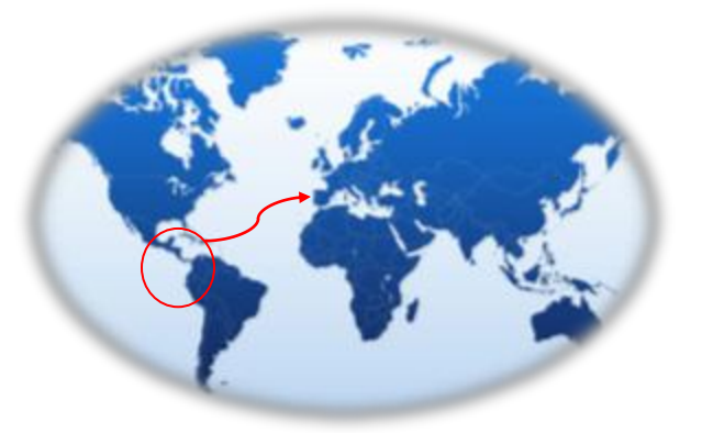
Figure 1. The Central- or South American origin and introduction to the Iberian peninsula in Europe of P. vulgaris during the 1500s.

bean", "French bean" or "common bean". It belongs to the family Fabaceae and is a dicotyledonous annual. Its compound leaf is pinnately trifoliate and the leaves are alternately arranged on the stem (Figure 2 d). Determinately growing 60 cm tall as a bush variety, or climbing indeterminately (Figure 2 b) up to 3 m, it takes between 60 and 80 days under favourable conditions from germination until pods and seeds are