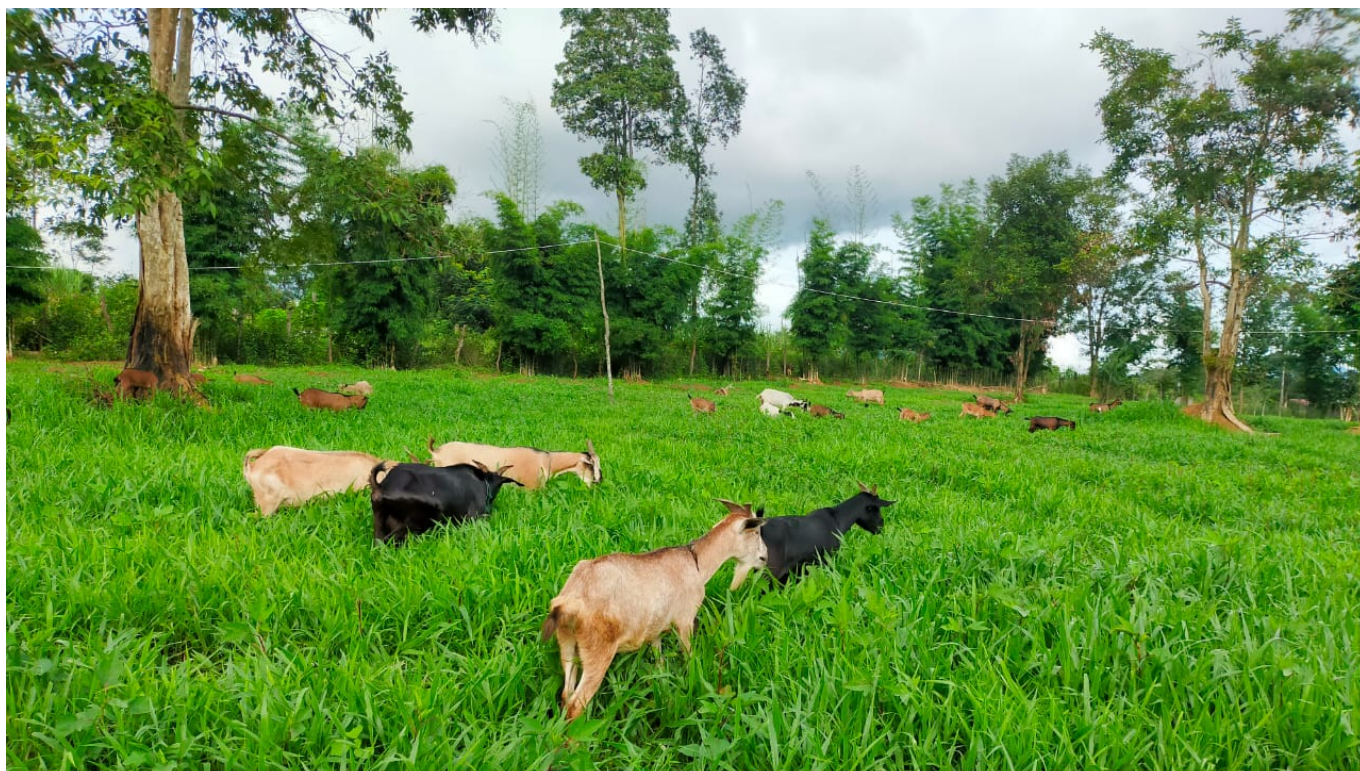
Goats feeding on improved grass fields.