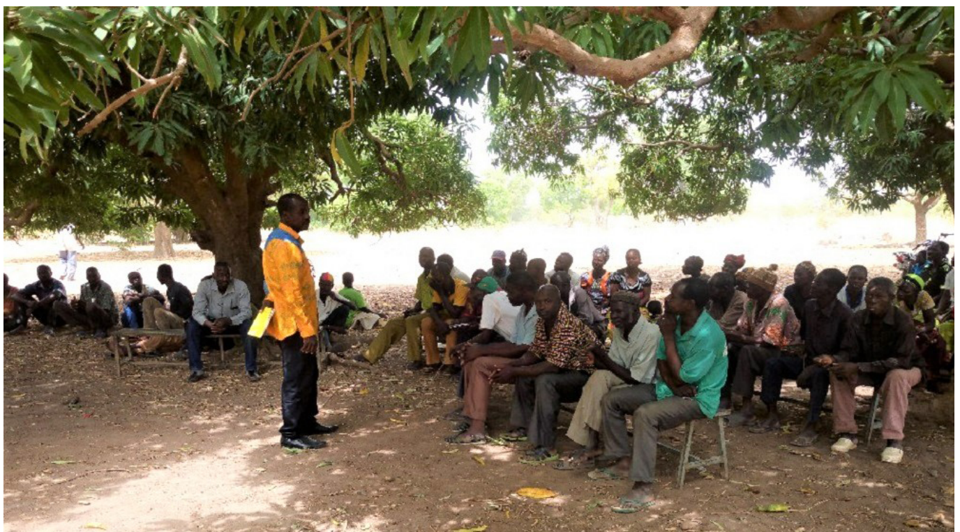
Innovative platforms meeting in Burkina Faso.

The information around the IPs and the reasons to why sustainable parkland management is important have also been broadcasted in local languages in different radio stations in Burkina Faso. The IPs have changed the way stakeholders talk to each other, providing a space where development service actors (extension officers or local policymakers) can communicate with each other about the problems they are facing and the opportunities they see for the parklands in Burkina Faso.