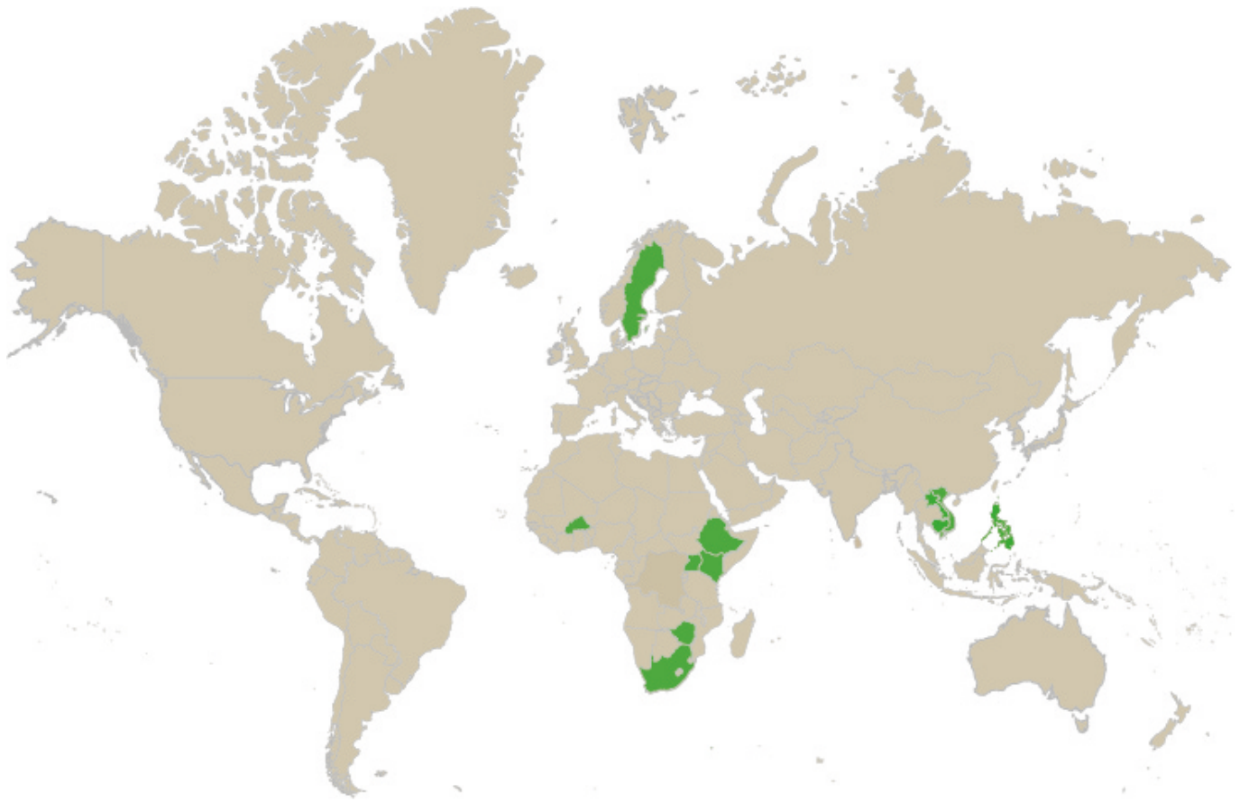
Countries where AgriFose2030 is active with different projects 2021. Illustration: Cajsa Lithell