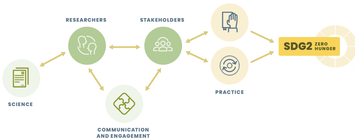
A schematic illustration of how researchers from target countries and Sweden within AgriFoSe2030 collaborate and build capacity to synthesize, communicate and co-create scientific data and research findings in dialogue with various stakeholders, in support of evidence-based decision-making and improved practice, with the end goal of reaching SDG2.