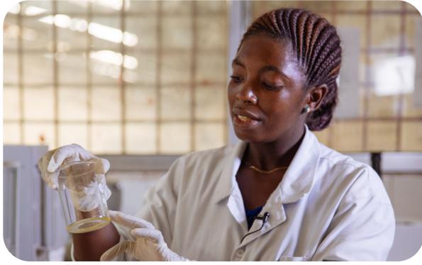
Chemist in Tanzania.