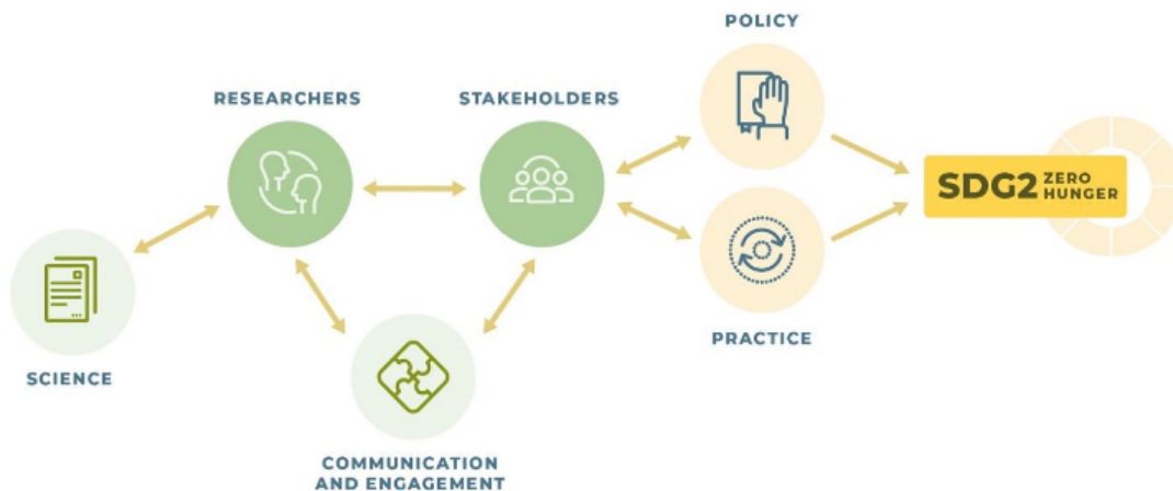
A schematic illustration of how researchers from target countries and Sweden within AgriFoSe2030 collaborate and build capacity to synthesise, communicate and co-create scientific data and research findings in dialogue with various stakeholders, in support of evidence-based decision-making and improved practice, with the end goal of reaching SDG2.