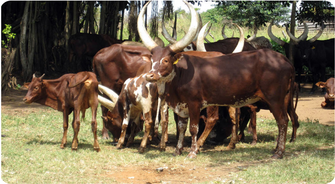
Cattle in Uganda.