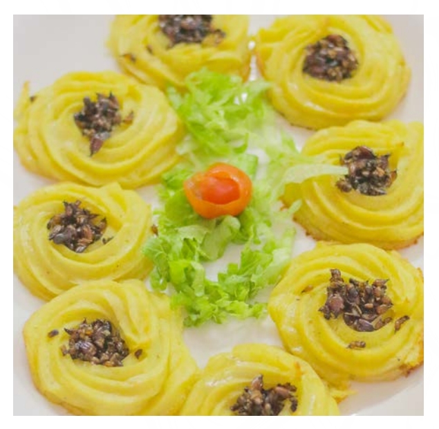
Figure 6 and 7: Soldier termites (above) and termite in the hole dish (below).