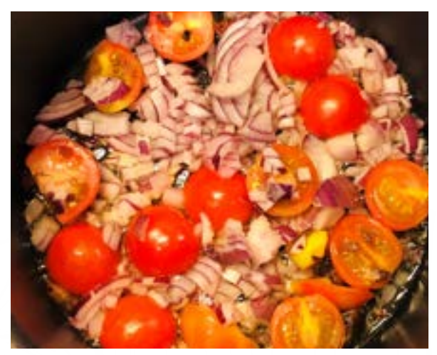
Step 1: Stir fried chopped Tomatoes and garlic

150g bwanoni dry fried 100g cherry tomoatoes chopped 1 onion chopped 1 medium size eggplant 1 teaspoon curry powder 2 cloves garlic chopped Salt to taste Pinch of black pepper Hot chillies to taste Curry leaves Cooking oil