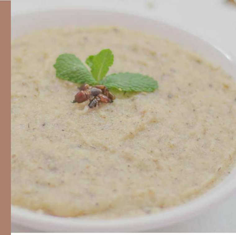
Figure 8: Termite porridge