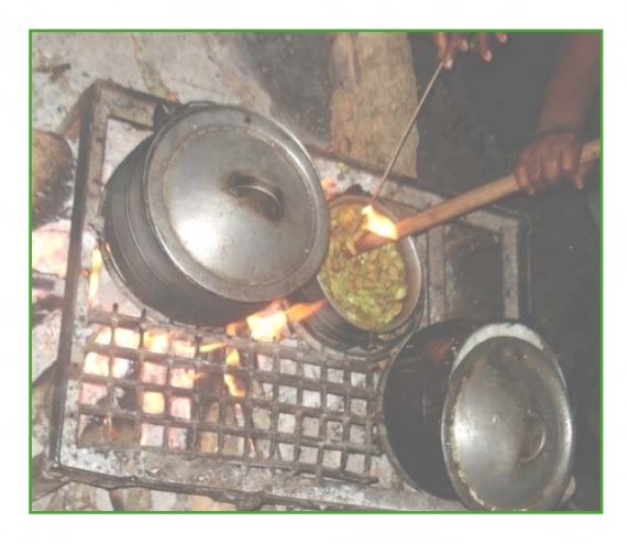
Step 2: A flame is passed on the dead insects (after sieving from water) to remove volatile substances released by the insects during drying.