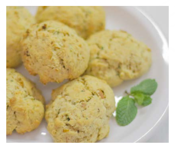
Figure 17: Edible stink bug mint cookies