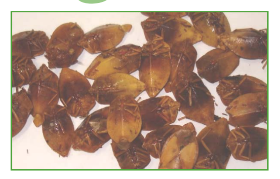
Step 3: Insects killed with hot or cold water accumulate alarm pheromones on their thoraces. Such insects have a sharp bitter taste.