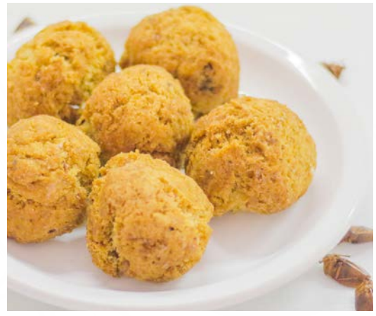
Figure 16: Stinkbug ginger nuggets

Shelf life: Can be stored for a month in an airtight container or frozen just after shaping and fried when desired