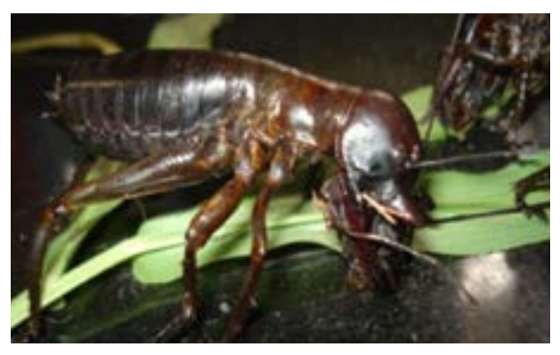
Figure 18: The Ground Cricket Henicus whellani

Shelf life: best consumed within one week.