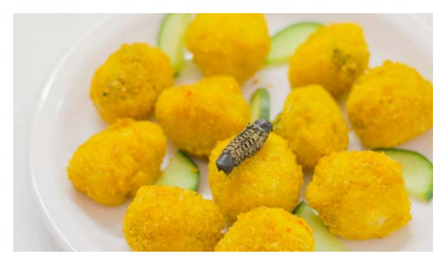
Figure 12: Mopane Surprise