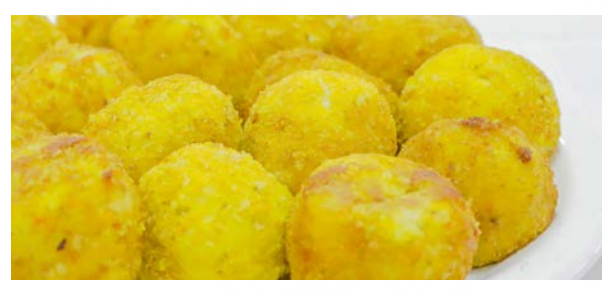
Figure 11: Mopane Balls