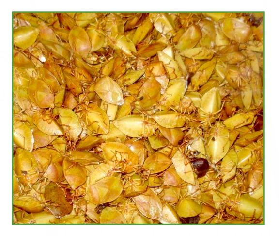
Step 4: Roasted edible stink bugs with a golden brown colouration. This is an indication that insects are of good quality.