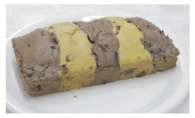
Figure 19: Majenya (Cricket) Loaf

Table 10: Nutritional composition of Ground Cricket loaf