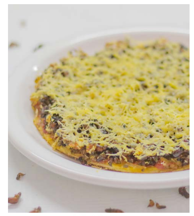
Figure 5: Termite Pizza

350 g crushed swarmer (from approximately 500g fresh swarmers) 105 ml iced water 2.5 g powdered gelatin 3 tsp seasoning