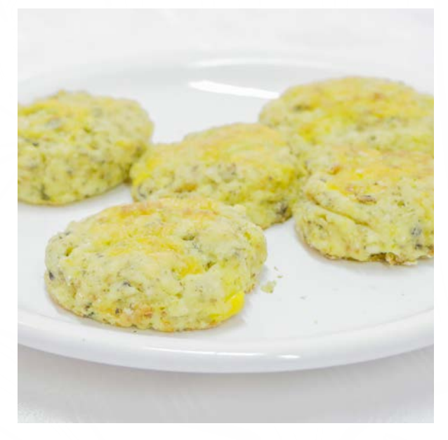
Figure 9: Mopane worm savory scones