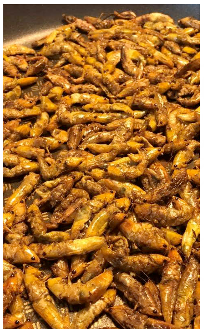
Figure 22: KwasuKwasuBwanoni

If you feeling peckish and cannot think of what to get your teeth into this snack is great for getting you that comfort feeling. Kwasukwasu. Literally means snacking and enjoying in Malawi. The words create a flow of the saliva, and longing for more. Dry roasted/fried bwnanoni can be preserved for some time and are very handy when travelling to be eaten as an energy replenisher. All you need is a sturdy frying pan and some salt to season.