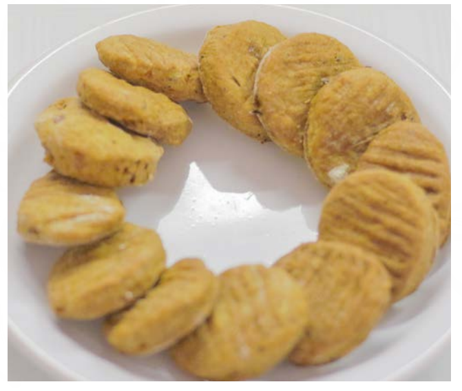
Figure 3: Swarmer/Termite ginger biscuits.

Shelf life: Biscuits can be stored in a tight closed container for 4–6 weeks.