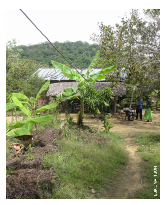
A typical dry-zone homegarden in Sri Lanka with banana plants growing alongside trees that provide shade.

Therefore, long-term transdisciplinary, stakeholder inclusive and data-dense research programs with clear monitoring and evaluation methods are needed to understand the dynamics of homegardens in relation to changes in society and environment. The difference between biophysical and socioeconomical context is also relevant to include in policy programmes and implementation, since wet and dry zones of Sri Lanka have different climatic