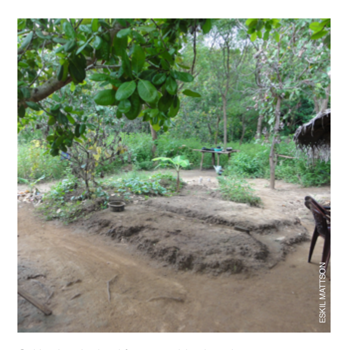
Cultivating the land for vegetables in a dry-zone homegarden.

economic, socio-political change. Consultations held with Governmental and academic stakeholders in Sri Lanka by the authors show that land fragmentation due to urbanization is a threat to the sustainability of homegardens. For example, young people are often migrating to cities for seeking jobs. In the cities, they only have space to put up a house and leave little