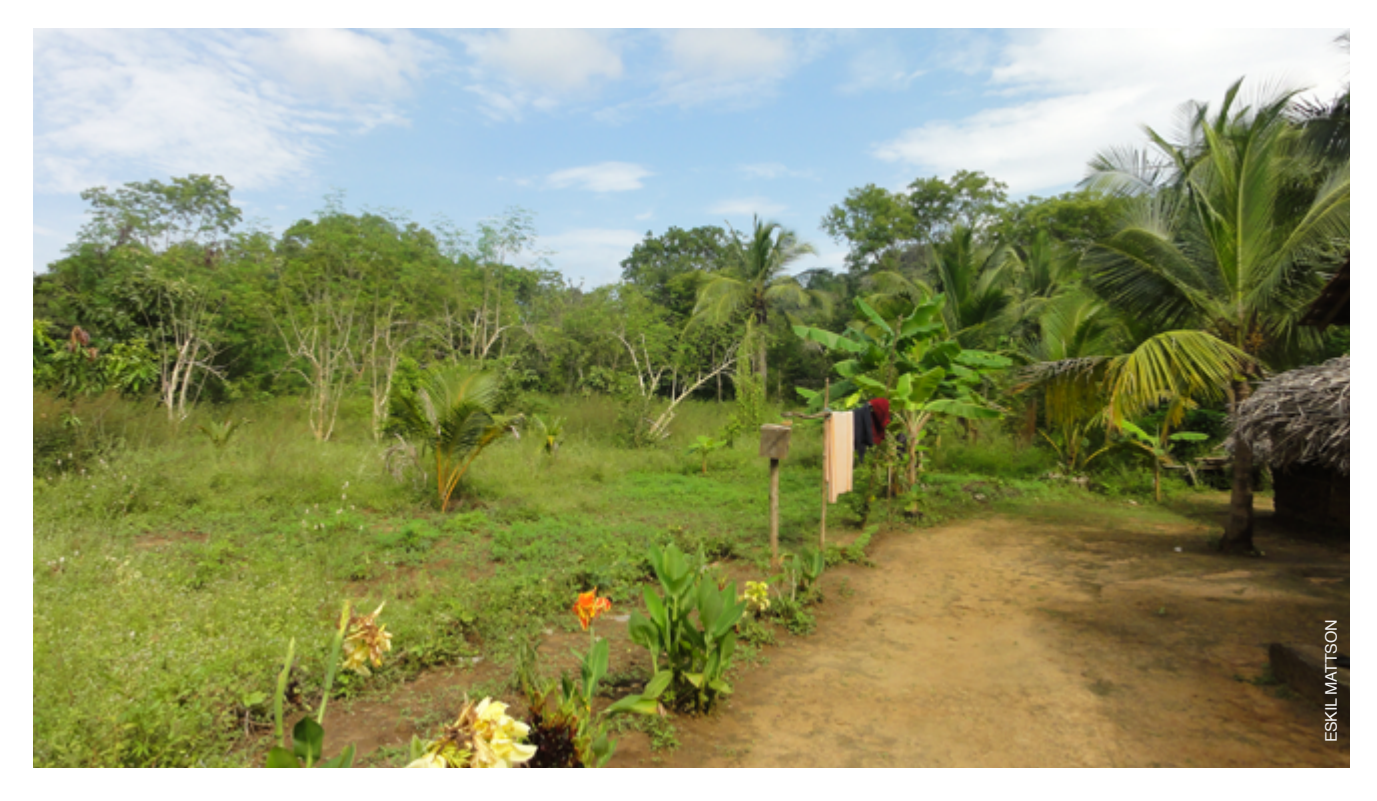
Growing ornamental flowers for decorative purposes as in this homegarden, provide aesthetic functions to families

This must be done in close connection to evolving market opportunities while enhancing their resilience and provision of nutritious food products.