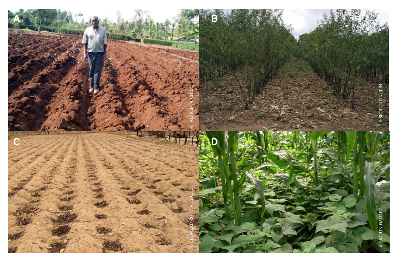
Figure 1. Some of the reviewed practices. A: The ridge alternative. B: No-till relay intercropping. C: Planting basins. D: Intercropping.