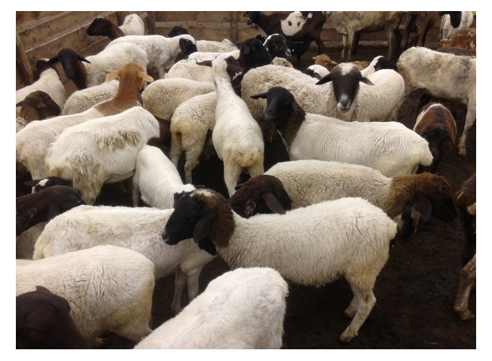
lose billions of shillings due to high animal deaths, decreased yields and costs incurred from purchase of drugs. The proportion of income contributed to national and county governments by livestock farming will reduce significantly. The economies of counties whose main economic activity is livestock farming will weaken thereby slowing development. All the positive benefits associated with high livestock production will be lost.

An integrated disease management program which combines these approaches will stop disease spread, reduce animal deaths, and result in healthier and higher yielding animals. This will ultimately increase household incomes which is used to improve health, education and agriculture. The cost of inaction will continue to rise. Farmers will continue to suffer financial losses, lose their export market base, remain poor and lack vital proteins in form of milk and meat. The country will continue to