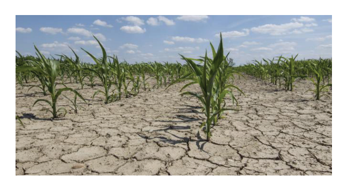
Plate 4: Environmental effects of drought in Laikipia County

Droughts have long lasting environmental challenges in Laikipia County. Drying of rivers (78.9%), lack of wood fuel (11.6%) and increased fire incidences (8.8%) are reported as aftermaths of droughts (Plate 2). Drying of rivers leads to increased distances for people and animals to the water points and this could increase conflict over the few existing water sources (Plate 3). The conflicts are not limited human-human conflict but also human-wildlife conflicts. Increased fire incidence leads to loss of biodiversity and subsequently altering the ecosystem.