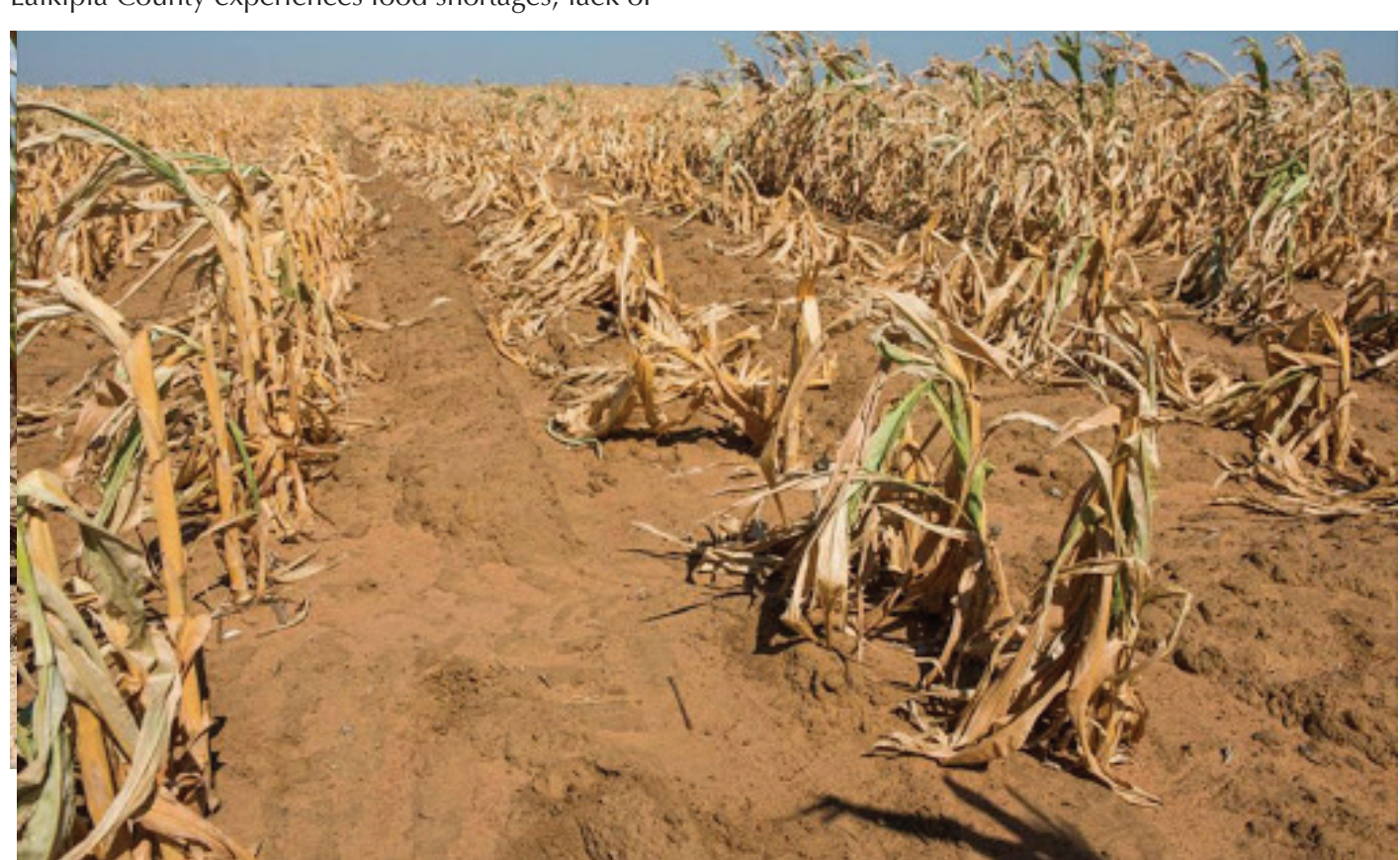
Plate 1: Effects of drought on crops in Laikipia County

pasture, and high prices of goods during drought. High price of goods is as a result of decreased supply leading to out sourcing of goods from other counties which increase the cost of goods in Laikipia.