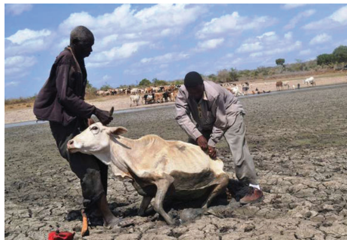
Plate 2: Effects of drought on Livestock in Laikipia County