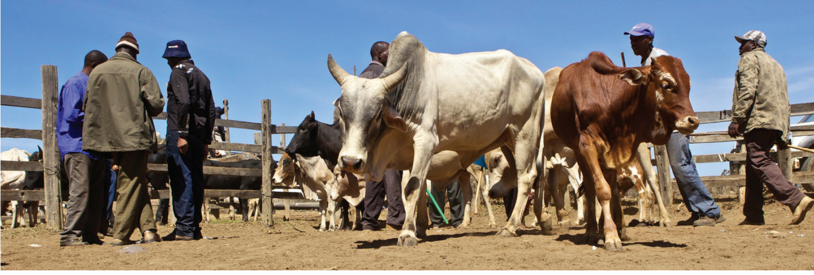
Plate 6: Livestock Market day in Rumuruti Town