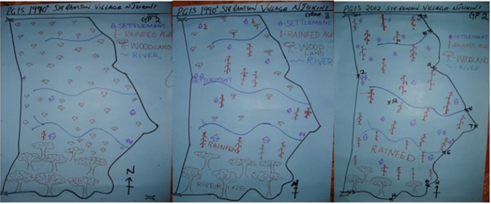
Figure 6: Communicating the root causes of HWCs through mental mapping of land use changes