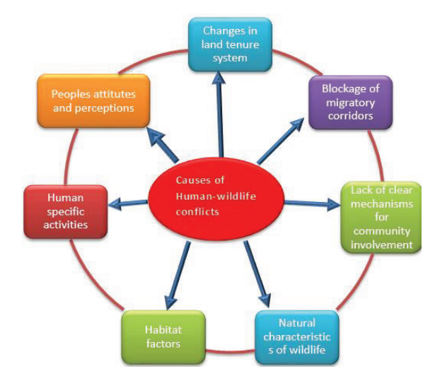
Figure 1: Causes of Human-wildlife conflicts

Human Wildlife Conflicts (HWC) are interaction between wildlife and people and the resultant negative impacts on people and/or their resources, or wild animals and/or their habitat. The conflicts affect Kenya's economy, wildlife conservation and threaten human safety and livelihoods. A number of factors have continuously influenced the spread and magnitude of HWC (Fig.1).