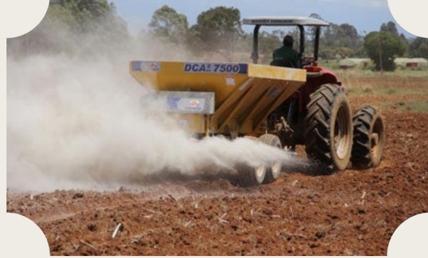
Figure 3. Liming in combination with DAP has significantly higher benefits than fertilizer blends

Combined use of lime and fertilizer – there are reports of 3 fold net benefit when lime is added to DAP compared with where fertilizer blends are applied alone.