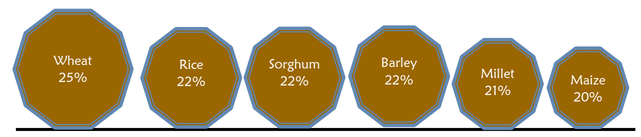
Figure 1. Between 20-25% of the major cereal crops in Kenya is lost to post harvest losses (During Harvesting; Field Drying; Platform Drying; Threshing and shelling; Winnowing; Transport to Farm; Farm Storage; Transport to market; Market storage)

pests and crop diseases, adverse weather, degradation of agricultural land, encroachment of urbanization into arable major factor to decreased food availability and therefore the need to prioritize loss reduction interventions and formulation of policies. Kenya loses up to 30% of its key cereals (Figure 1) annually occurring within 6 months after harvests (World Bank et al., 2011) leading to huge costs (Figure 2).