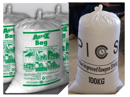
Figure 6. Hermetic Bags