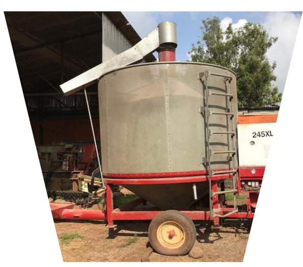
Figure 4. Grain driers-Stationery and Mobile