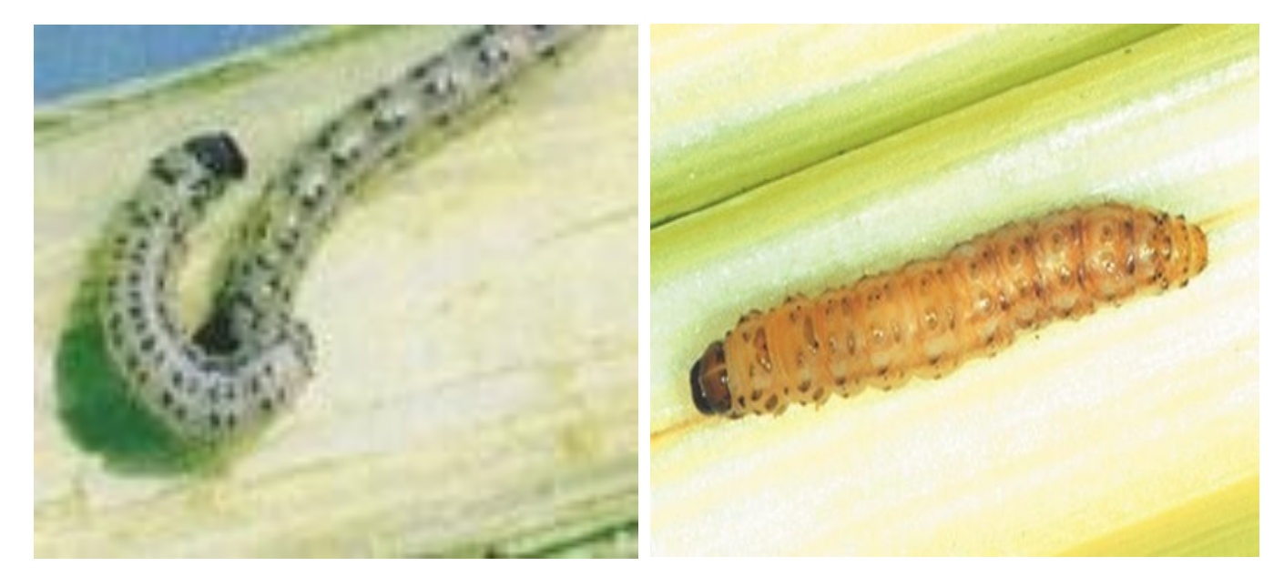
The spotted stem borer destructive larva