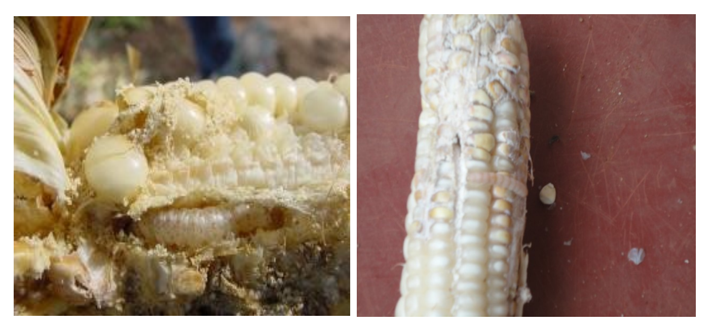
Maize stem borer cob damage