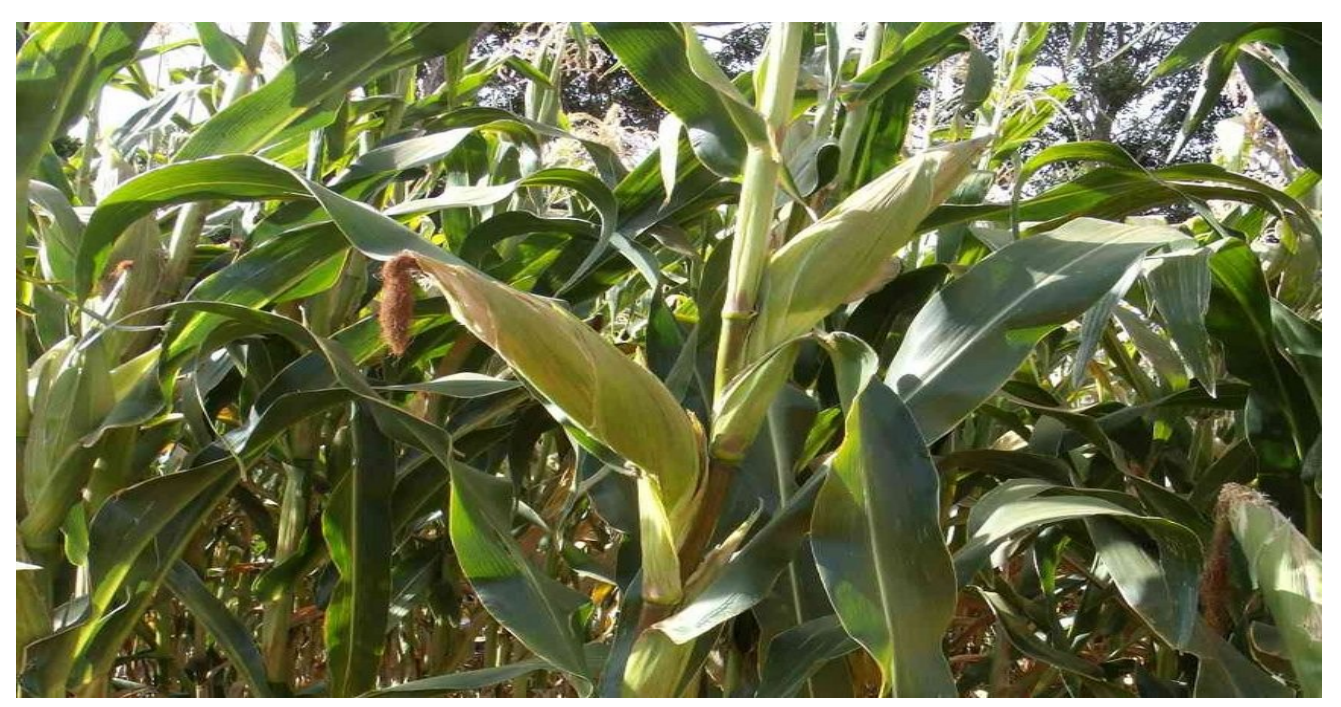
A healthy maize crop

Stem borer yield losses are highest in these areas <sup>[4]</sup>, thus adoption of these varieties should be highly encouraged. Due to overlaps within production zones, several varieties can be produced across zones thus farmers have a wide group of good varieties to choose from depending on individual preferences.