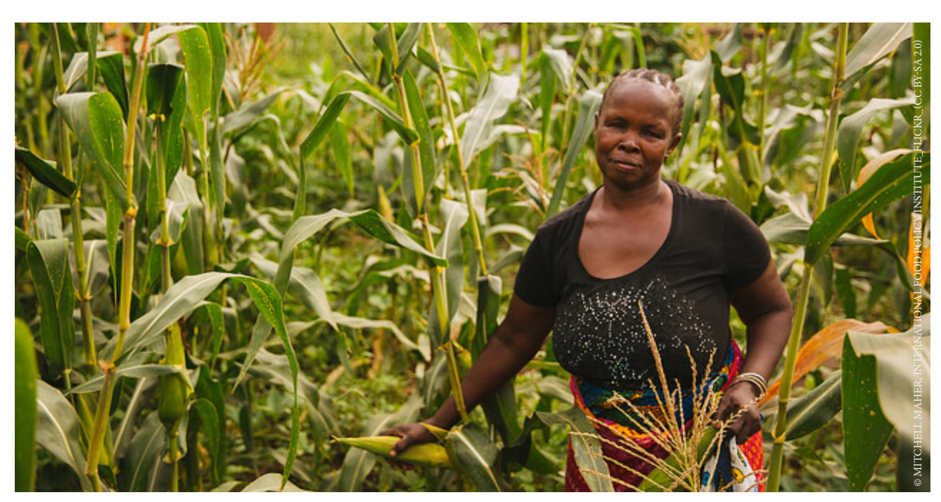
Poor road infrastructures can limit extension services to small-scale farmers.

Likewise, increasing private sector investment in agriculture, as well as improving private-public partnerships that promote agribusiness development among smallholder farmers, could be an avenue for improving food security, and reducing rural poverty. Lastly, climate change adaptation and mitigation