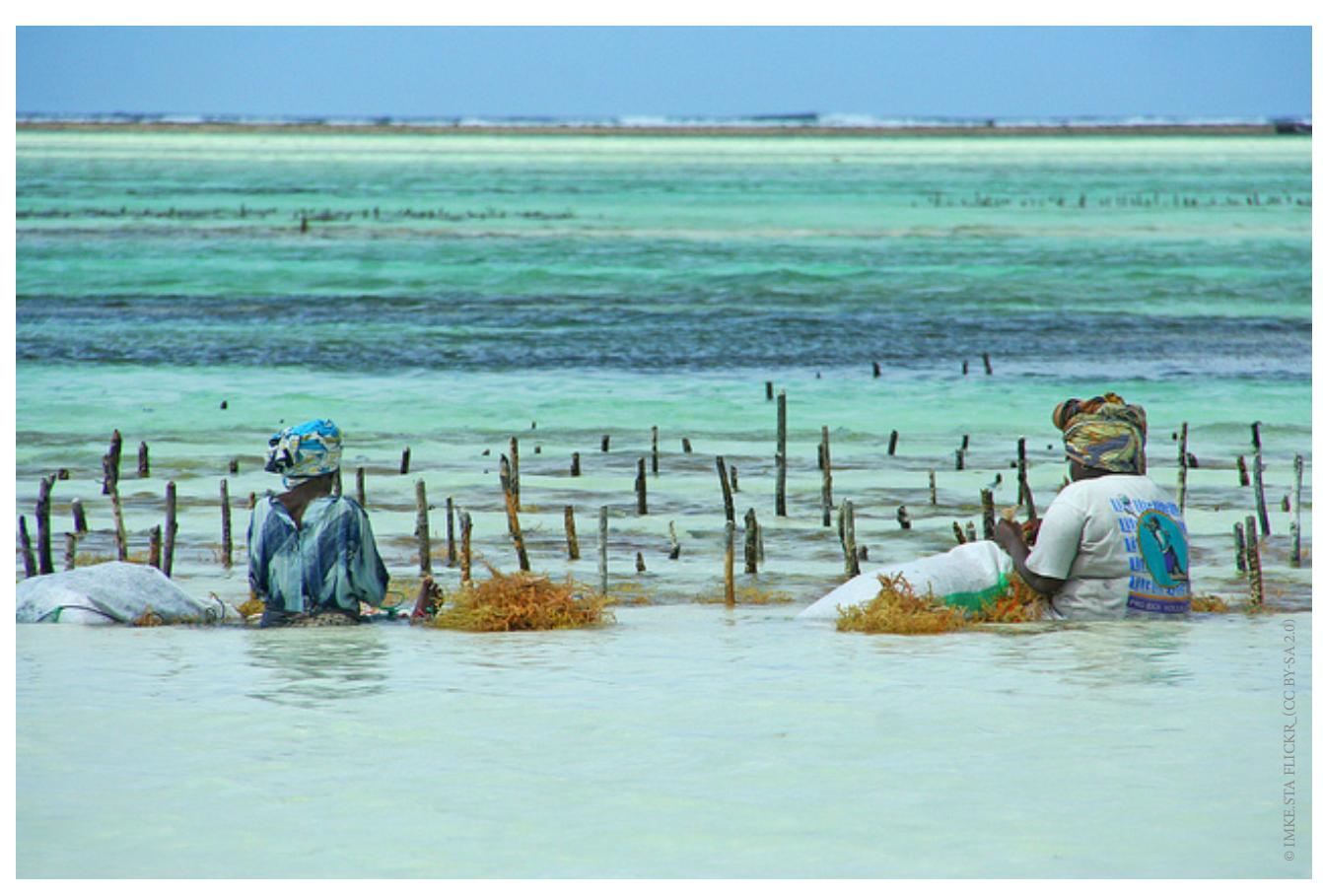
Harvesting of seaweed in Tanzania.

smallholder farmers to transform and identify how this transformation can look like, in collaboration with scientists and the farmers.