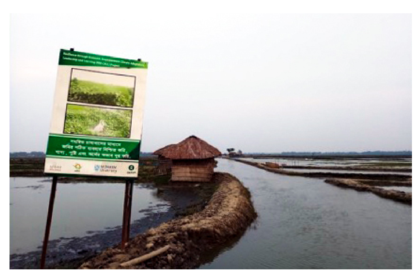
Traditional shrimp-farms created by inundating paddy fields with saline water.

One of the first tasks of the report will be to understand the genesis of shrimp-cultivation in the region and locate it within the global context of commercial shrimp-farming as a sub-set of the fisheries sector. This will be followed by a description of the particular farming practices prevalent in the region and the nature of supply chains integral to the process. The report will then undertake a review of the documented challenges and critiques within the sector such as its environmental impacts, relationship to food security, and social-structural factors affecting the production process. This discussion will be carried out within the context of the existing policy framework and its various blind spots. The report will then conclude by pointing to the knowledge gaps and potential for future research and policy interventions.