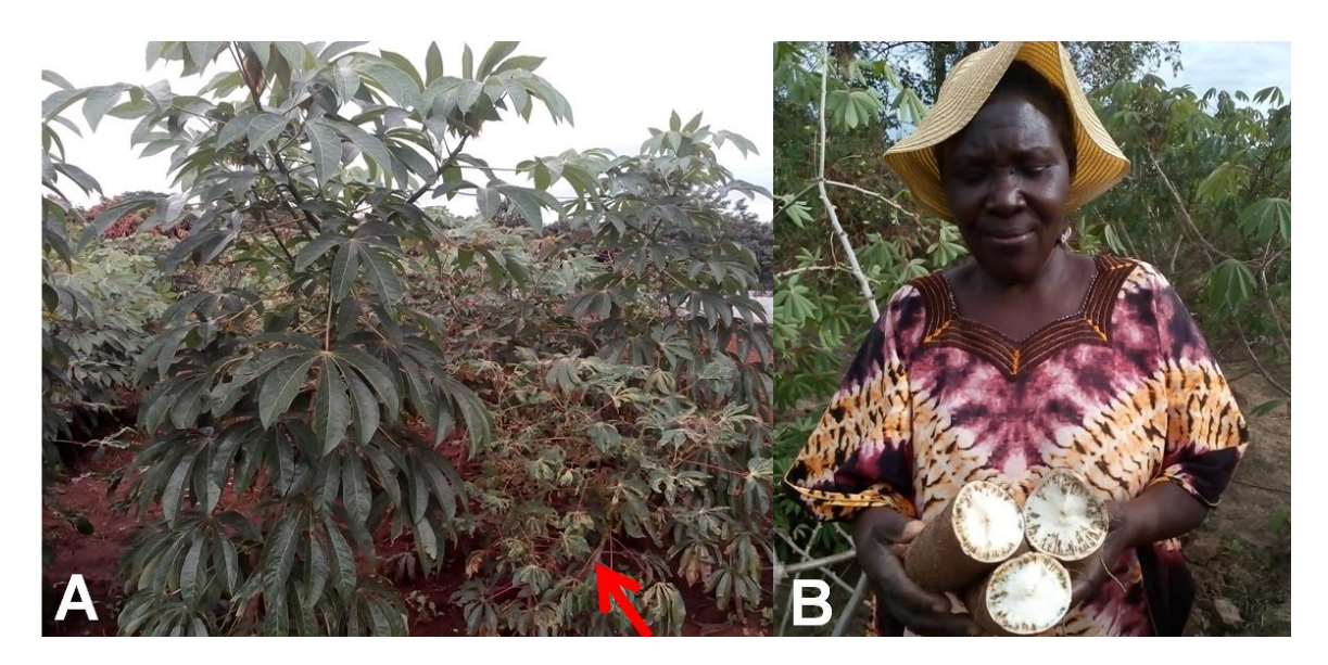
Figure 1. Sypmtoms of cassava virus diseases: A) a popular landrace ( Bao ; with arrow) in northern Uganda severely stunted by CMD compared to the adjacent CMD resistant variety TME204, B) a farmer from Serere district (eastern Uganda) displaying roots with early stages on necrotic lesions (brownish dead tissues) due to CBSD on a recently relesead cassava variety NASE19. (Photos: Courtesy of Settumba Mukasa).

more than 50% yield loss in susceptible varieties and the more devastating CBSD can cause up to 100% yield loss (Legg et al. , 2017) through associated root necrosis and rotting (figure 1). Both diseases continue to be key biotic stresses that severely limit optimal cassava productivity; yet, they could be managed through use of pathogen tested or virus-free planting material and phytosanitation procedures through government mediated inspection and certification services.