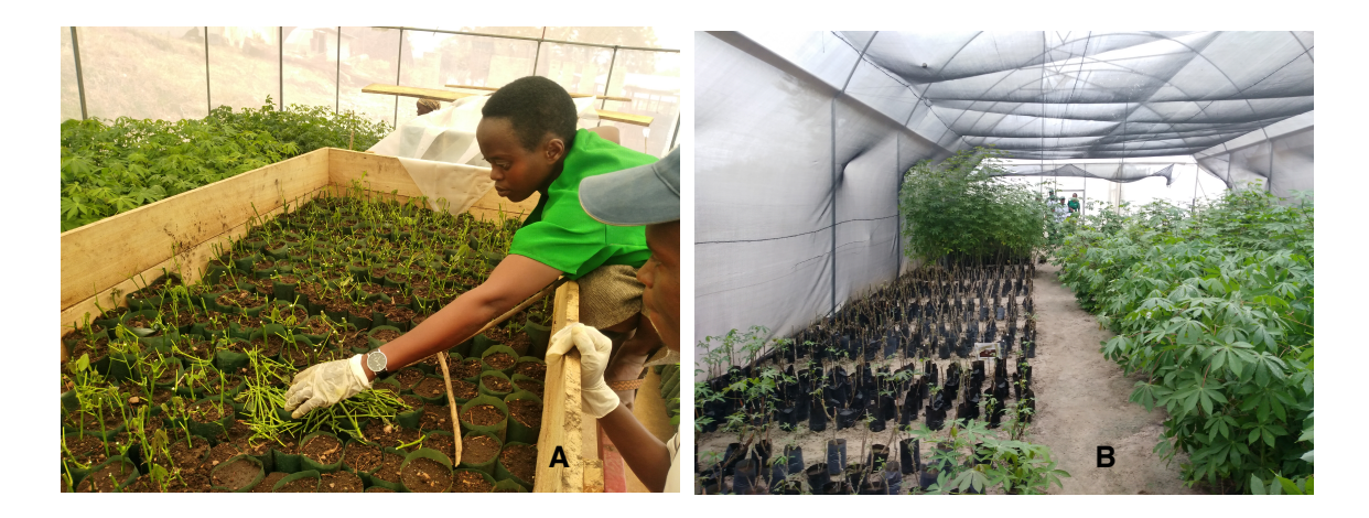
Figure 3. Multiplication of cassava planting material using mini-cuttings (minisets). A) establishment of minisets in a humidity chamber, B) cassava plantlets ready to plant in the field as basic seed to provide certified seed.