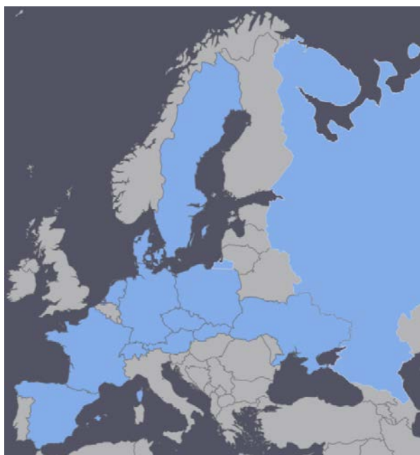
Figure 1. Map showing European countries where Xyleborinus attenuatus has been reported in blue colour.

In conclusion it is assessed that X. attenuatus is widely distributed within EU according to the criteria defined in regulation (EU) 2016/2031; Annex I; p.73 (Fig. 1).