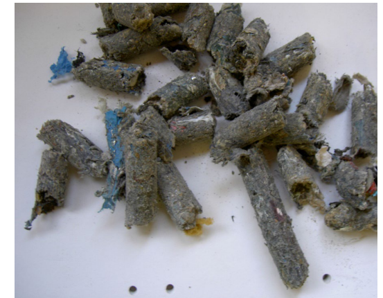
“Solid recovered fuels”