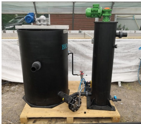
Micro-algae floatation tank