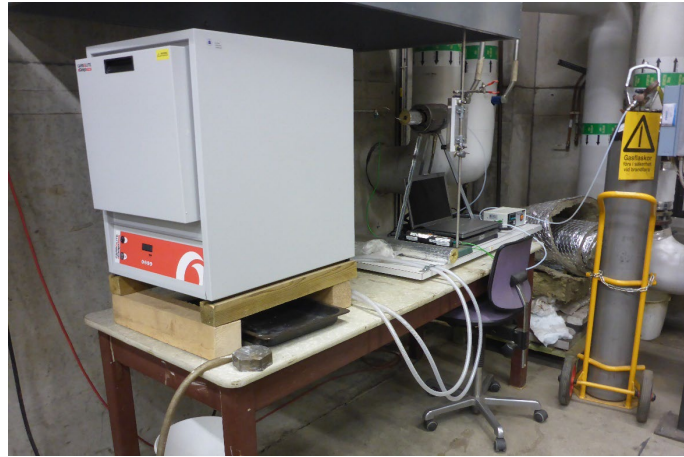
High-temperature oven Gas emissions and control