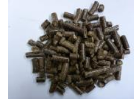
Reed canary grass