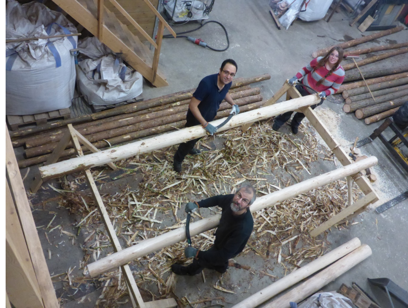
Aspen, birch, Scots pine, and Norway spruce stemwood chips