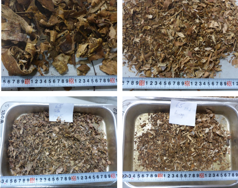
Inner and outer birch bark