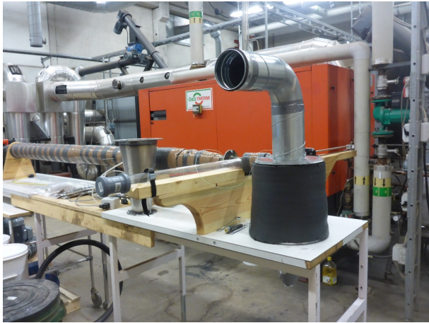
Cyclone dryer For wet and sticky materials