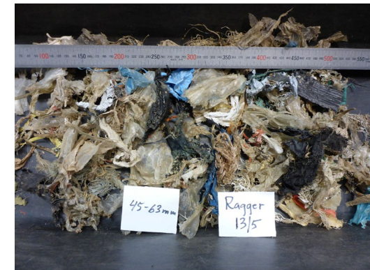
Sorted recycled materials