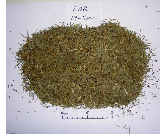
High concentration of Norway spruce needles