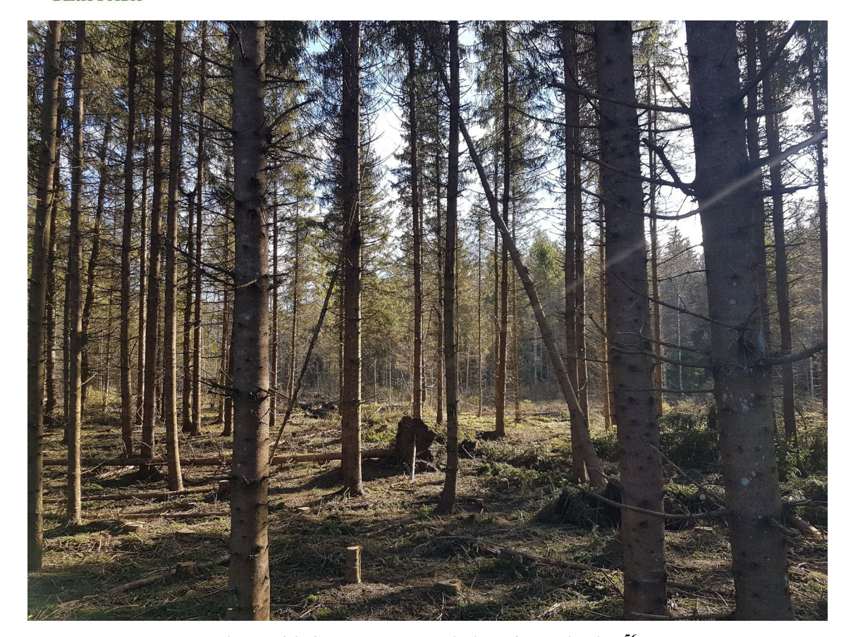
Figure 46: Stand characteristics after thinning<sup>56</sup>.