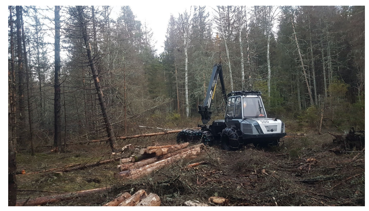
Figure 47: Harvester Malwa<sup>57</sup>.