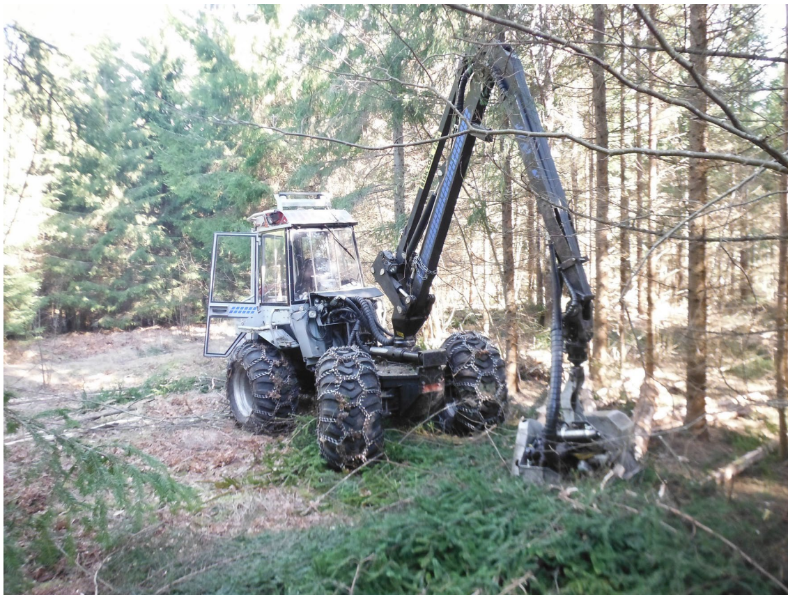
Figure 7: Harvester Vimek 404 T5 in thinning 9 .

RPM,); harvester width 1.8 m (with large tyres – 2.15 m), length – 3.35 m; tyre size 405/70-24; MOWI 2046 crane reach distance 4.6 m, weight 400 kg; clearance – 40 cm; harvester weight – 4400 kg; fuel consumption – 4 L per hour; control system – Motomit IT. Forwarding is done using compact class machine Logbear F4000.