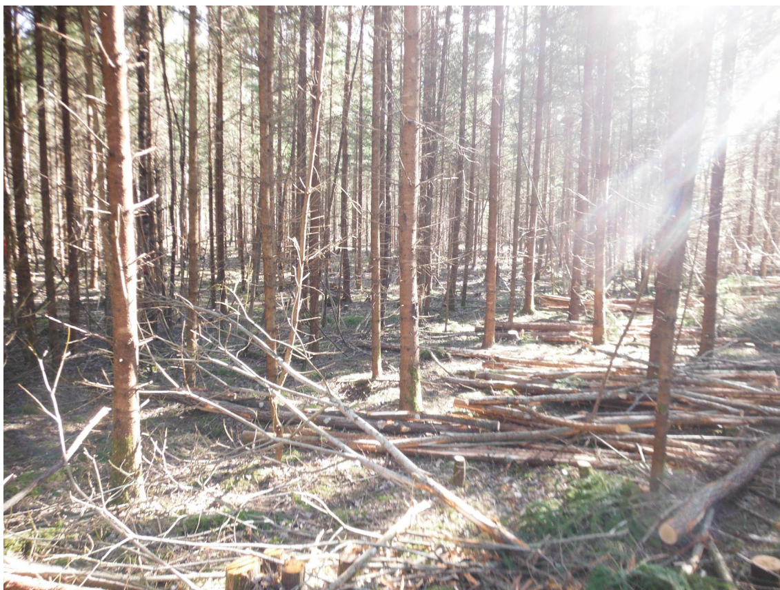
Figure 6: Stand characteristics after thinning 7 .