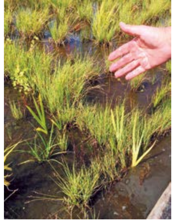
Testing aquatic plants for floating vegetative Islands.

If an experiment succeeds in a small test surface, usually about 2 m<sup>2</sup>, the next step involves scaling up to about 200 m<sup>2</sup>, to test water-retention properties and exposure of plant material over extended time frames. Usually, it takes a few growing seasons to see how systems behave over the long term. After this has been done the first-generation product goes full scale – covering between 1000 and 20 000 square meters, depending on the specific project and situation. To optimise for local conditions, each new project develops and tests logistics, substrate/carriers and vegetation.