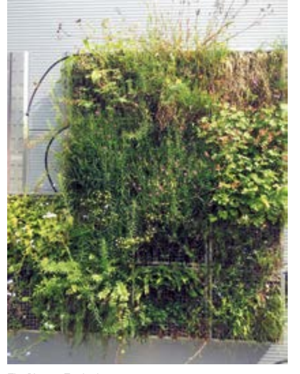
The Biotope Testbed: Vertical Meadows.