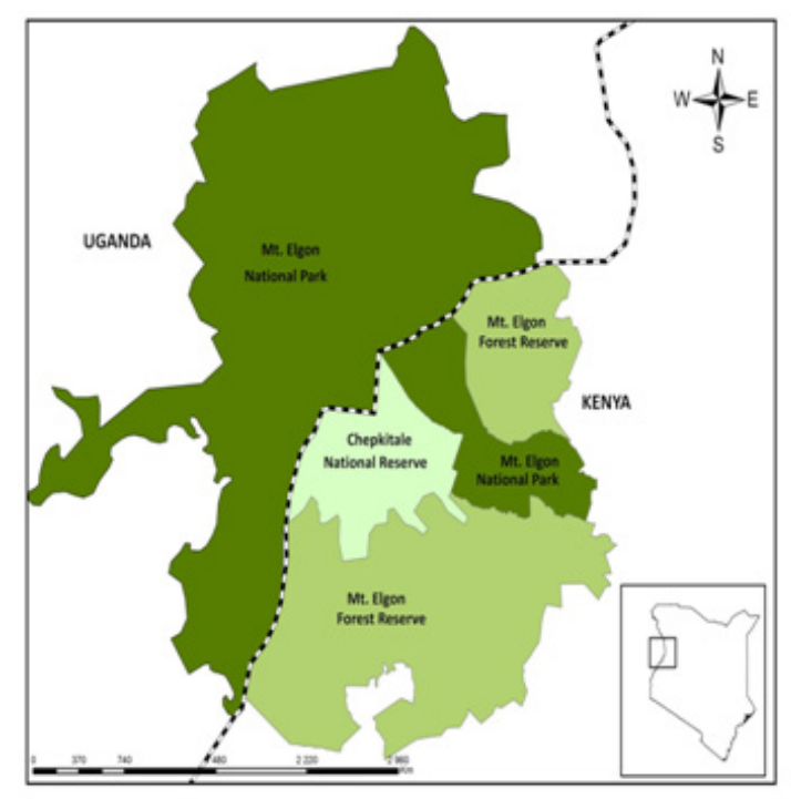
Figure 3: Mt Elgon protected areas, Kenya and Uganda Mt Elgon Forest Reserve was established for the extractive use of the forest resources from both the indigenous forests and the established softwood plantations and is managed by the Kenya Forest Service.

The Chepkitale National Reserve establishment allows con-sumptive use such as grazing, bee-keeping and collection of non-timber forest products such as herbal plants.