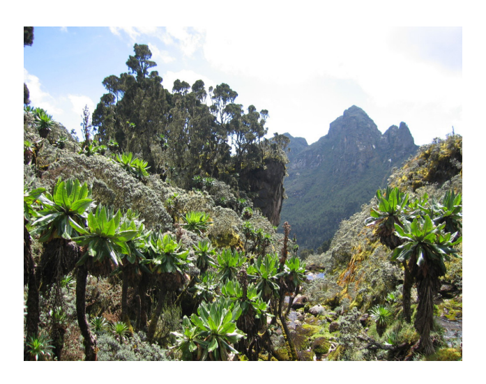
Figure 1: Mount Elgon Peak, Kenya Wildlife Service, 2014

Efforts both now and in the future need to ensure it's special designation is protected, conserved and monitored. Strategic policy changes and implementation is the main way to approach would ensure commitment an and continuity in conservation.