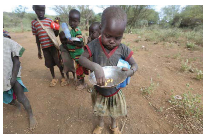
Figure 2: The face of food insecurity as Climate change takes atoll (Photo courtesy of Standard Newspaper, May, 2019).

A change in the system of thinking requires education which serves as the vehicle to combating climate change. The platform for climate change education enhances collaborations with various sectors in society thereby making it sustainable and impactful in ensuring food security. In particular, education can enable society