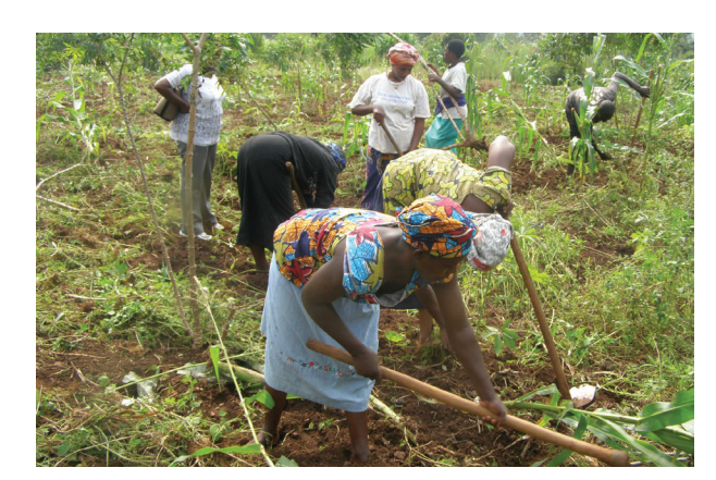
Figure 5: Climate change Education empowers a community to be Climate Change resilient

Climate change education is an intervention that will simultaneously enhance gains in agricultural productivity, build resilience to climatic and weather shocks as well as reduce emissions intensity from agriculture and food systems by adapting to efficient practices (KCSAIF, 2018). Through climate change education, it becomes easy to implement and also to spur climate smart innovation that tackle food insecurity in Kenya. The Climate Change Act 2016 Section 15 provides for public entities to coordinate mainstreaming of climate change issues into sectoral strategies, plans, programmes