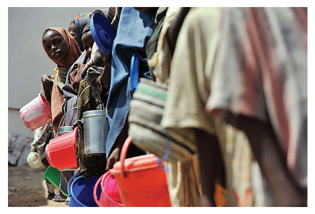
Figure 4: Food Insecurity Effects with endless queues for food rations