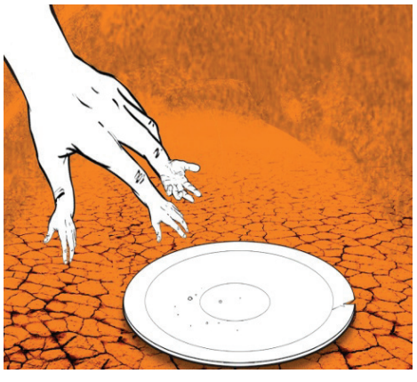
Figure 7: The future of food security in Kenya without Climate Change Education (World Bank Group, 2017).