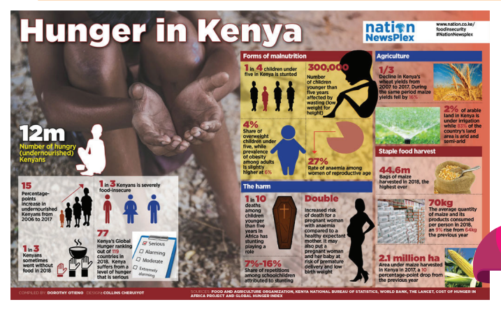
Figure 8: The harsh reality of Food insecurity in Kenya

shifts to mitigation and adaptation of climate change and food security through introducing new food varieties and the enhanced nutritional foods from the traditional ones as indicated by World Bank group. Through climate change education, there shall be a shift from traditional foods and cereals to better improved nutrition and overall health of the population thus increased food security by 2050 through demand for non-cereal crops.