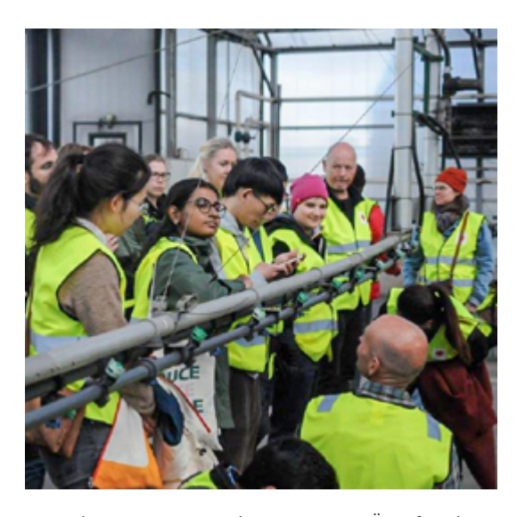
A study visit to Nässja plant nursery in Österfärnebo was included in the course.