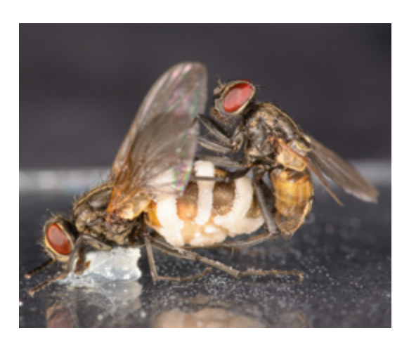
A male fly mating with a dead female fly infected by a fungus.