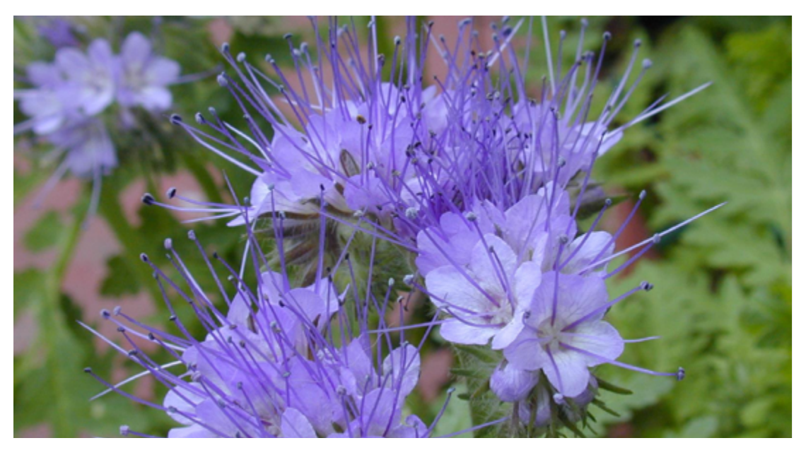
Lacy Phacelia in flower strips attracts pollinators.