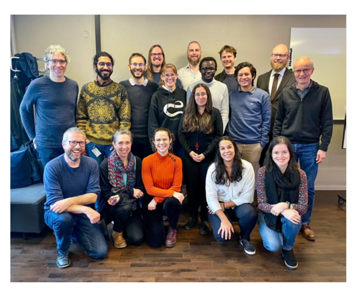
The participants at the CBC team meeting in Uppsala.

and campus Alnarp participating. During the day, the team members gave each other updates on ongoing research and talked about future collaborative projects and interesting and important ways to take biological control research further.