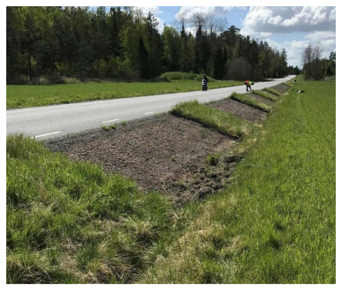
Figure 42. Experimental scraping and unscraped islands of vegetation. Uppsala, province of Uppland, Sweden.