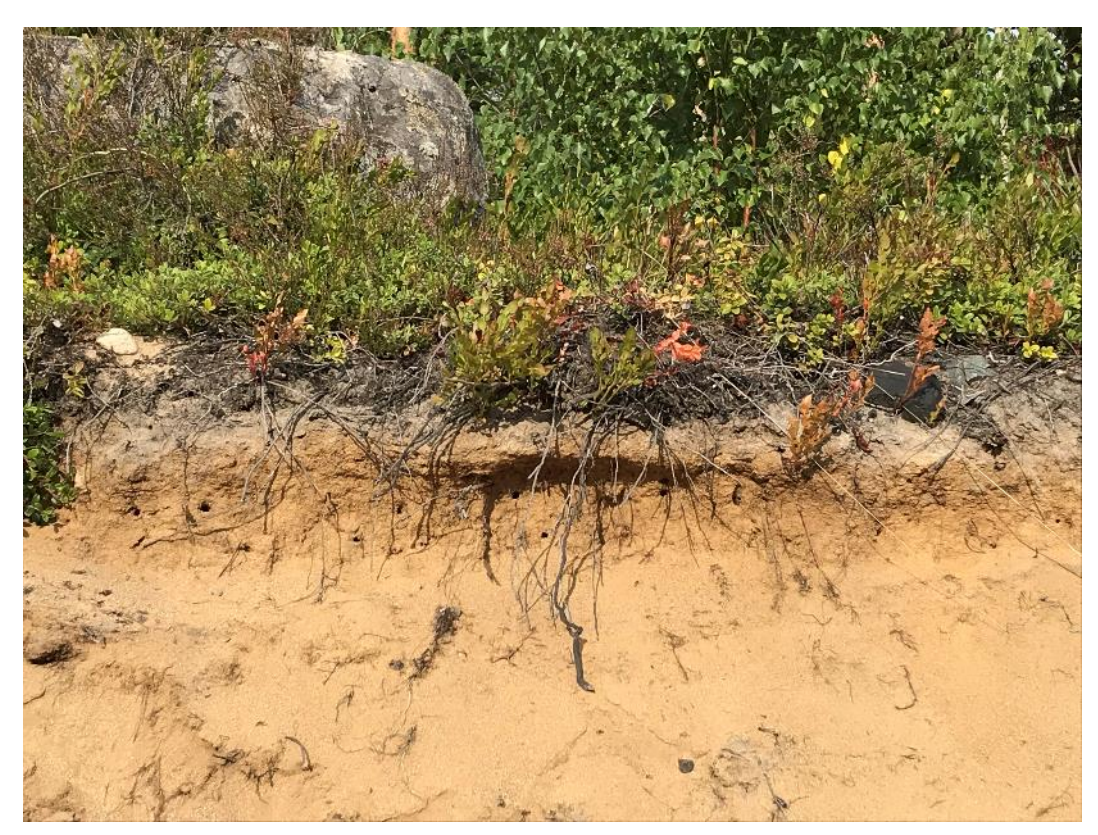
Figure 39. Sandy roadside slope with frequent nest cavities for digging insects. Lindesberg, province of Västmanland, Sweden.

Considering that road construction includes considerable manipulation of the soil, and creates escarpments and embankments with new and often designed soil surfaces, better knowledge of relationships between soil properties and roadside vegetation and invertebrate fauna is crucial in order to favour roadside biodiversity. We encourage specific reviews of literature on soil—vegetation and soil—invertebrate relationships, as well as new research, preferably with a focus on biodiversity conservation issues.