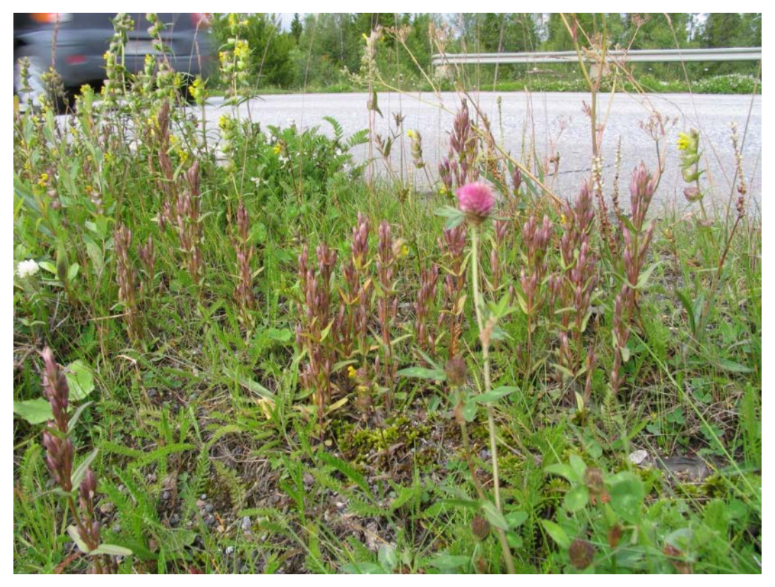
Figure 10. Gentianella amarella, province of Härjedalen, Sweden.

It has been suggested that the importance of roadsides for conservation may have been overlooked. Rentch et al. (2013) claim that roadsides have largely been excluded from vegetation studies in the USA because they have been considered as unnatural or wasteland. However, in their study of vascular plants flora of roadside habitats in West Virginia, USA, they documented 467 species of which 325 were natives.