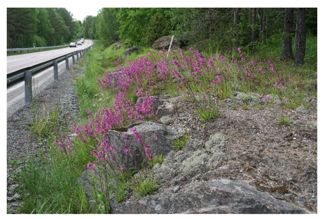
Figure 12. A typical structure in roadsides through rocky terrain is bare bedrock with no or thin soil cover. Many plant species adapted to such microhabitats are spring-flowering, thereby taking advantage of the soil moisture before the summer heat. Viscaria vulgaris, Gölja, province of Västmanland, Sweden.

In summary, although many studies of biodiversity in roadsides test correlations between biodiversity and different habitat features, there is a large need for reviews and studies of mechanisms for the relationships between species and their microhabitats. In particular, the importance of basic environmental conditions (climate, soil type, sun exposure, species pool etc.) and different processes (natural and anthropogenic ones, e.g. vegetation management, soil disturbance etc.), needs to be highlighted.