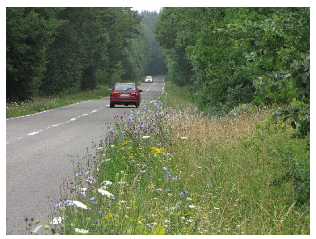
Figure 35. Road at forest edge; the shading ends the species-rich vegetation. Province of Öland, Sweden.