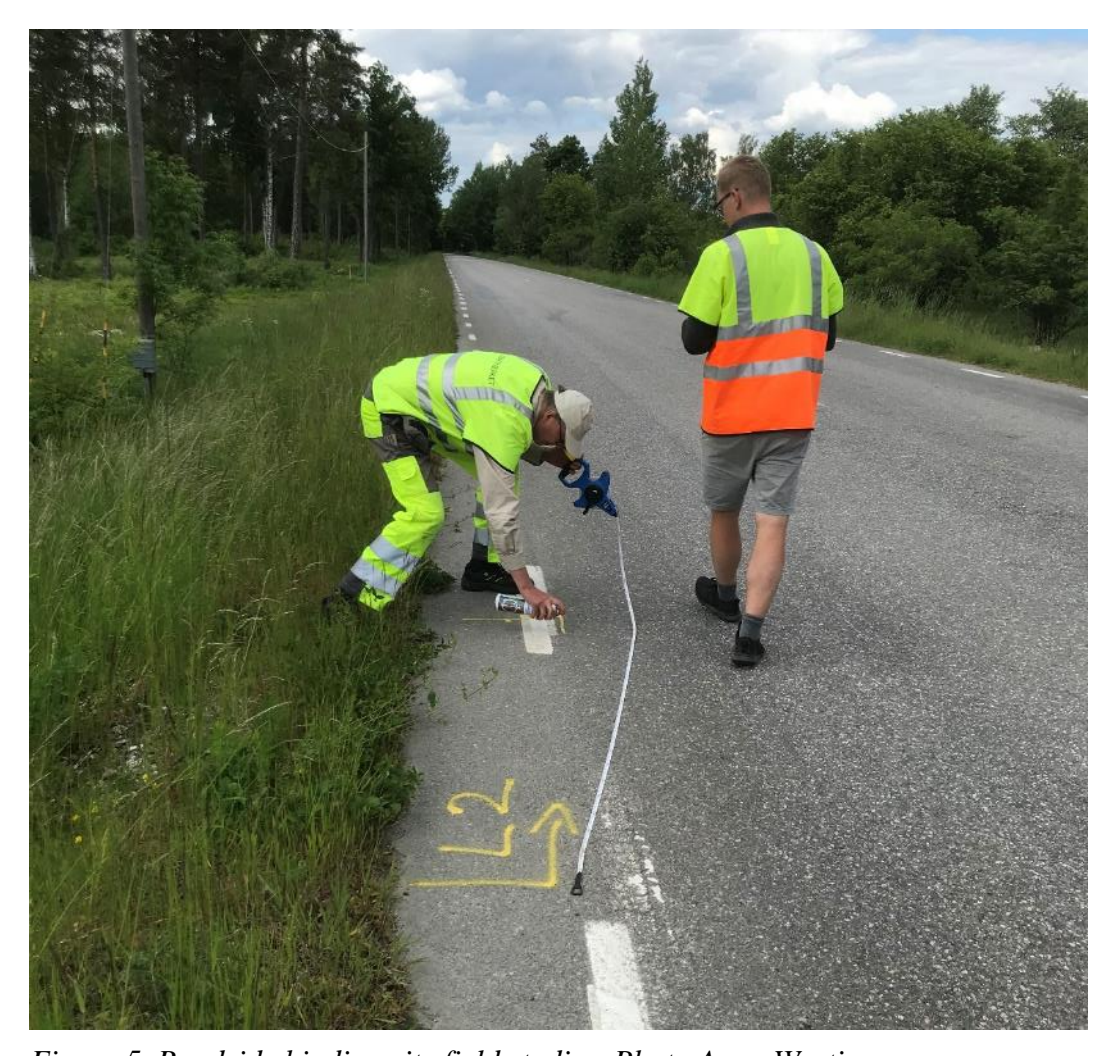
Figure 5. Roadside biodiversity field studies.

One clear result of this EPIC-roads review, as well as of many other reviews, is a scarcity of studies that follow a change over time, for example, the result of a management practice. Of the 91 studies reviewed by Villemey et al. (2018) all but three used experiment-control design, not before-after design (or before-after-control design).