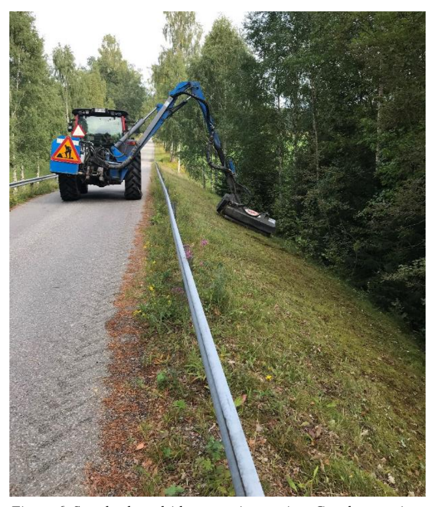
Figure 6. Standard roadside vegetation cutting. Grönbo, province of Västmanland, Sweden.

If biodiversity is mentioned as a goal for adapted cutting regimes, increased flower richness and plant species richness are common targets. Another common target is establishment of native vegetation, e.g. prairie vegetation (Johnson 2008), heathland vegetation (Heemsbergen et al. 1989), or xerothermic habitats (Murariu et al. 2019). Guidelines also address favouring of ground-nesting birds (Johnson 2008) and pollinators (Hopwood 2010; van Rooij et al. 2014; Galea et al. 2016; Fox et al. 2019).