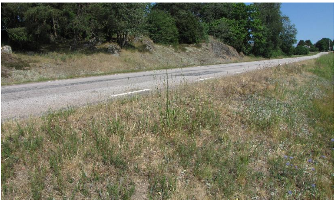
Figure 9. A certain mowing regime will show different effects on roadside plant species richness depending on productivity of the vegetation. Upper photo: nutrient-rich roadside with low species richness, Närtuna, province of Uppland, Sweden; lower photo: dry roadside, poor in nutrients but rich in species, Vedum, province of Västergötland, Sweden.