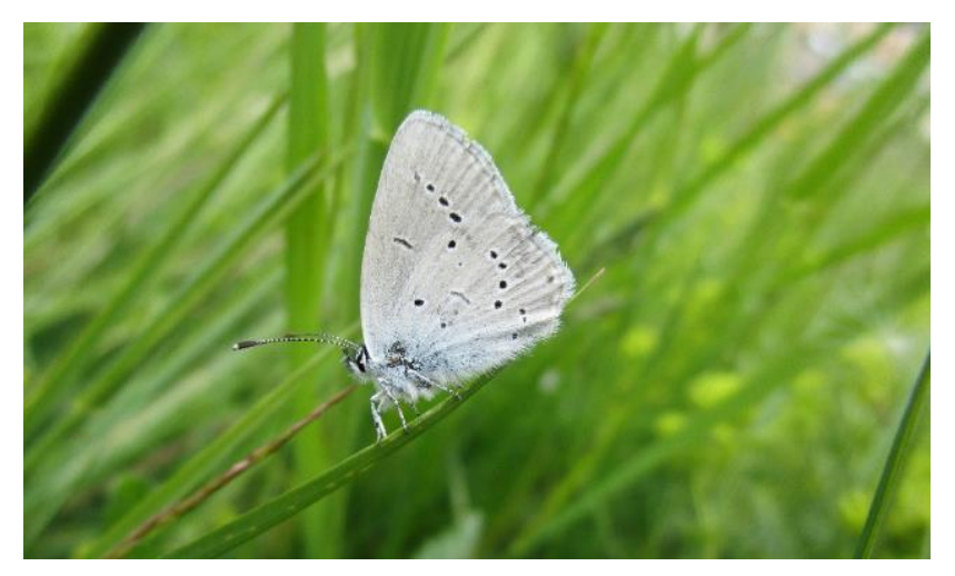
Figure 3. Small blue Cupido minimus.