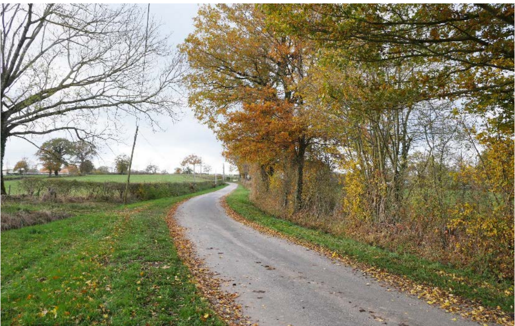
Figure 24. Upper photo: In many European landscapes, roads and field margins are bordered by hedges with or without tall trees. Uxeau, department of Saône-et-Loire, France. Lower photo: If the cutting of hedges stops, the hedges can develop diverse screens of trees and shrubs. Gilly-sur-Loire, department of Saône-et-Loire, France.