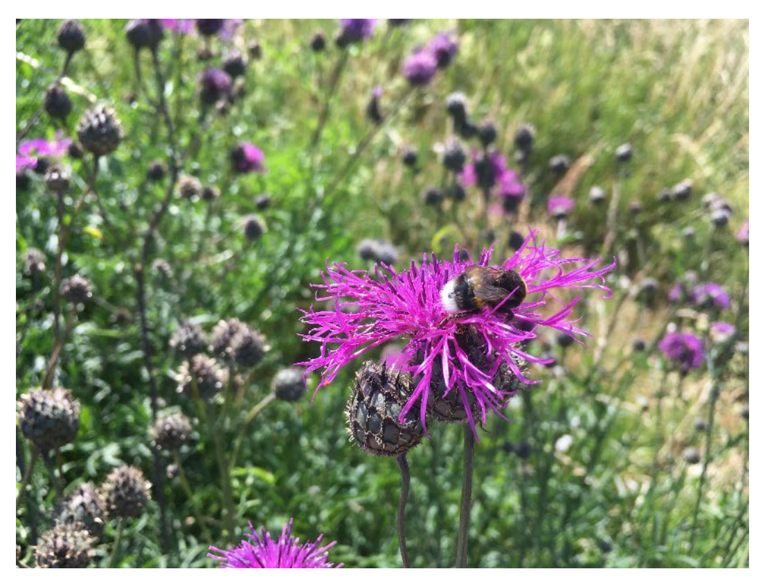
Figure 15. Bumblebee on Centaurea scabiosa. Province of Uppland, Sweden.

Van Halder et al. (2017) found a higher butterfly species richness in grazed grasslands compared to linear elements such as road verges and grassland strips between arable plots in three agricultural areas of France. Grasslands supported more specialised, more sedentary and less fecund species, which, according to the authors, underlines the more important role of grasslands compared to linear habitats, as habitats for specialist and threatened species. Road verges and other linear habitats supported more generalist species. In another study, diversity of dung-beetles was reduced up to 170 m from forest roads in a rainforest landscape of Borneo, Malaysia, was largely attributed to reduced abundance of specialist species (Edwards et al. 2017).