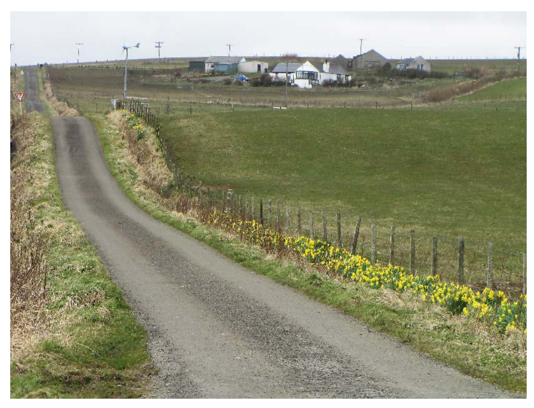
Figure 13. Daffodils are spreading along roadsides, Mainland Orkney Islands, Scotland.

Higher diversity and species richness are not necessarily indicators of better conservation status, habitat quality, or higher conservation value. Increased diversity and richness may be caused by the road introducing new conditions and microhabitats in the landscape. This creates new niches for other species than those occurring in the undisturbed landscape, including 'alien', or 'exotic', species of distant origin, some of which may be invasive. For example, in a French oak forest, the roads constituted the least common type of human-made habitat but contributed most (82%) to the diversity of vascular plants, through introducing native non-forest species (Baltzinger et al. 2011). Schultz et al. (2014) found roadsides in Australia to be the habitats contributing most to the diversity of exotic species in a mixed agricultural landscape. In the review by Suaréz-Esteban et al. (2016), much of the enhanced diversity in roadsides was due to colonisation by non-local species, while the authors noted that the studies had a bias towards exotic species.