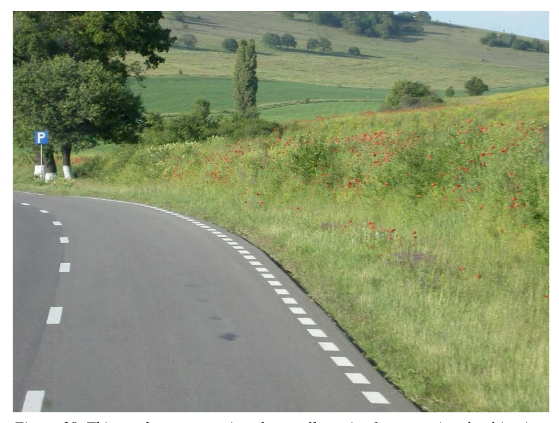
Figure 38. This road verge contains almost all species from rotational cultivation in semi-steppe. Babadag, County of Tulcea, Romania.