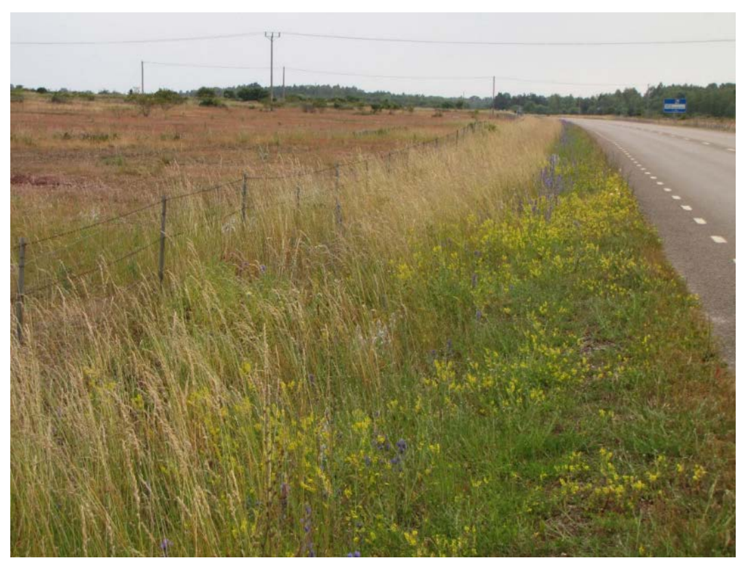
Figure 30. In this case, early cutting next to the road has increased plant species richness by suppressing competitive grasses, here Arrenatherum elatius, compared with later cutting. Södvik, province of Öland, Sweden.

These examples show that the timing of cutting may have contrasting effects on plants in different types of roadside habitats and different landscapes, and that timing of cutting should be adapted to the habitat and its species in order to favour biodiversity. For example, early cutting in Portuguese road verges has been shown not to influence the seed production of Mediterranean plant species negatively (Simões et al. 2013). This is largely because early cutting resembles the traditional grazing that has formed the surrounding habitats and their flora.