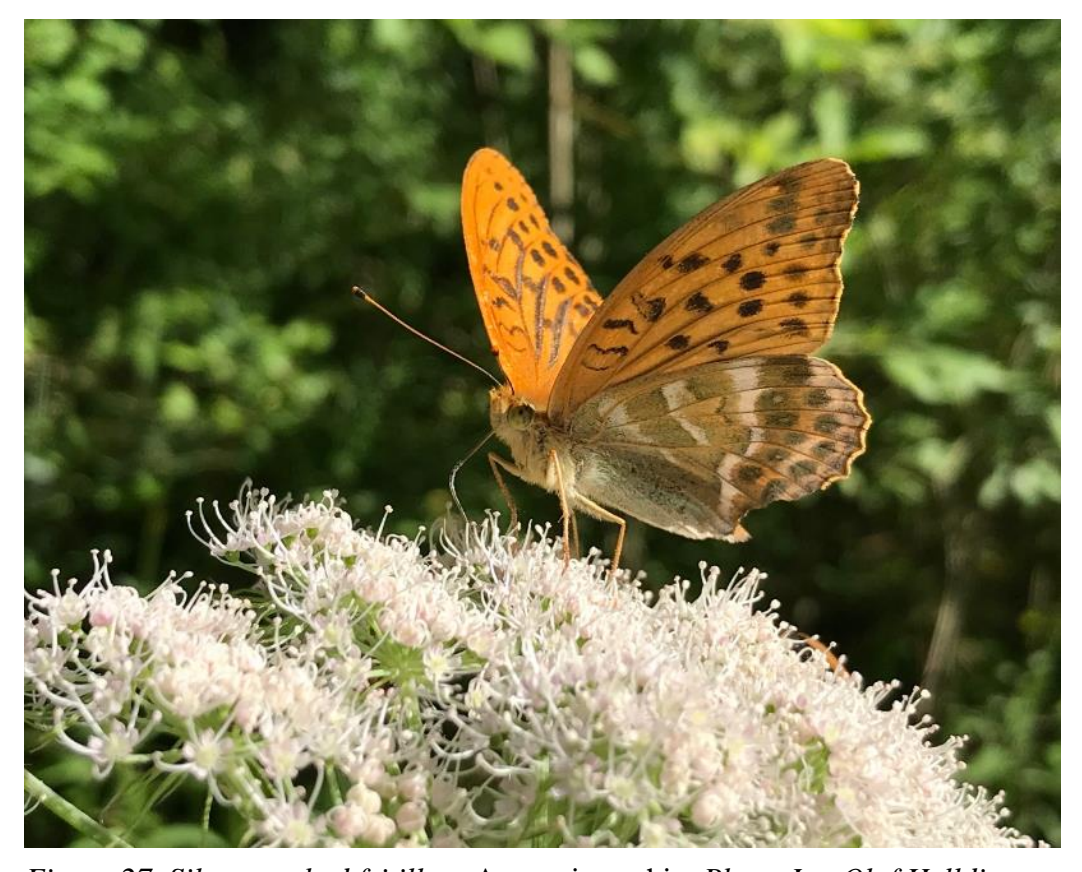
Figure 27. Silver-washed fritillary Argynnis paphia.

Several studies have shown that host plant abundance, and sometimes also their suitability as host plant, explains patterns of insect abundance and distribution in roadside habitats (e.g. Kasten et al. 2016 and Daniels 2017 in USA, Riva et al. 2018 in Canada). The dependence of host plants links insects to a number of habitat conditions and processes that influence plants. In a Dutch study of several insect groups in relation to plant species richness the diversity of weevils, but not of other groups, was significantly correlated with plant species richness (Raemakers et al. 2003). Weevils is a plant eating group with several species being specialised on single or a few plant species.