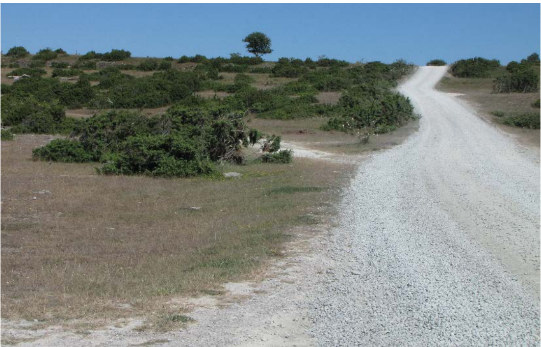
Figure 11. Habitats in dry regions are characterized by no or low cover of trees and of sparse, seasonal herbaceous vegetation. Here, a road makes little difference in terms of openness and occurrence of bare soil. Upper photo: Tomillar vegetation, Torrevieja in the province of Alicante in coastal southeastern Spain; lower photo: Alvar vegetation, Jordhamn, province of Öland, Sweden.