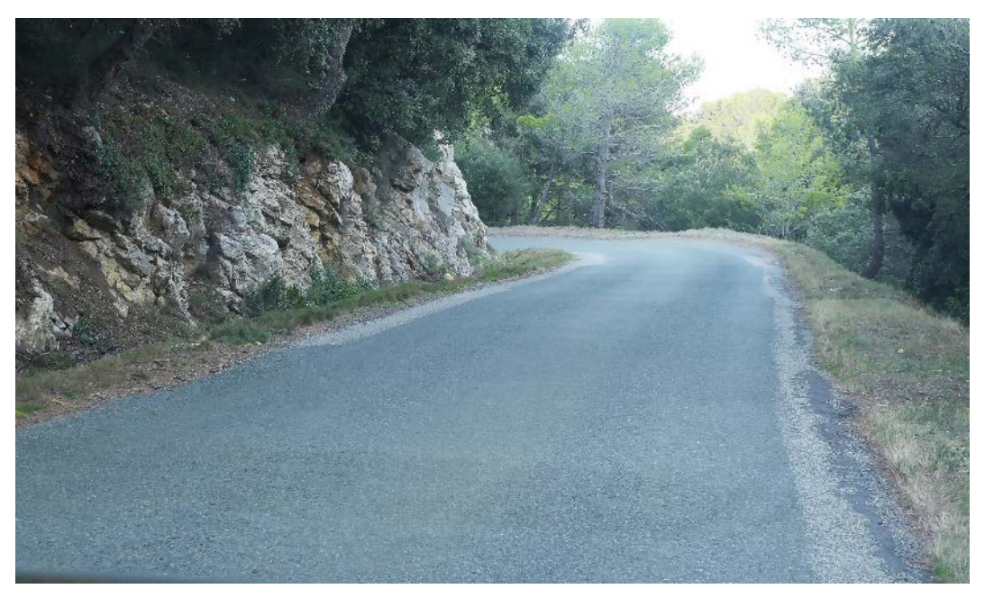
Figure 33. In Mediterranean vegetation many species of vascular plants, lichens and bryophytes are adapted to bare rock surfaces. Carcassonne, department of Aude, France.

sizes than ants inhabiting abandoned fields (Zhu and Wang 2018); this is likely partly a result of the disturbance frequency in road verges. Palfi et al. (2017) showed similar results in a study of seed-dispersing ants along roads in Australia. Frequent activities that disturb the soil close to the road create conditions unsuitable to most ant species, except for a few generalist species. King and Tschinkel (2016) found disturbed roadside plots in Florida to attract queens of most of the occurring ant species, trying to establish new colonies. However, successful colony establishment was primarily achieved by the exotic fire ant Solenopsis invicta , whereas native species commonly failed to establish colonies.