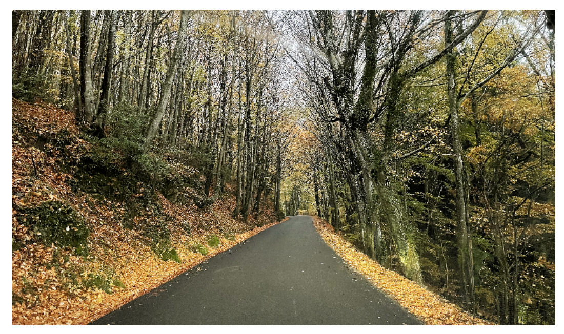
Figure 16. A narrow road through a forest hardly constitutes a barrier for birds and flying insects dwelling in the canopy. For ground-living species, on the other hand, the paved road is a very different environment compared to the forest floor. Ferrals-les Montagnes, department of Hérault, France.

Roads are known to contribute to the fragmentation of habitats in the landscape, and function as barriers for the movement and dispersal of animals. Barrier effects have mainly been studied for (large) vertebrates, but there are also examples of effects on insects (see review in Muñoz et al. 2015; see also Delgado et al. 2013a and b). These reviews show that several road-related factors contribute to increasing habitat fragmentation, of which the most important seems to be vehicle-caused mortality, barrier effects, edge effects and habitat loss.