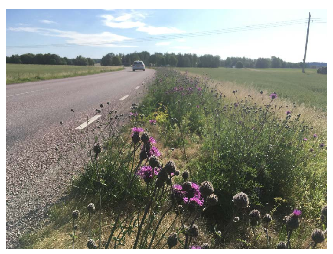
Figure 14. The role of road verges as a habitat for invertebrates is increasingly important in heavily managed agricultural areas. Road verge with Centaurea scabiosa, an important plant for many pollinators. Province of Uppland, Sweden.

even country, and the species today may be regarded as 'roadside specialists' (e.g. Schultz et al. 2014; Helldin et al. 2015).