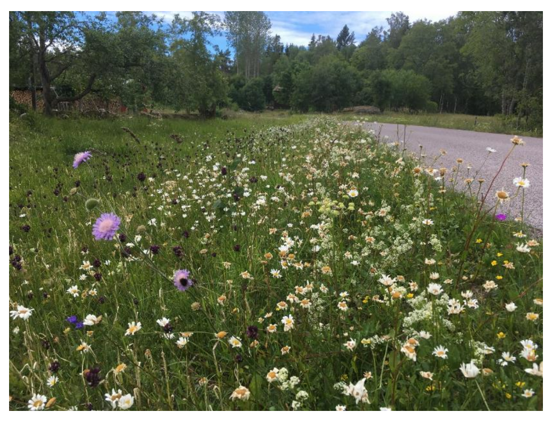
Figure 1. Flower-rich road verge, Gräsö island, province of Uppland, Sweden.

Third , we have interpreted the key results in an applied perspective, in particular their implications for construction and maintenance of road verges.