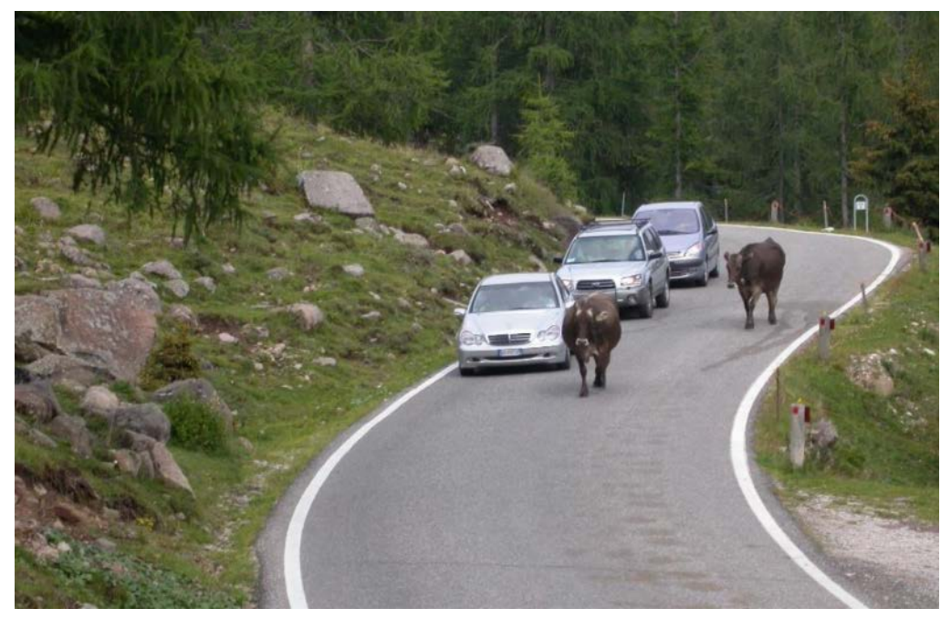
Figure 37. Roads running through active semi-natural pastures may harbour a large proportion of the pasture biodiversity. Province of Belluno, Italy.

species of these habitats (Forman and Alexander 1998; Lunt and Bennett 2000; Spooner 2015). On the other hand, other types of roadside management that are less similar to natural disturbance regimes may have negative impact on biodiversity. One example is mowing, which has been shown to have negative impacts on plant species richness in some Australian landscapes (see review by Forman and Alexander 1998). In Brazil, road verges harbour 70% of the plant species found in Cerrado wooded savanna (Vasconcelos et al. 2014).