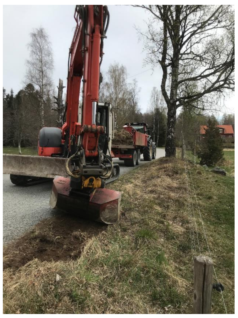
Figure 41. Regular road maintenance include many activities that cause physical disturbance to the ground and field layer. Grönbo, province of Västmanland, Sweden.

This review has found several studies that implicitly, but rarely explicitly, indicate that mechanical disturbance of the ground is an important ecological process in roadside environments, and that many species-rich roadside habitats are formed and maintained by such disturbance. A systematic approach to research on ground disturbance in roadside habitats is however lacking, which we believe constitutes a critical deficit in our knowledge about roadside ecology.