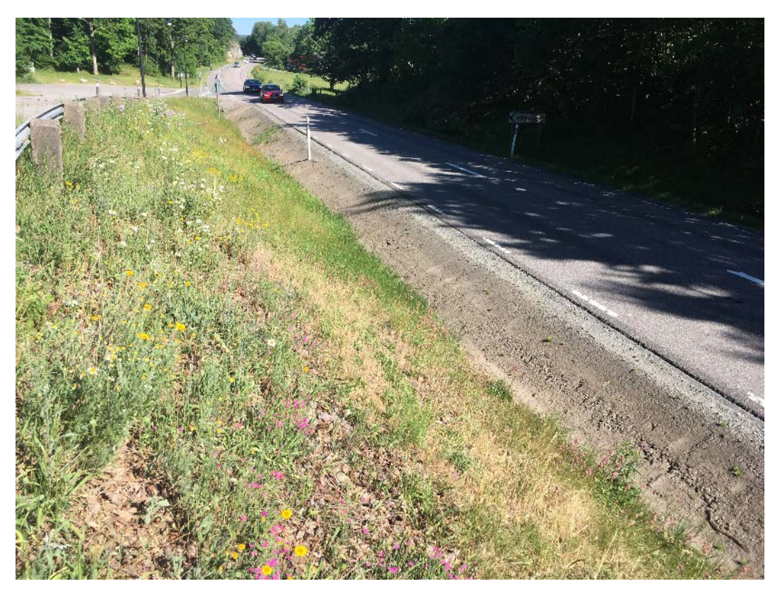
Figure 28. Recently graded road embankment. Province of Bohuslän, Sweden.

In many contexts disturbance is something negative that should be avoided. In plant ecology, however, it is not. On the contrary, a wide range of habitats are formed and maintained by certain types of disturbance, and, consequently, a large number of species are adapted to and dependent on disturbance. A key task in biodiversity conservation is often to restore disturbance regimes, either natural, such as fire regime in boreal forest or flooding regime in a river, or semi-natural, such as traditional grazing and mowing regimes in pastures and hay meadows. Disturbances may be frequent and regular, such as annual mowing, or less frequent, such as grading of embankment and ditches, or drought episodes. Roadside management is a disturbance regime that influences both ground and vegetation, and is a prerequisite for roadside habitats and their biodiversity.