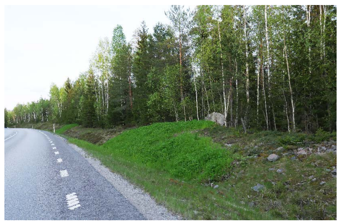
Figure 20. The topsoil may contain a species-rich seed bank, but, due to decomposition of organic matter, often becomes too nutritious for high species-richness. Vittinge, province of Västmanland, Sweden.

nitrogen deposition. Garcia-Palacios et al. (2011) studied the vegetation succession over 20 years in Spanish road verges, and found the succession towards a 'climax vegetation' to be accompanied by an increase in soil nitrogen and carbon due to a gradual increase of organic matter in the soil.