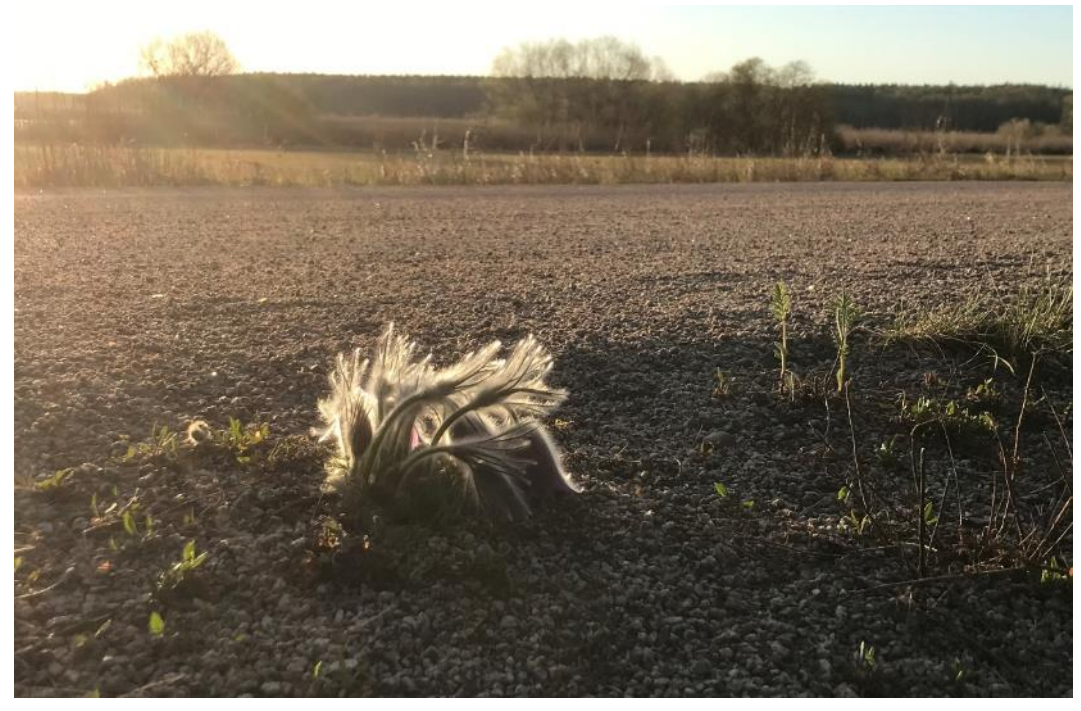
Figure 32. Pulsatilla vulgaris in road verge. Uppsala, province of Uppland, Sweden.

surprising as endemic plants on isolated islands are usually considered to be disfavoured by human presence. The authors interpreted the effects as the result of new cliff surfaces in the road construction, in combination with the protection from negative disturbances such as fire and grazing by introduced herbivores, mainly rabbits and goats.