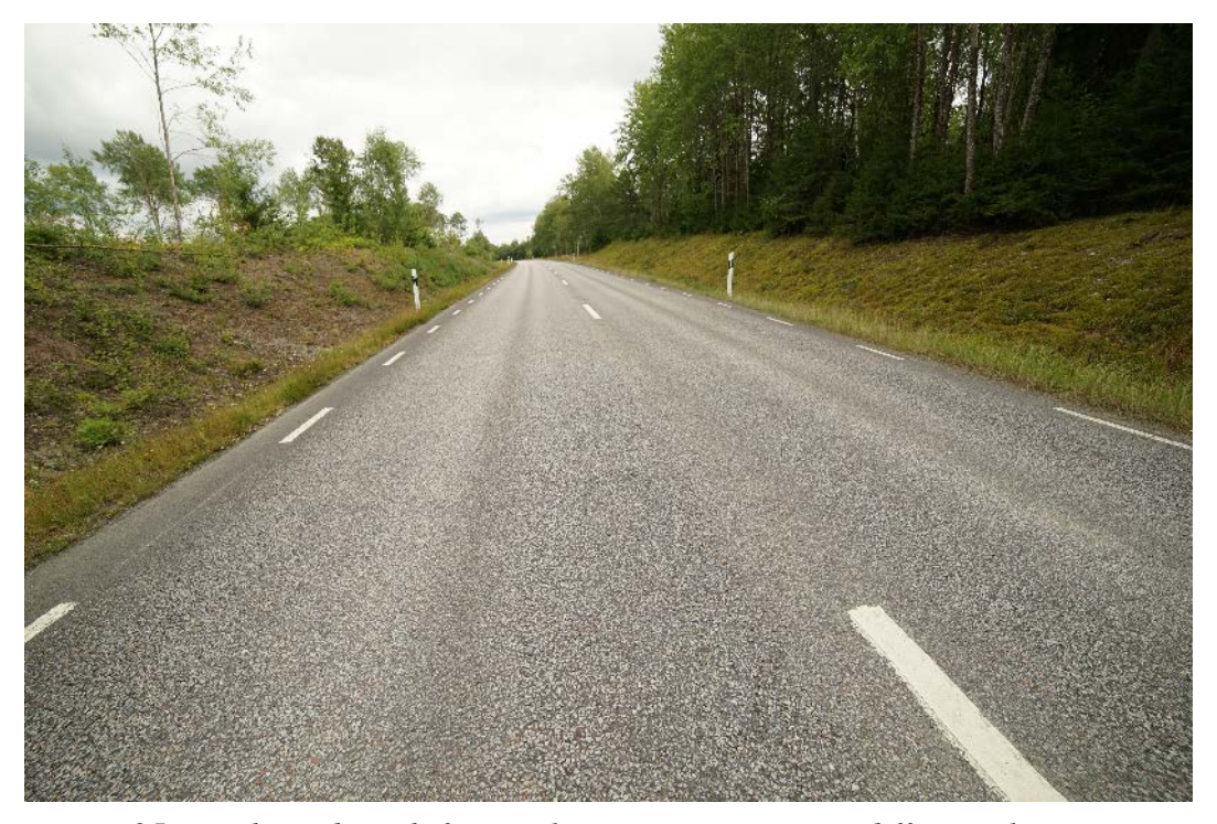
Figure 25. North- and south-facing slopes experience very different climatic conditions, which is reflected in the vegetation. Here, the north-facing slope (to the right) is dominated by few species of mosses while the south-facing slope has a rather species-rich flora of vascular plants, especially species adapted to sun and drought. The sun exposed slope has sparse vegetation cover, which favours wild bees and other digging insects. Arlanda, province of Uppland, Sweden.

cover of vegetation in south-facing slopes, compared to 78% in north-facing slopes. Several studies from ecosystems other than road environments indicated that evapotranspiration is one of the main mechanisms for the effect of slope angle and aspect on vegetation (Cerdà 1998; Kuitel and Lavee 1999; Bennie et al. 2006). The ecological effects of slope properties are therefore linked to and interacting with effects of sun, temperature, drought, and ground disturbance by erosion. Due to erosion risks, the benefits of creating slopes for biodiversity are often seen as problematic in practical road administration, and the flattest possible slopes are therefore recommended (Johnson 2008). There are rather few studies on aspect effects on roadside vegetation; only seven articles were found in our screening. Some of these studies failed to prove significant aspect effects when testing for effects of several environmental variables simultaneously (e.g. Cousins and Eriksson 2001; Akbar et al. 2010). Such results cannot, however, be interpreted without knowledge about which type of slopes were studied.