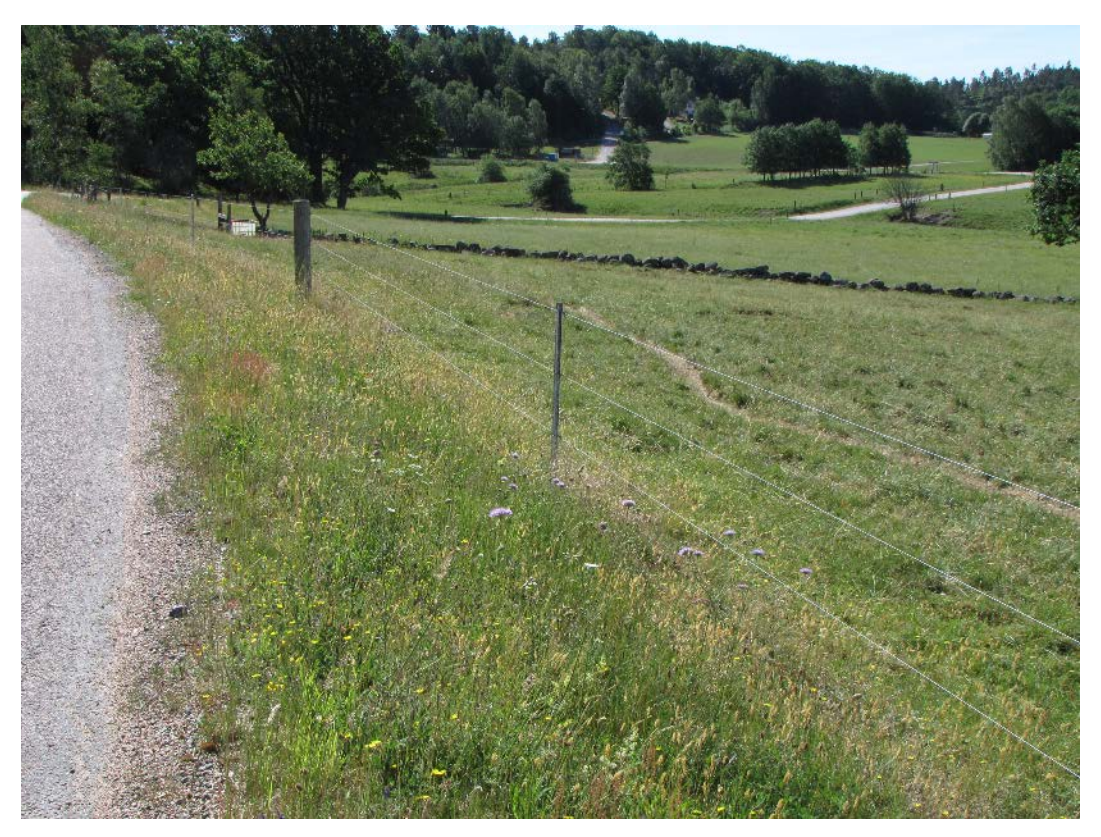
Figure 36. In this case, the roadside habitat can be seen as an extension of the grazed pasture, but better for mowing-adapted early-flowering species. Orust, province of Bohuslän, Sweden.

than the surrounding landscape, and they may mainly have negative effects on the indigenous biodiversity, through reducing the area of (forest) habitats and favouring non-local species, including species that threaten local biodiversity (cf. sections 3.1 and 3.2).