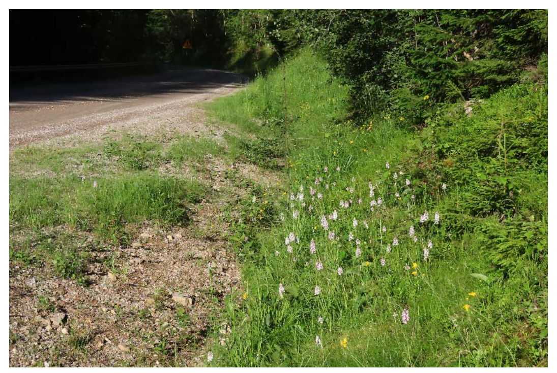
Figure 18. Roadside ditches can occasionally develop certain types of fen vegetation which, together with openness, favour wetland plants, e.g. the orchid Dactylorhiza maculata. Norberg, province of Västmanland, Sweden.

locally rare species in roadside ditches in Poland, 46% of which only occurred in these roadside habitats. Swengel and Swengel (2011) showed that bog butterflies in Wisconsin, USA, frequently visited lowland ditches along roadsides, and that they utilized a variety of nectar sources.