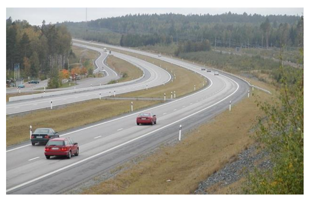
Figure 40. Motorway verges are often wide and may sum up to large grassland areas. Arboga, province of Västmanland, Sweden.

We encourage more explicit studies of wide road verges and other constructed areas in the road environment, which have the largest potential to support viable populations of species.