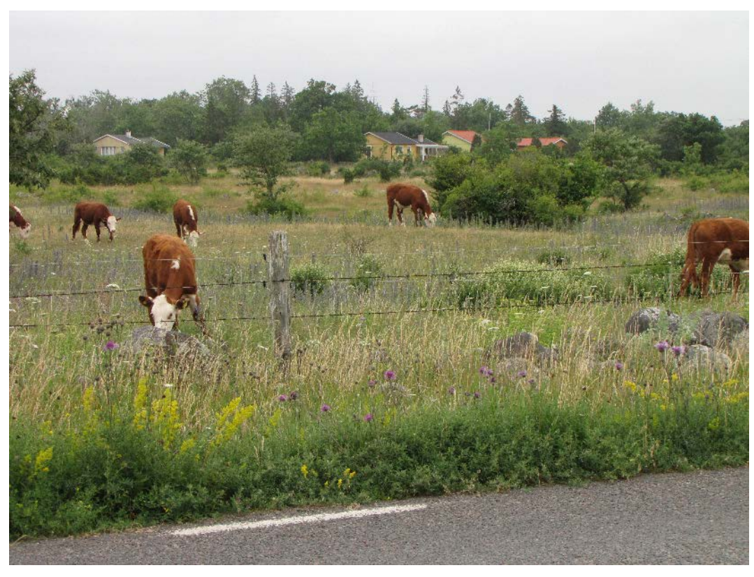
Figure 8. Calcareous semi-natural pastures are among the most species-rich grassland types. Knowledge about pasture species' responses to various environmental variables can be used to develop methods for roadside management that favour biodiversity. Byxelkrok, province of Öland, Sweden.

Since many types of roadsides can be considered grassland habitats, studies in grassland habitats other than road verges can also contribute to the knowledge of roadside ecology. Runesson (2012) and Svensson (2013) reviewed literature on the relationships between roadside management methods and biodiversity (mainly vascular plants), including studies in a wider range of grasslands, for example Natura 2000 habitats. The focus of both reviews was to inform the management of Swedish road verges, but literature from all countries and regions was reviewed.