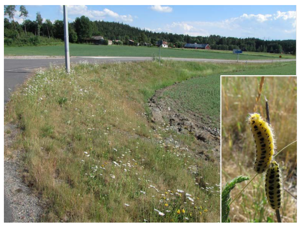
Figure 17. With suitable vegetation, roadside habitats can serve as reproduction habitats for invertebrates, here larvae of burnet (Zygaena sp.). Borås, province of Västergötland, Sweden.

In the Netherlands, the two butterfly species Maculinea nausithous and M. teleius were re-introduced in 1990 and their populations studied over nearly a decade (van Langevelde and Wynhoff 2009). The two species typically occur in fragmented habitats and they depend on plots with both host plants and host ant nests as larval resources. The authors found that the spatial arrangement of the habitats limited their dispersal, but in different ways. M. teleius only flew shorter distances, and expansion of a population could only occur to high-quality patches in close proximity. In contrast, M. nausithous could cover larger distances and therefore had the ability to utilize a network of high-quality habitats further away in the landscape, for example in road verges.