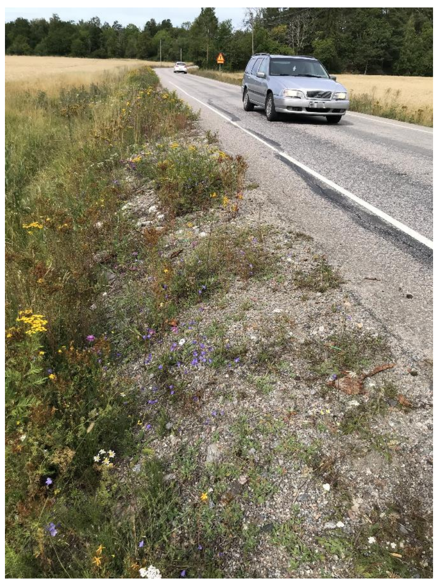
Figure 21. Sun-exposed road verge with sparse vegetation and a large proportion of bare soil. Mariefred, province of Södermanland, Sweden.

combination with sowing (e.g. Johnson 2008). It has been questioned how efficient such measures are in roadside conditions where drought and high temperatures may disfavour those fast-growing species that are favoured by high nutrient levels. Hillhouse et al. (2018) evaluated the effects of nitrogen and phosphorus fertilization on the foliar cover of species planted into two roadside sites in eastern Nebraska, USA. They found no effect of fertilisation on foliar cover or erosion because the fertilisation protocols were developed for fast-growing cool-season plant species.