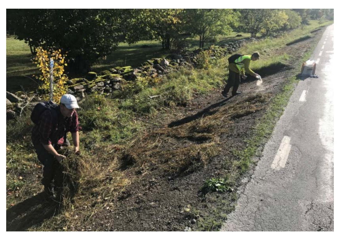
Figure 7. Experimental establishment of meadow flora on recently disturbed ground by sowing collected seeds and by placing hay from the meadow on the roadside. Hällabrottet, province of Närke, Sweden.

The reuse of local topsoil is sometimes recommended, in order to take advantage of the seed bank in the vegetation that was present prior to road construction. Some guidelines are explicitly addressing biodiversity in relation to topsoil reuse (e.g. Trafikverket 2021), some are not (e.g. Mainroads Western Australia 2016).