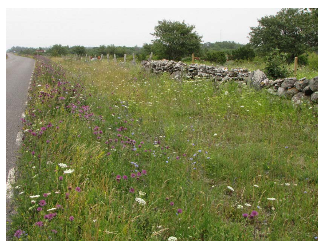
Figure 19. Road verge on lime soil and bedrock, and with the road embankment in a different phase after disturbance. Byxelkrok, province of Öland, Sweden.

Both pH and calcium are found to influence plant species richness in some studies. For example, in 35 road verges in north England (U.K.), Akbar et al. (2009) registered 212 vascular plant species. When relating species composition to environmental variables (in a multivariate CCA ordination), the most important factors identified were altitude, pH, exchangeable sodium and calcium, verge age and macronutrients. Other likely important (but not measured) factors were management activities such as mowing, and trampling. Neher et al. (2013) found that concentrations of Pb, Cd, Cu, and Zn were elevated near the road compared to further away, and along large roads compared to smaller roads. Additionally, roads of all sizes increased soil alkalinity. In the study, the pH in soil next to the road was 7.7 compared to 5.6 in the forest nearby. Also Müllerová et al. (2011) detected an increased pH in soils near roads due to the use of alkaline road materials. In this case, the pH went from 3.9 to 7.6 in an alpine tundra vegetation, which resulted in a changed species composition near the road, replacing the tundra species with meso- and nitrophilous species.