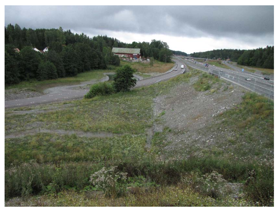
Figure 34. Recently constructed road, with good potential for slow succession both in the slope and flat area. Överfors, province of Södermanland, Sweden.

The study by Ross (1986) of primary succession in Scottish road verges illustrates how the number of species first increases through establishment of new species, and then decreases due to vegetation management (e.g. mowing and herbicides), and through competition. The studied highway was constructed in 1969 and the species composition was recorded 10 and 20 years after construction. Four species of grasses together with white clover were sown at construction. After 10 years, 84 vascular plant species were found, and after 20 years 68 species; 71 new dicots established during the first ten years, but in 1984, only 44 dicots remained. During the last 10 years, the number of grass species increased from nine to 13 species and the number of bryophytes from none to nine. The study also indicates that many of the species that entered the verge habitats during the first 10 years, continued to spread along the road to new verge microsites during the following 10 years. A similar result was found in a study of plant diversity in a Chinese delta area (Zeng et al. 2010, 2011). The vegetation in this highly dynamic area is characterised by primary succession, and the disturbance along the roads favoured plant diversity, of which about 75% of the plant species in the roadside habitats were native plants. The native plant species