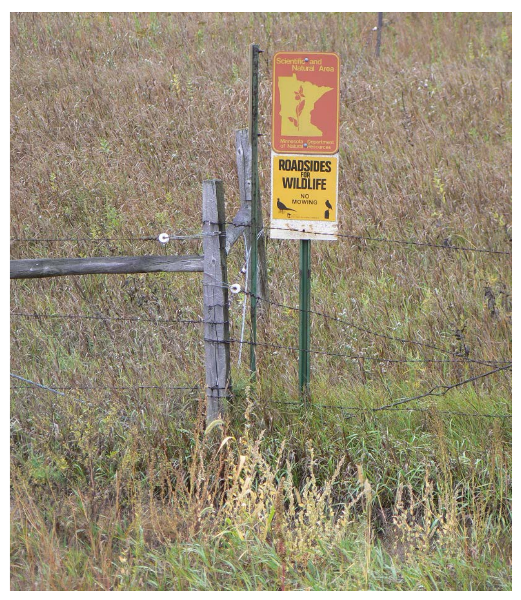
Figure 2. Signage for conservation roadsides in Minnesota, USA.

Another example of practical-economic motives for a conservation interest in road verges is provided by Vasconcelos et al. (2014), who studied plant diversity in Brazilian Cerrado wooded savanna – a hotspot in biodiversity conservation. They found that the number of species was lower in road corridors through the savanna compared to natural vegetation in reserves, especially the number of forest species and Cerrado specialist species. However, 70% of the 108 species found in the savanna also occurred in the roadsides. Considering the continuous pressure on the Cerrado biome from different types of land use, which leads to the decline of many species, and considering the large total area of road corridors, the authors concluded that roadside habitats may be important for preserving