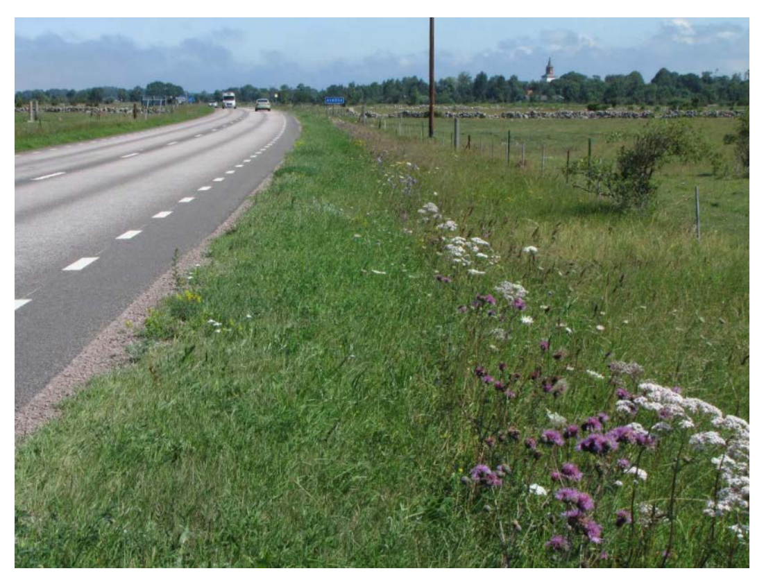
Figure 29. Early cutting next to the road has reduced flower abundance and (most likely) plant species richness compared with later cutting. Province of Öland, Sweden.

In contrast, some studies have found more positive effects of early cutting. For example, Chaudron et al. (2018a) showed that a single early cutting of road verges promoted higher species richness in agricultural landscapes in mid-western France compared to late cutting practices. Late cutting mostly favoured nitrophilous and competitive species that were also present in the field margins. Baum and Sharber (2012) noticed that summer cutting of road verges in the Great Plains of Oklahoma, USA, made milkweed (Asclepias viridis) produce a new burst of shoots in August-September, at a time when undisturbed milkweed plants had senesced. Such late appearance of milkweed was identified as a benefit to monarch butterflies ( Danaus plexippus ), which uses different milkweed species as their sole host plant. This positive effect of cutting for monarch butterflies has also been demonstrated by cutting experiments in habitats other than road verges (Fischer et al. 2015), as well as by experimental summer burning. Re-flowering after early cutting was shown also by Noordijk et al. (2009b) in the Netherlands. In that study, pollinators responded positively to cutting twice a year (with removal of the cut vegetation) in productive road verges, because that type of cutting regime promotes the highest flowering. The early cutting triggered reflowering later in the season.