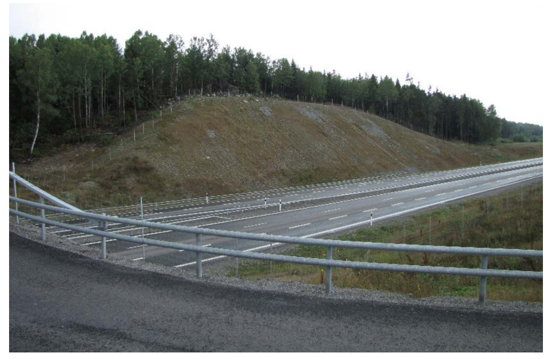
Figure 31. Large slope with local nutrient-poor soil, good potential for slow succession and species-rich dry vegetation. Överfors, province of Södermanland, Sweden.

Dry conditions are caused by the combination of low water supply (from rain and/or ground water), low water content in the soil (by coarse material causing low water retention capacity, or thin soil that rapidly dries), and high evapotranspiration (through warm climate and/or microclimate). As discussed earlier, the soil moisture can be considered a fundamental condition for determining the vegetation and can be regarded as a stress factor. In addition, dry conditions increase the risk of shorter periods of drought, here defined as periods much drier than the average, which kills some of the vegetation. Drought is thus a process that could open the sward and cause rapid changes of the habitat similar to physical disturbance to the ground.