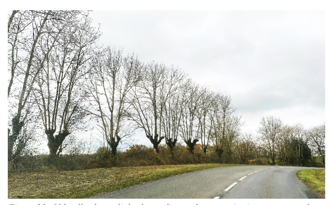
Figure 23. Old pollards are light-demanding and can survive in tree rows and forest edges along roads. Saint-Léons, department of Aveyron, France.