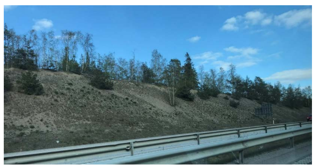
Figure 22. Dry, sun-exposed slope along motorway. Bålsta, province of Uppland, Sweden.

and diversity of herbs and graminoids (and invertebrates) in many studies. For example, in a Japanese study, roadsides were compared with natural vegetation along an altitudinal gradient (Takahashi and Miyajima 2010). The species composition was clearly affected by light conditions. At altitudes below the timberline, roadsides constituted canopy openings compared to the adjacent forest canopy. Light-demanding plant species dominated in the roadsides irrespective of altitude, and in the natural vegetation they increased with altitude as canopy cover decreased.