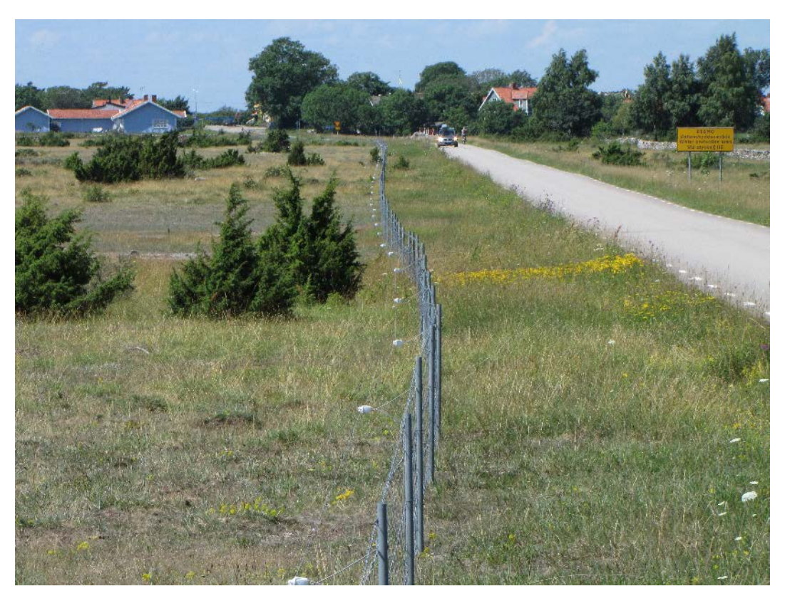
Figure 26. The road corridor has become a rescue for the important host plant Inula salicina and accordingly also for its insects. Inula cannot stand high grazing pressure. Province of Öland, Sweden.

reduce plant species richness, and the fact that few insects utilize non-native flowering herbs.