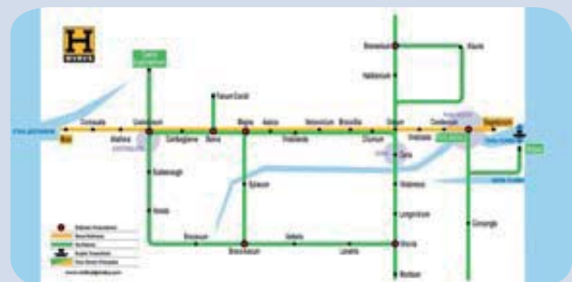
H Murus map

"...it's really good to hear about people and how they lived"