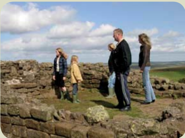
Visitors at Walltown Crags Turret 45a

These findings highlight a series of important issues that need to be addressed if Hadrian's Wall is to better realise its social, economic, cultural and educational potential.