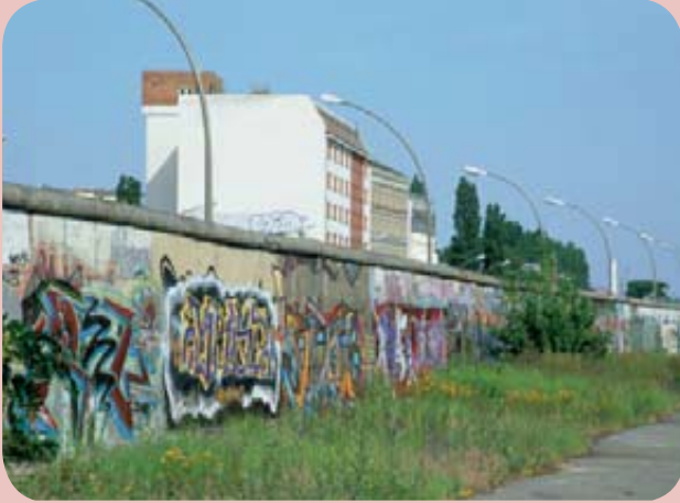
Berlin Wall Eastside Gallery, Berlin, Germany

9. Exploration, Discovery and Values – the archaeological and historical evidence that enables us to explore the story of the north-west frontier is revealed through antiquarians researchers, archaeologists, workmen and volunteers. This is a dynamic process with which we can actively engage and contribute our own interpretations. It is also a process through which we come to understand and value the legacy of the past.