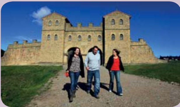
Visitors at Arbeia

By adopting an artistic brief that focuses on conveying the breadth, diversity and ease of access to Hadrian's Wall, perceptions that it is 'hard work' and 'all the same' can be addressed.