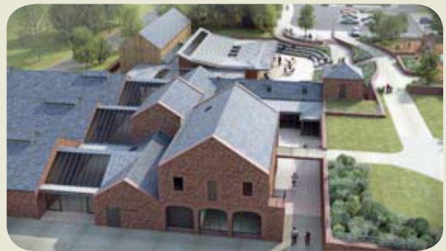
Artists impression of proposed project at Roman Maryport © HWHL

At Roman Maryport, a project is being planned that will focus on communicating the relationship between a fort, its garrison and the wider Empire by exploring the journeys and career paths of its people and soldiers as revealed by the altars in the Senhouse collection. At the height of its power and influence Rome's Empire stretched across 32 countries, a feat that meant its citizens and soldiers had to make both physical and personal journeys by land and sea to remote outposts such as the north-west frontier. The new museum displays will be enlivened by an on-going programme of excavation that will enable visitors to engage with the on-going process of excavation and archaeological research.