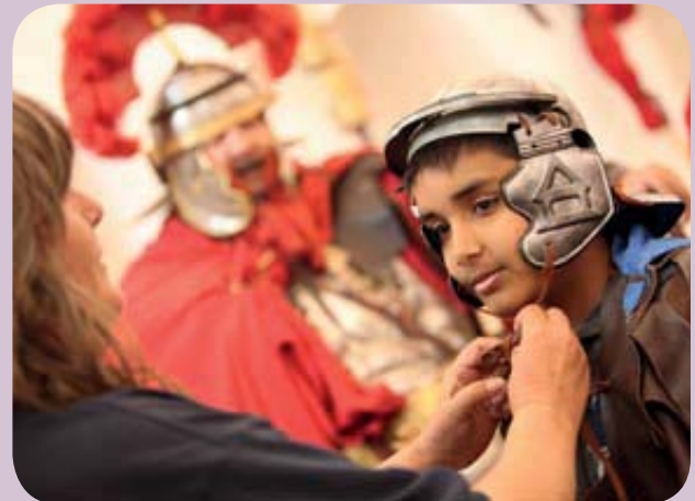
Event at Segedunum

"I think it helps put things in context"