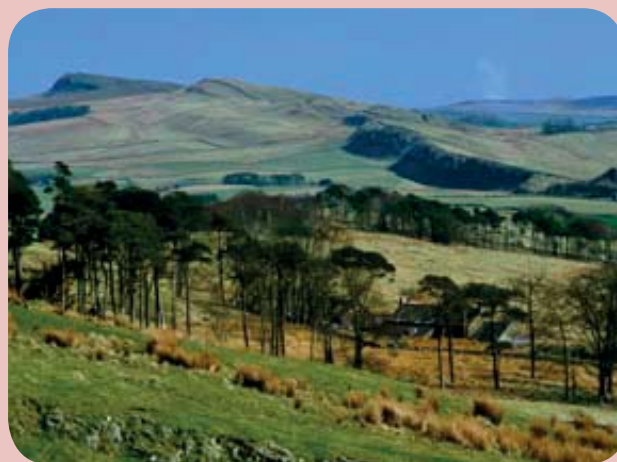
The Whin Sill - View East from Cockmount Hill towards Cawfields

This 'frontier' theme provides further links between the Roman frontier and the modern world and between the Roman frontier and the landscape in which it is set. This linking theme is reflected in the Natural and Cultural Landscape document.