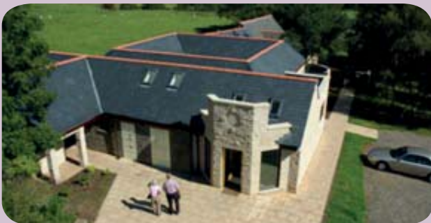
Roman Vindolanda visitor reception building

The Know Your Hadrian's Wall Country training programme and business network is an effective way of engaging businesses and communities across the WHS. The programme needs to be continued and developed and to embrace the new interpretative offer currently being developed.