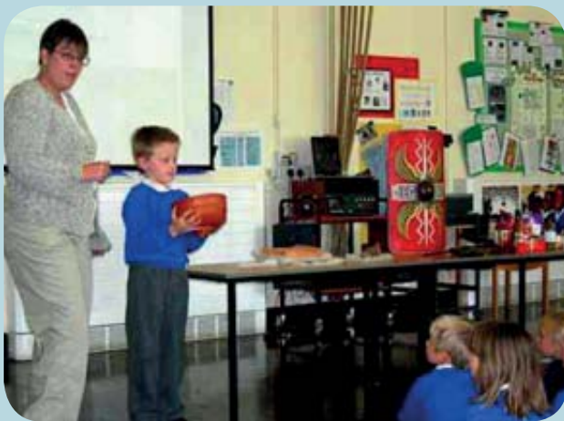
School outreach on the Romans and multiculturalism

Closely associated with public programming, is outreach. Outreach can engage communities and school audiences in Hadrian's Wall. It can bring heritage to audiences that might not otherwise encounter it, or who perceive it as irrelevant. It not only enables policy objectives to be met but can also encourage future visits and nurture community ownership, pride, engagement and support in the site. The public engagement exercise highlighted a lack of community interest and ownership in Hadrian's Wall that was expressed through the difficulty in recruiting participants to on-site visits and focus groups. Outreach activities are an important way through which to explore this issue further and break down barriers between local people and the WHS. Volunteer programmes are another effective means of breaking down these barriers and creating links between people and place.