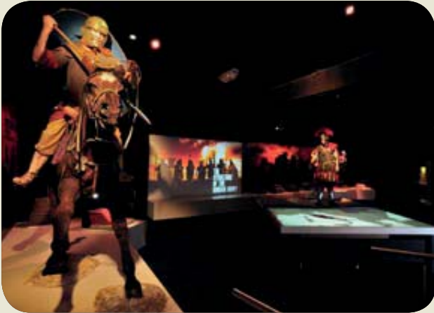
Roman Army Museum

At the Roman Army Museum, also just completed, the interpretation brings the Roman Army to life, exploring themes of the army and the Empire, military tactics and training, and the diverse roles and functions of the army as an occupying force, as engineers, as architects, as administrators and as multicultural Roman citizens. It also, where possible, draws contemporary parallels with the modern military. Given the broad and popular appeal of the subject, the visitor experience is more family focused and maximises the opportunity for this facility to be a much needed wet weather attraction along Hadrian's Wall.