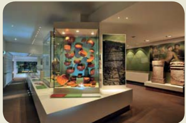
Chesterholm Museum, Roman Vindolanda

At Roman Vindolanda, just completed, visitors are able to engage and empathise with the real people, real events and daily military and domestic life on the frontier 2,000 years ago as revealed through the Vindolanda writing tablets and the ongoing process of archaeological investigation and research at the site.