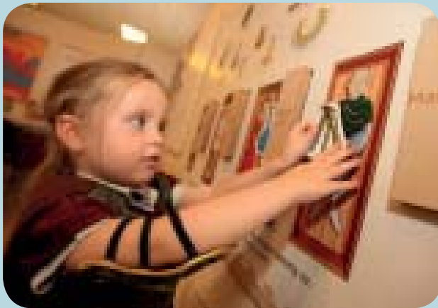
A young girl plays with an interactive display at Arbeia

Knowing your target audience is critical to creating effective and successful interpretation.