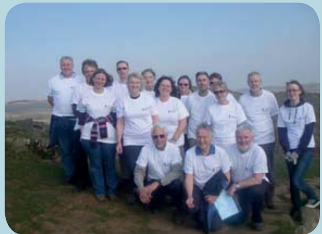
Hadrian's Wall Country Volunteer Heritage Guides

By working together, a greater pool of expertise and resource can be brought to bear to provide better visitor experiences.