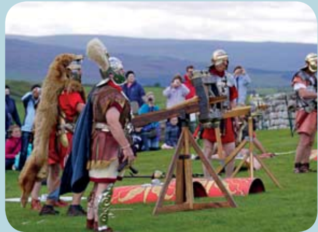
Living Frontier event at Housesteads

Events and public programmes are regularly used to attract new audiences to sites and give repeat visitors new perspectives and experiences. They can also be used to spread visitor numbers throughout the year, particularly outside of the peak season, which is a particular issue in the central sector of Hadrian's Wall.