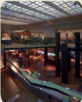
Roman Gallery, Great North Museum, Newcastle

The Great North Museum whose Hadrian's Wall Gallery is completed, focuses on Hadrian's Wall itself and features a scale model of its full length. This centrepiece is supported by collections rich displays which are brought to life through the voices of individuals identified from the world-class collection of stone inscriptions.