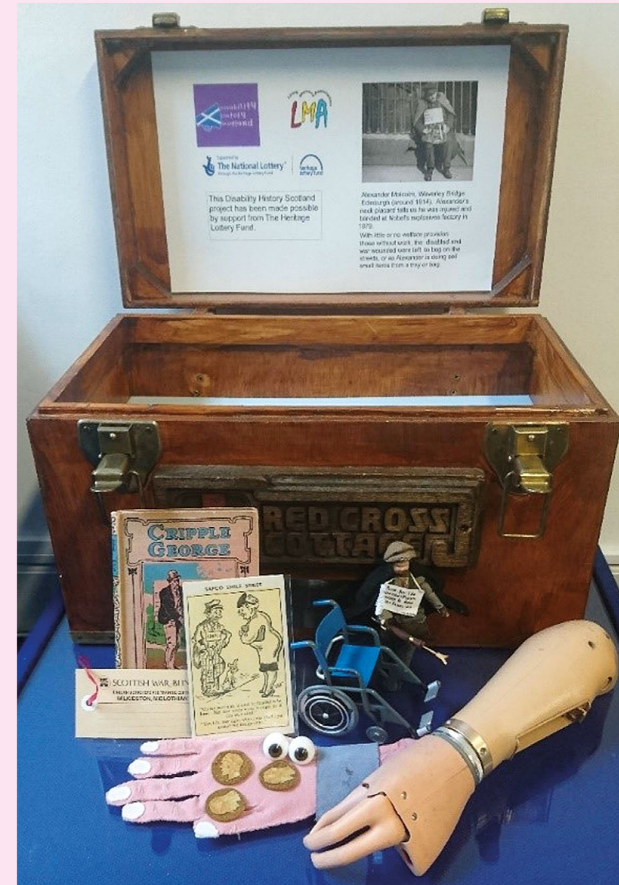
Figure 4 A Memory Chest that used physical artefacts to provide insight into the disability movement.

▼ Taking a landmark event in national history, DHS worked to explore how the new visibility of disabled people, especially war veterans, may have helped to change attitudes not just to disability but also to understandings of mental health and to critical perspectives around concepts of charity and justice. ▲