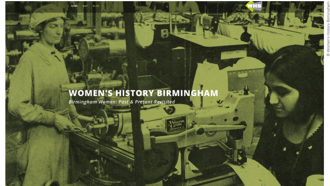
Figure 2 A walk led by Women's History Birmingham inspired by the Feminist Review sponsored walk in the 1980s.