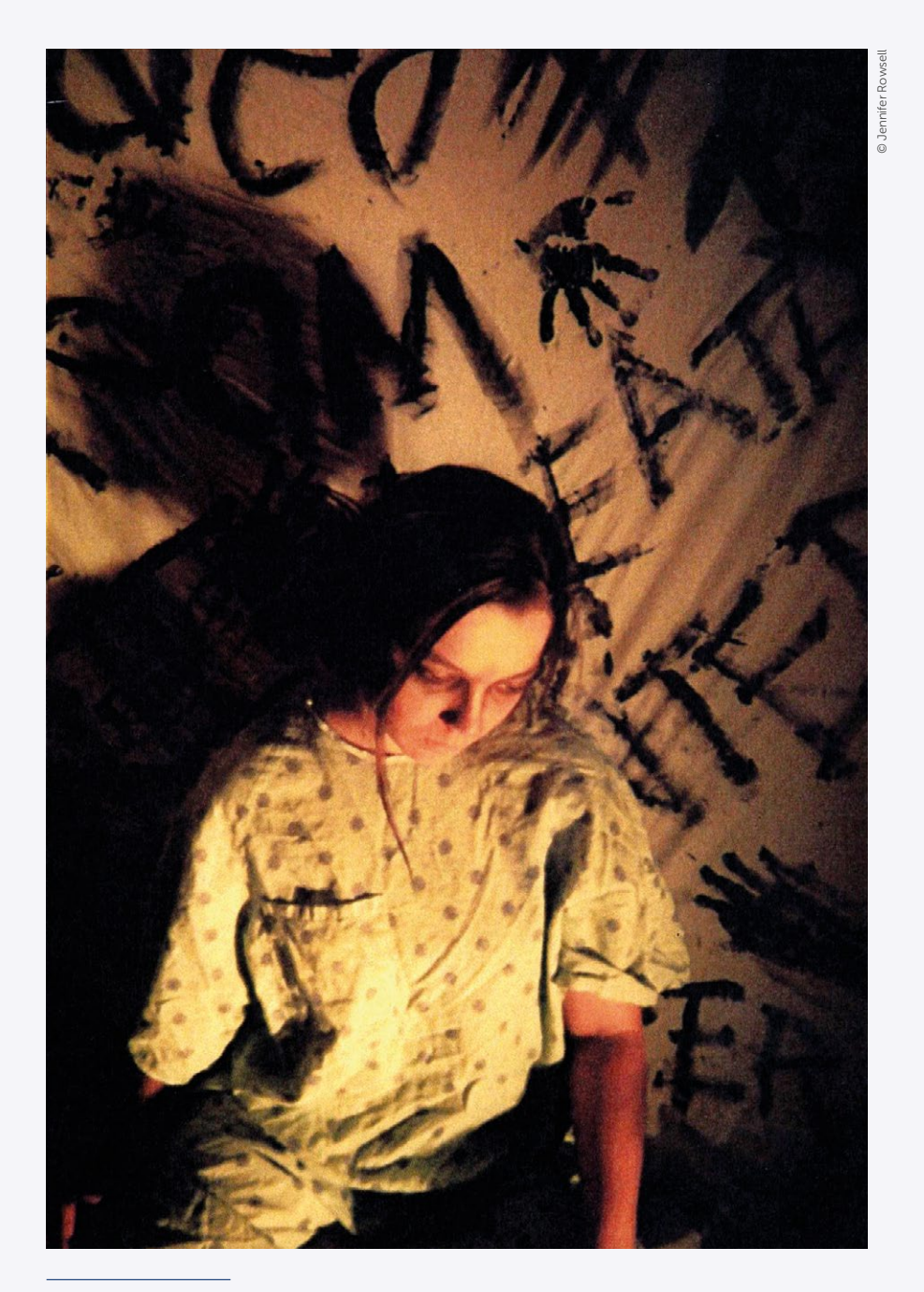
Figure 8 Being Cindy Sherman Project.