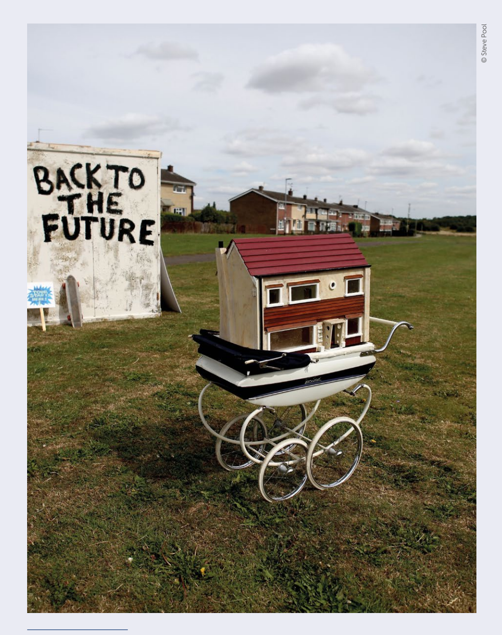
Figure 4. Steve Pool Poly-technic. Back to the future.