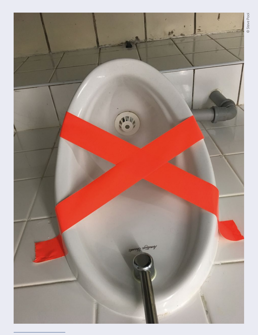
Figure 3 Steve Pool. Fountain not in use.