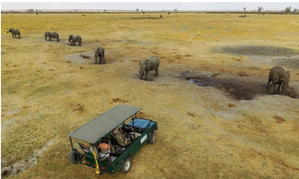
Figure 2: Elephants drinking from one of the small springs that were the only source of water in most of Hwange National Park during the dry season.

In the discussion that followed, it was acknowledged that Hwange National Park may be closer to a 'safari project' than a conservation project, because of its approach to managing and commodifying elephants. A strong pressure has been on attracting more tourists, and this is reflected also in the physical land-use changes in the park, including the water supply.