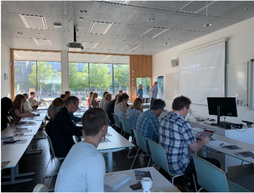
Figure 1 : Symposium participants.