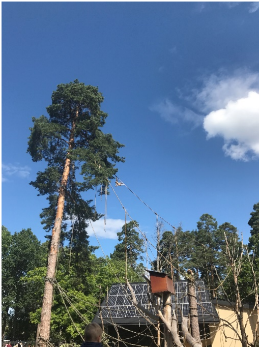
Figure 4: inside Parken Zoo, Eskilstuna