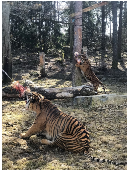
Figure 5: Tigers in Parken Zoo, Eskilstuna

transport between or within zoos after transfer recommendations or management decisions. Stress from handling can be minimized through training and preparation and sometimes it requires immobilization. Photos of activities with animals may be taken, but animals should not be handled only for being photographed.