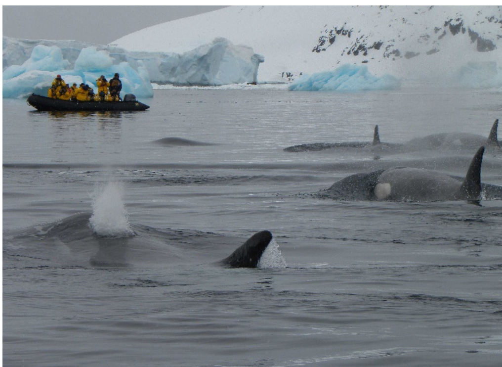
Figure 3: Orca ( Orcinus orca ) watching

Lotta Berg provided a comprehensive look at the scope of wildlife-based tourism that takes place in situ, in the wild. She indicated that unlike in zoos, where animals fall under human responsibility and welfare legislation, animals in the wild are less cared for, but potentially equally affected by human hand. This is so, for example, even when they involve some degree of physical distance between the tourist and the animal, as through risk of disturbance, collateral damage of tourists to other species, roads and infrastructures of tourism fragmenting habitat and vegetation changes.