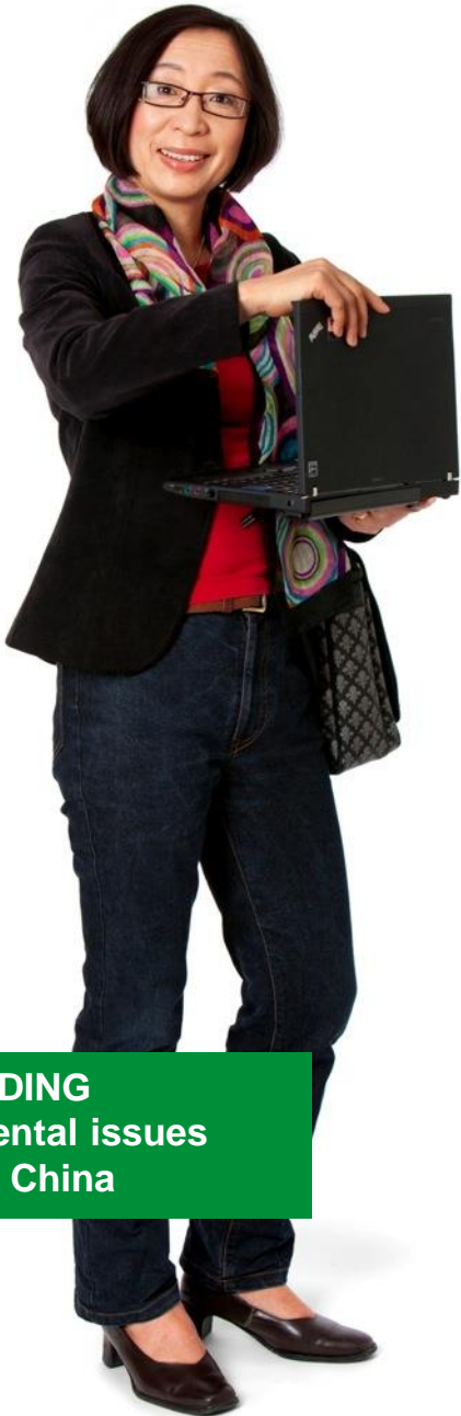
PING HÖJDING Environmental issues relating to China