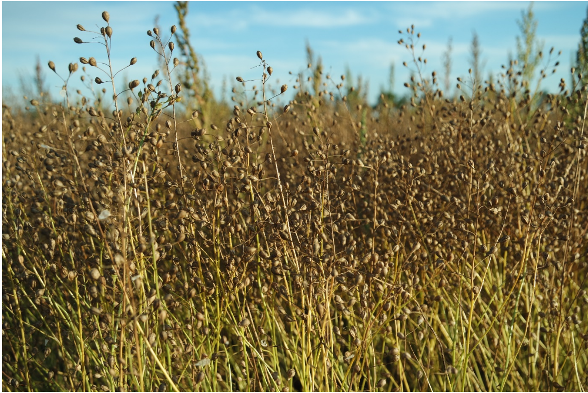
Fig. 5 Camelina ( Camelina sativa ) plants in the field trial in Borgeby that are used for extraction of oil and wax esters for production of insect pheromones, which are then used for control of insects in more secure and environmentally friendly manner than what are used today.

Field trials on camelica (Fig. 5) were conducted in Nebraska and Sweden and seeds were collected for analyzing the target pheromone precursor content. A new compound for pheromone production and wax esters have been produced in camelina seed oil that could potentially be used as pheromone precursors.