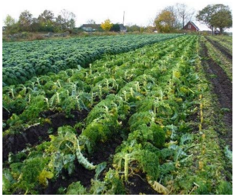
Fig. 1 Kale field during harvest. To the right unharvested, middle harvested and to the left ploughed part of the kale field. Approximately half of the kale plant is used for human food, rest is becoming waste. This waste could be used to extract bioactive compounds, such as phenolic compounds, and dietary fiber.