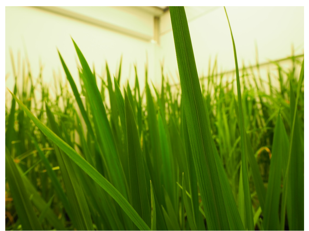
Fig. 3 Transgenic rice plants overexpressing a lipid biosynthetic gene showing increased oil content.

We have recently found that the higher oil content in wild rice is regulated by a single gene and overexpression of this gene in a rice cultivar (Fig. 3) led to significantly high oil content and biotic stress tolerance against rice brown plant hopper and rice blast fungus.