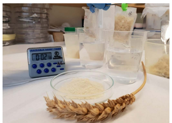
Fig. 2: Superabsorbent production from flour of the wheat grains.

The VR and TC4F funded research on computational simulations of plant proteins to understand functional properties has finally started to generate significant results in 2020. The plant proteins under study are extremely difficult to investigate through simulations due to their enormous size, the gluten proteins are building the largest protein polymers in nature.