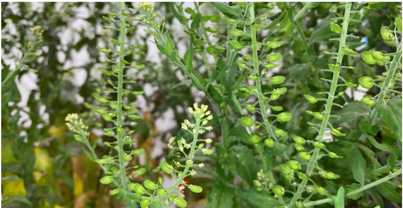
Fig 5. Gene-edited field cress plants with pods and flowers.

The current methods for measuring autophagy require laborious sampling of plant material, which do not allow to track dynamics of the pathway. We aim to establish non-invasive methods for quantifying autophagic activity in planta. For this, we engineered two types of reporters: (i) dual-luciferase reporter that shows decrease in luminescence upon upregulation of autophagy; (ii) split-luciferase-based reporter, which luminescence increases proportionally to autophagic activity.