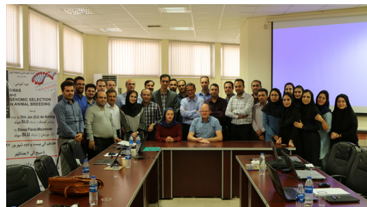
Teachers and the participants of the course in Iran.

28 participants from the whole country, ranging from PhD students to professors, took part of the course. Participants came mostly from universities, but also the industry and research stations.