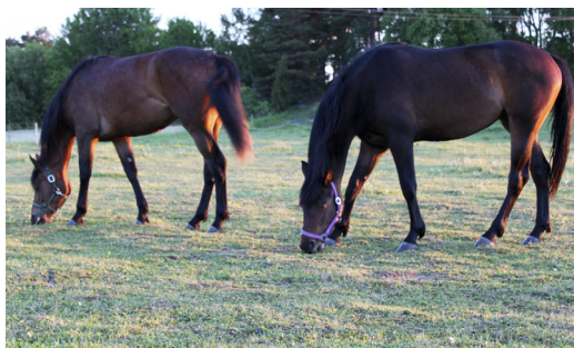
The breeding value shows the potential of these horses.

The breeding index for all 50 traits is available at www.blup.se