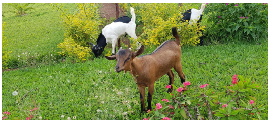
Goats in Rwanda.