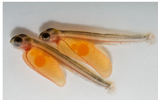
Low fertility is a challenge for aquaculture in Sweden.

I have been particularly lucky until now, since all my previous departments were fully supportive and helpful. Providing courses like grant writing was very helpful and probably played its role in me getting the Formas grant. Mentorship from the senior staff is very important, especially for maximizing a young researcher’s chances of getting a research grant. Offering the above type of training is critical for young researchers.