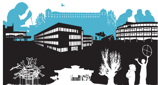
SLU campus in Uppsala

www.slu.se/en/departments/animalgenetics