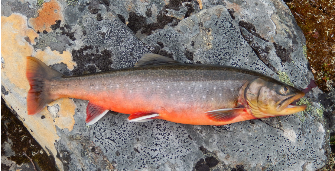
Char caught at Nordkymhalvoja in Norway.