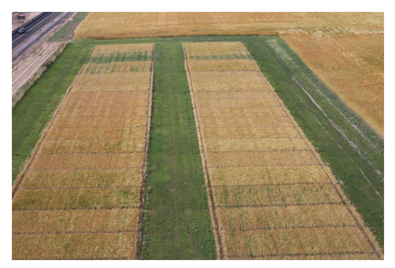
The soil fertility experiment at Orup.