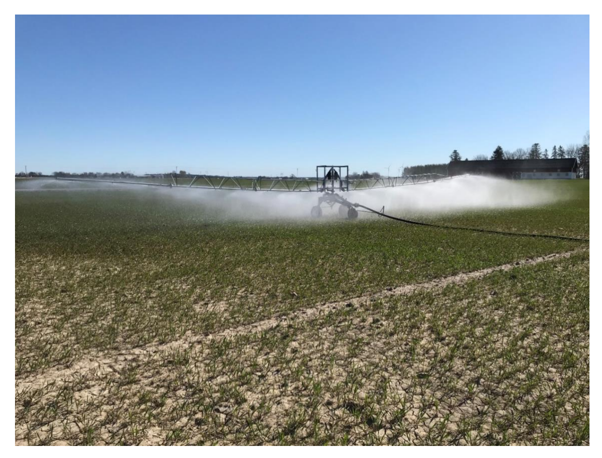
Liming of a field experiment at the research station in Lanna.