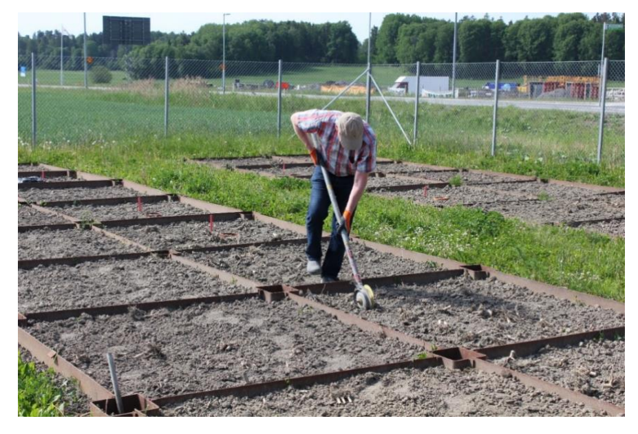
All management of the frame experiment is done by hand, ensuring minimal carry-over of soil between plots.