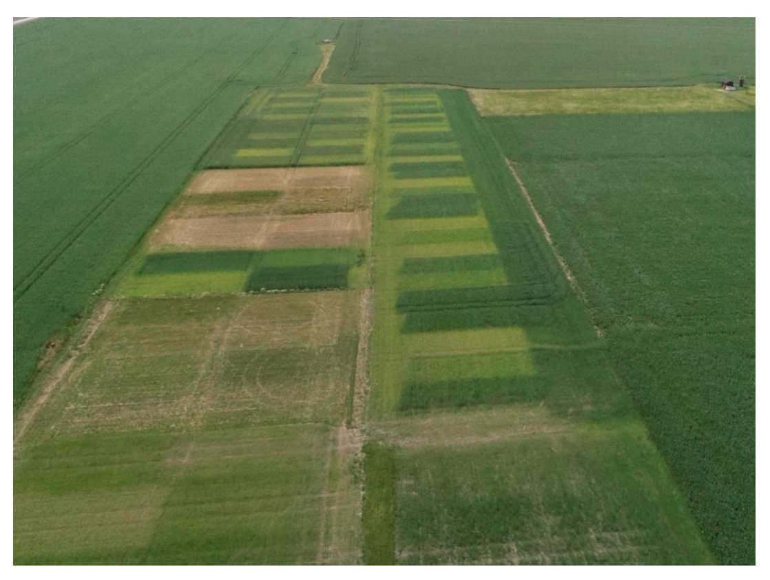
Field experiments at the Lanna research station.