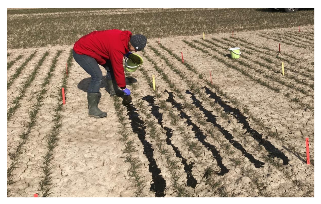
Spreading of organic amendments at Lanna.