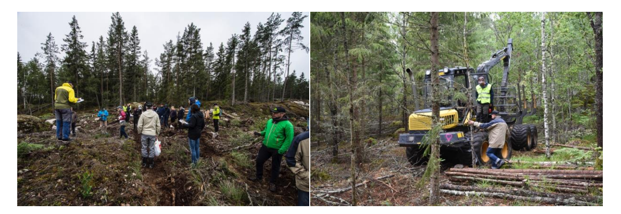
Figure 12. Exploring the harvesting site (left) and the training exercise on a forwarder (right)

After eating a field lunch, the bus headed north of Rimbo, Uppland to an estate owned by Skogssällskapet. There, Jan-Olov Weslin and Per Westerfelt from Skogforsk (The Forestry Research Institute of Sweden) hosted us during the afternoon at their demonstration area. This area demonstrates various types and levels of environmental consideration in clearcut forestry. Participants viewed the high stumps, green tree retention, and buffer zones that were saved on a (for Uppland) unusually large clearcut (>20 ha), and got to try an exercise in habitat assessment. Most of us were delighted to try out assessing key habitats, since this