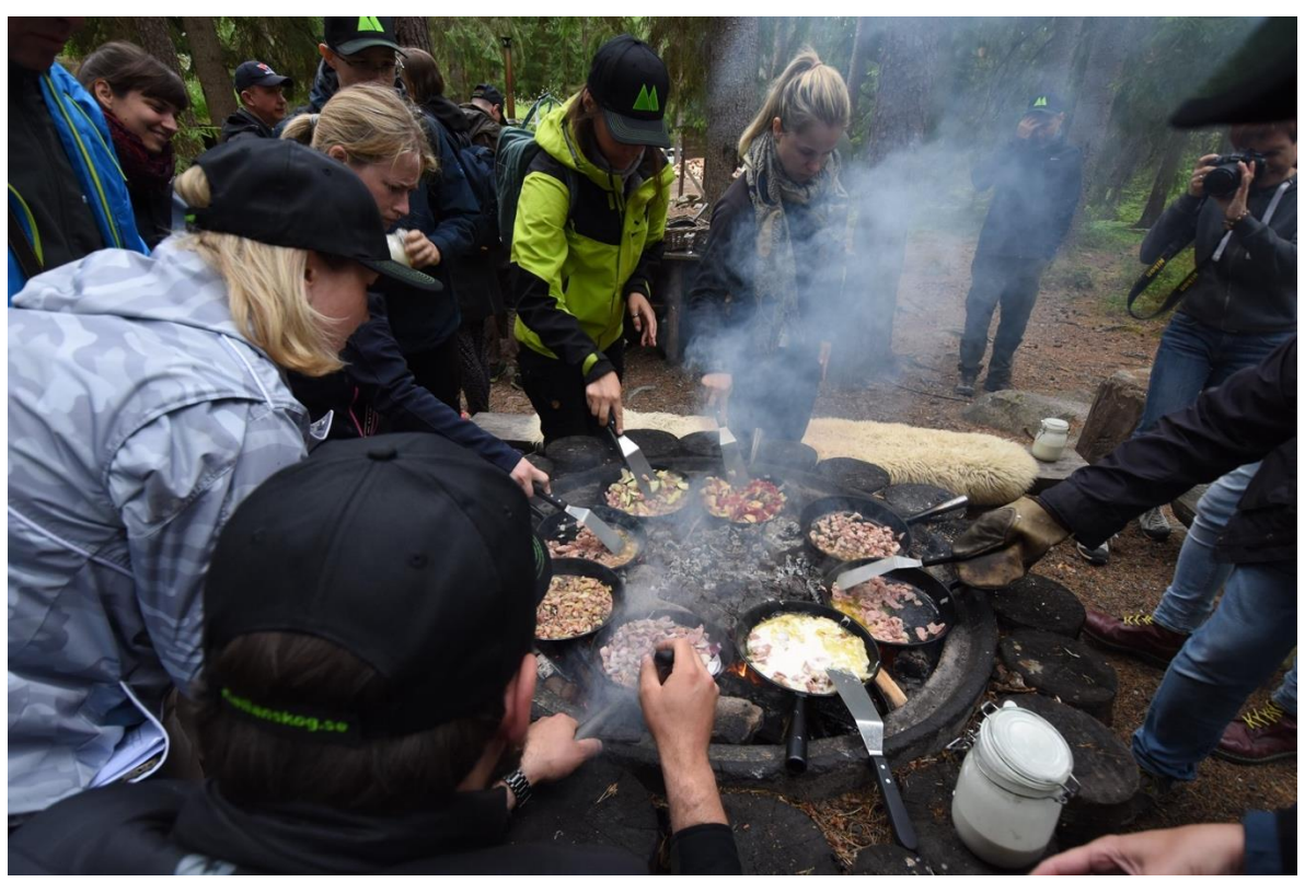
Figure 7. Fireside dinner at Kolarbyn Ecolodge

Kolarbyn Ecolodge is Sweden's most primitive hotel. There is no electricity, no showers, nothing fancy at all, just natural mysteriousness. And that is precisely why some people love this place. There are twelve well-camouflaged cabins. All covered in mud and grass. Bilberries and mushrooms grow wild on their roofs. As natural as it can be. Some guests have called them mud-holes or hobbit houses. Kolarbyn gives an opportunity to experience how forest workers and charcoal producers lived in the forests hundreds of years ago.