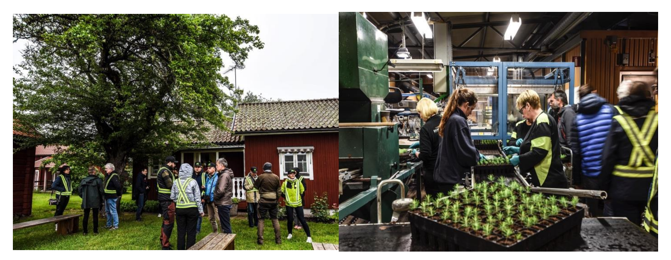
Figure 10. Visiting Nässja tree nursery -