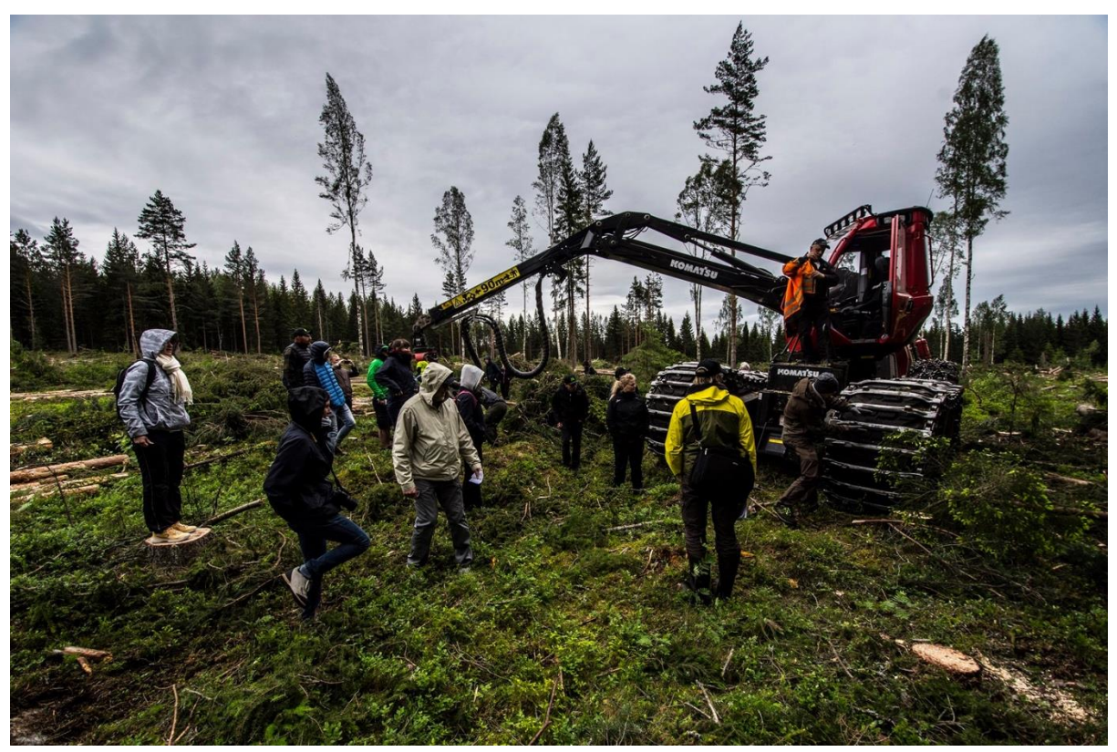
Figure 8. Visiting the harvesting site of Sveaskog.

Sveaskog is a Swedish state-owned forest company, and the largest forest company in Europe. We had a long interesting discussion on how to maintain ecological values of forest during the logging operations, what machines are used to log forests, etc.