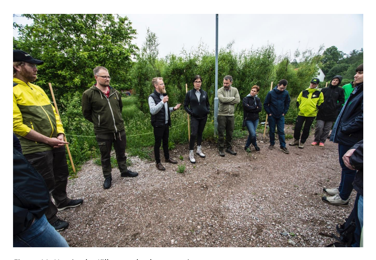
Figure 11. Hosting by Jälla naturbruksgymnasium.