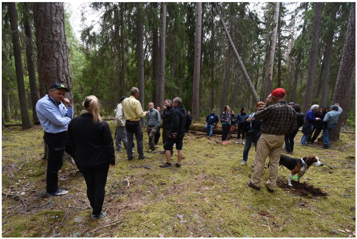
Figure 6. Field discussions about forest management of Snefringe commons.

After that, an example of how to earn money from "other functions of forests" and the cultural heritage from historical forestry work was visited. It was "Kolarbyn" close to Skinnskatteberg and a fireside dinner was prepared in the same way as forest workers did in the past (Figure 7).