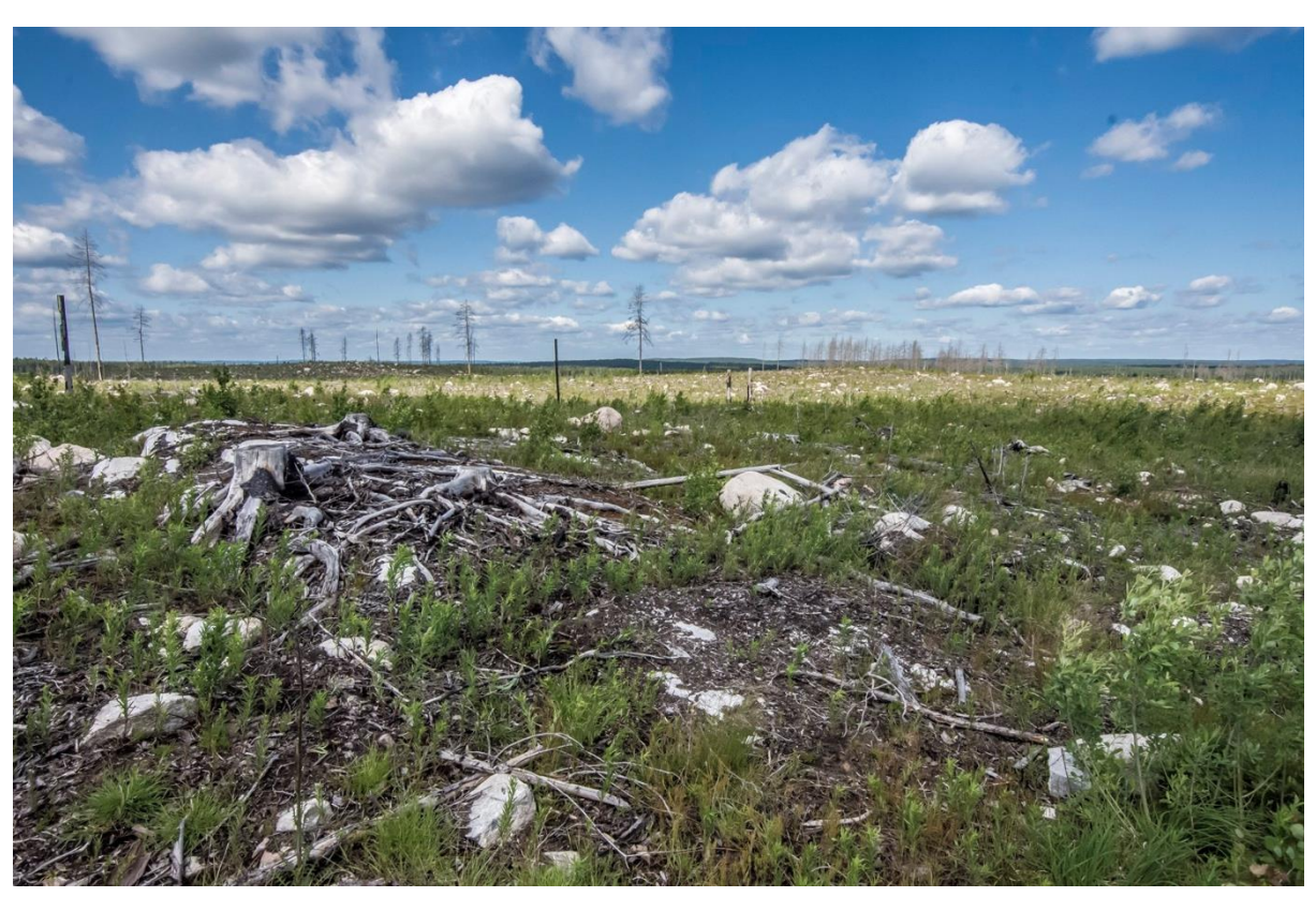
Figure 2. A small part of Västmanland forest fires site.

The group was accommodated in guest rooms belonging to SLU. The same accommodation was used up until Thursday morning.