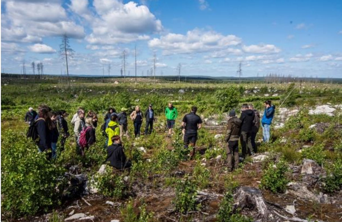
Figure 3. A tree counting exercise in the reforested forest fire area.