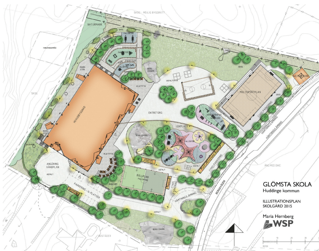
Glömsta skola in Huddinge. Illustration: Maria Hernberg/WSP.

The “Glömsta school” in Huddinge is an excellent example of a design process which has taken advantage of the site’s existing preconditions. It is a school for 700 children from the pre-school class up to grade 9 (6–15 years old). The school’s surface area is 20,000m 2 , of which 14,000m 2 are the schoolyard. In 2010 an interdepartmental collaboration was started in order to produce an appropriate municipal legal plan (completed in 2013). Work began in 2014. The location chosen for the school is situated beside a natural forest rich in ancient monuments. This makes it an educational resource for pupils’ own explorations, learning, playing and outdoor stay. Technical demands on transportation routes, land-use and stormwater systems have been coordinated with the actual design of the school and schoolyard. The ambitions of the schoolyard have been driven by the municipal education authority in collaboration with landscape architects and with inspiration from other school