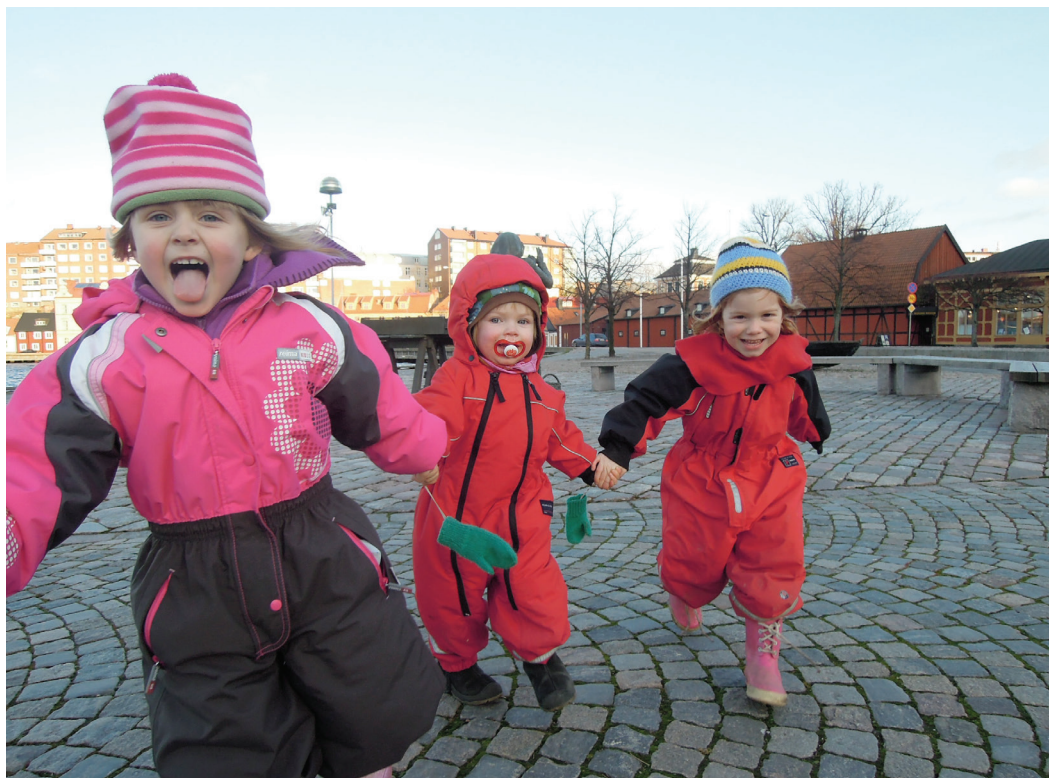
All outdoor settings have never been more important than today for: play, experiencing nature, learning and everyday mobility for children and young people.