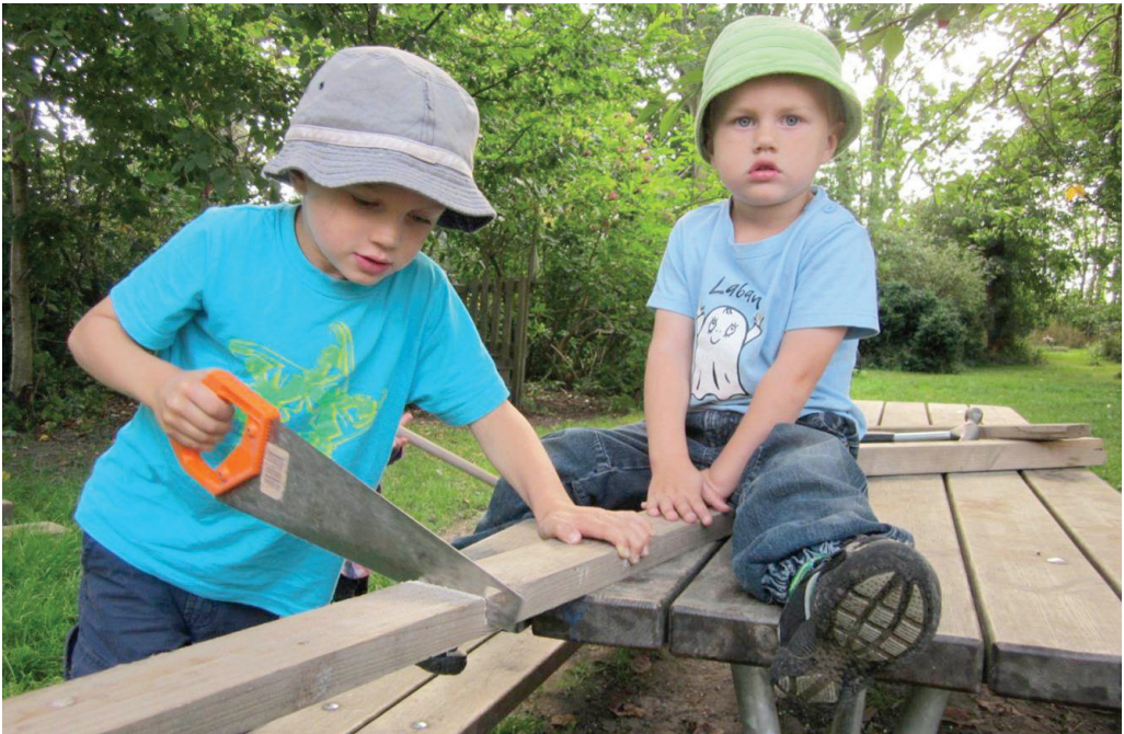
It is important to encourage children to challenge their motor skills.

We both have and must take responsibility for the child's right to play (Article 31 CRC). It means allowing and encouraging children and young people to challenge their mental, social and motor skills, even if it may be difficult to put reasonable limits on their risk-taking. Calculated risk-taking is part of life, a fully developed brain requires one or two mistakes and is the reason we should not bypass "children's right to scrapes." Many playgrounds are lavish facilities with high security in focus. Of course playgrounds should be safe and secure, but a safe play area involves more than minimal risk of injury. A safe environment allows the child to take risks, to challenge themselves and their physical and social abilities.