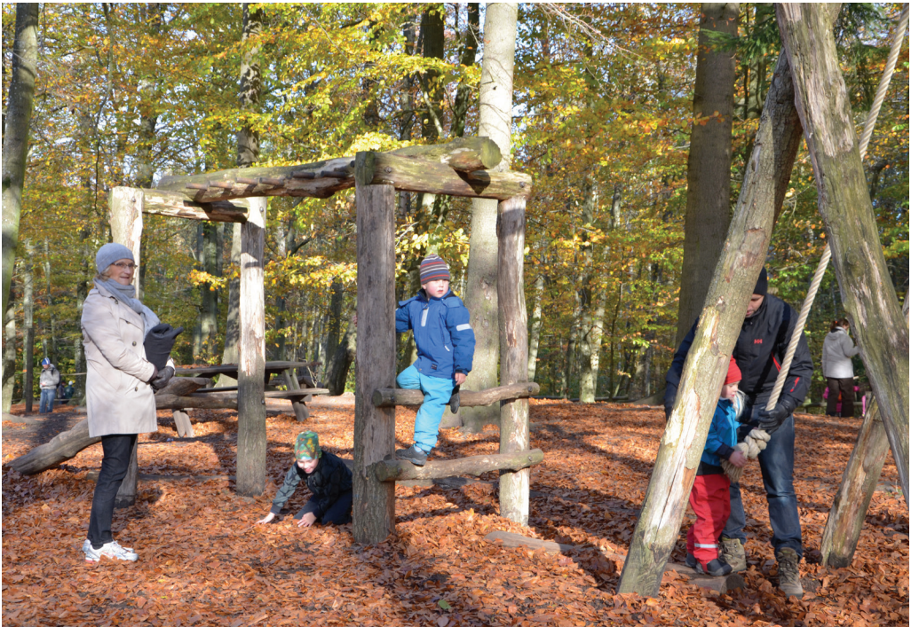
Outdoor play in green environments has beneficial effects for health.

• Outdoor play in green environments provides improved sleep at night, wellness, weight control