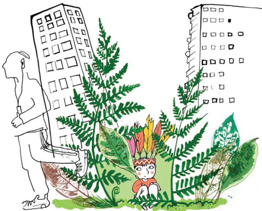
Illustration: Helena Bergendahl.