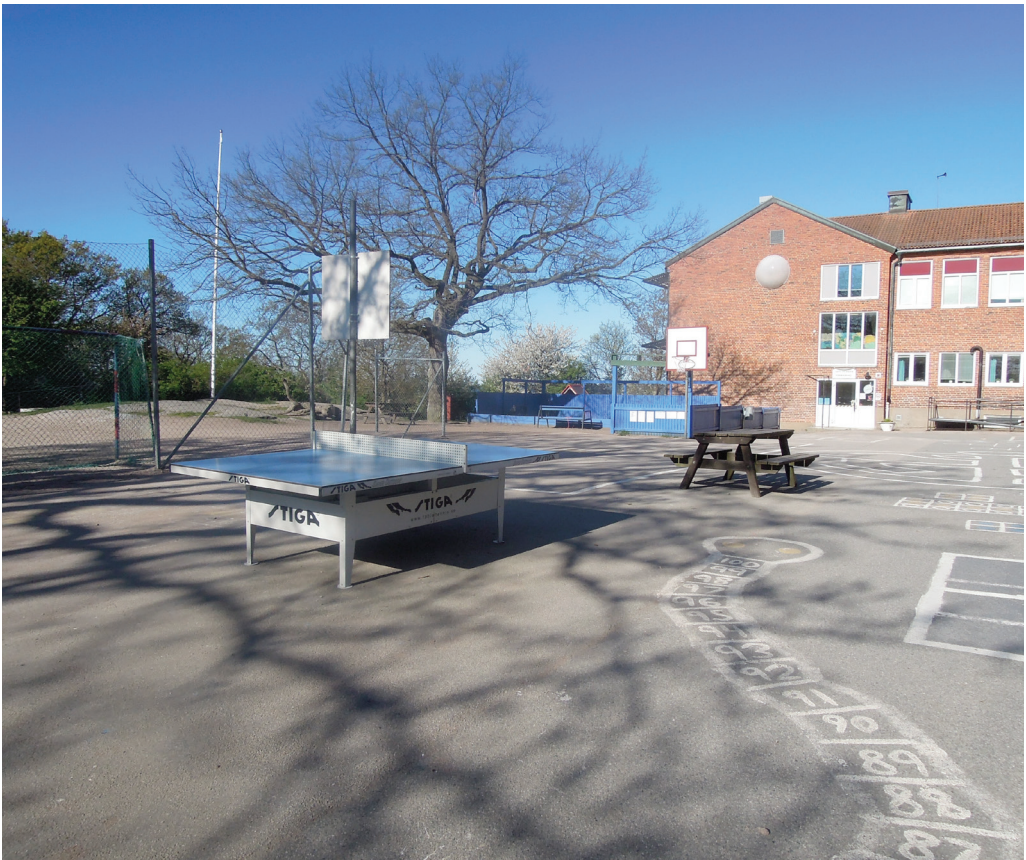
In the national guidance help is provided in interpreting the concept of open space for play and outdoor stay.

To help us, Boverket (National Board of Housing, Building and Planning) and Movium Think Tank have published the national guidance Gör plats för barn och unga! ("Make room for children and young people!") which aims to show how conditions can be improved so