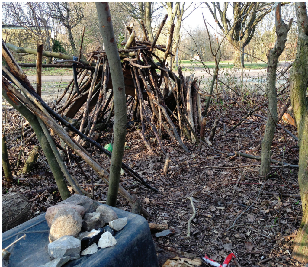
Through conscious management children can be inspired to create their own places.