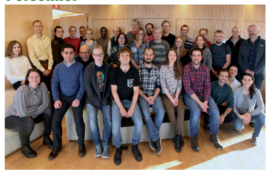
At the beginning of 2019, the department had 51 employees. This picture shows the participants at the institution day in January 2019.