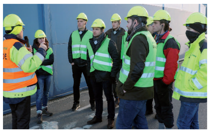
Euroforester students on a visit to Derome in Varberg, a sawmill with extensive processing

Lamba, S., ... Linder, S. et al. Physiological acclimation dampens initial effects of elevated temperature and atmospheric CO2 concentration in mature boreal Norway spruce. PLANT CELL AND ENVIRONMENT 41: 300-313.