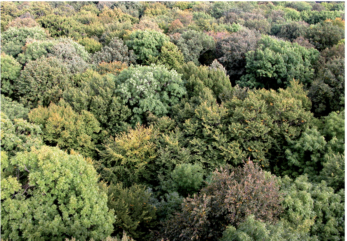
Below: Mixed temperate broadleaved forest in central Europe