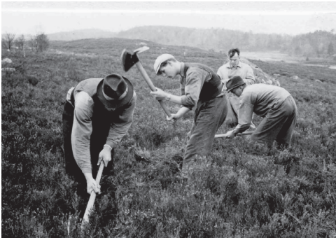
Left: Planting of Norway spruce on heathlands in southwestern Sweden ca 1930