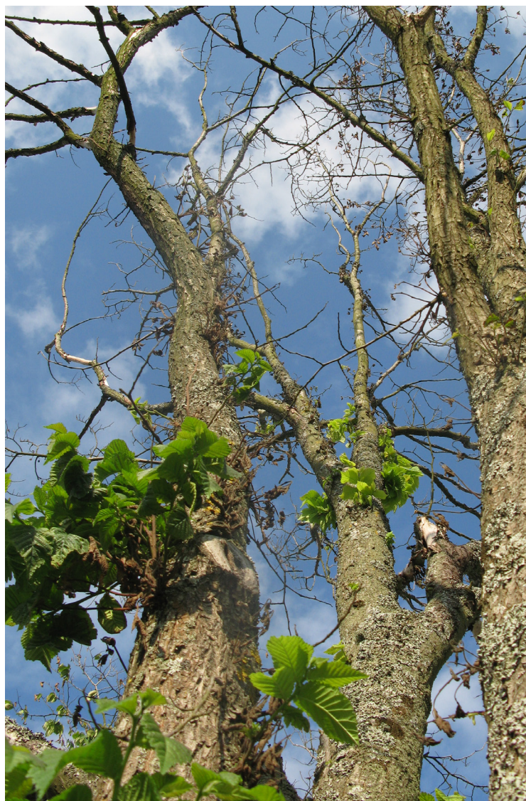
Semi-natural mixed forest on former pasture land, southern Sweden Dutch Elm disease Cover photo: Degraded Mongolian landscape, in need of forest restoration