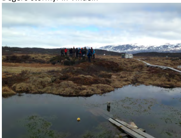
Stordalsmyren in Abisko