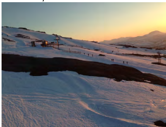
Midnight sun in Riksgränsen