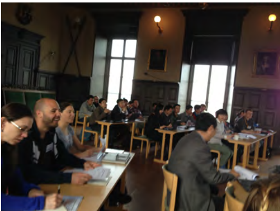
Lecture room at Wiks castle