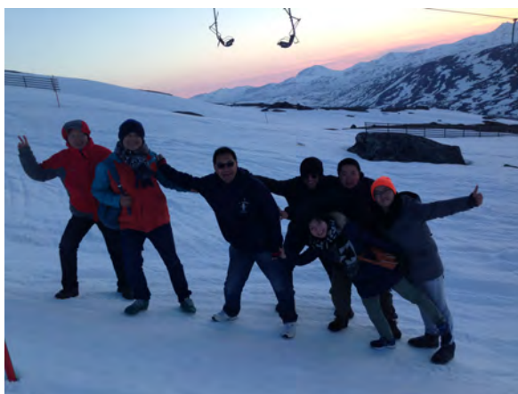
Midnight sun in Riksgränsen