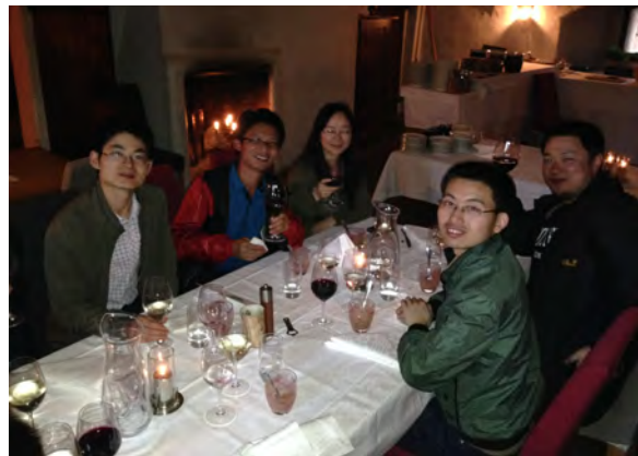
Dinner at Wiks castle

Contact: Staffan Åkerblom ( staffan.akerblom@slu.se )