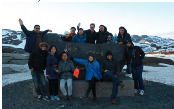
A short visit to Norway