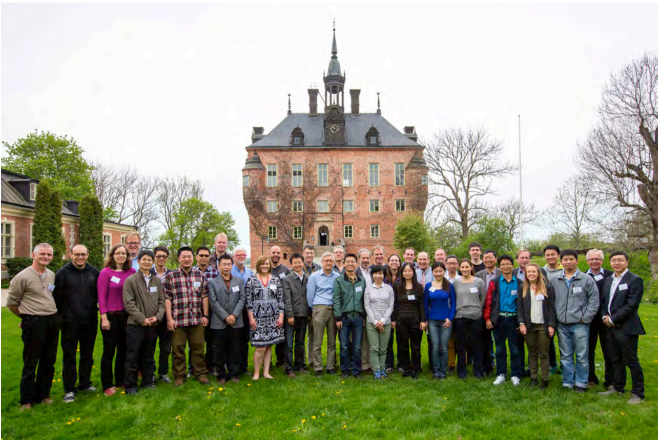
SMaReF group outside Wiks castle on Tuesday, May 20.