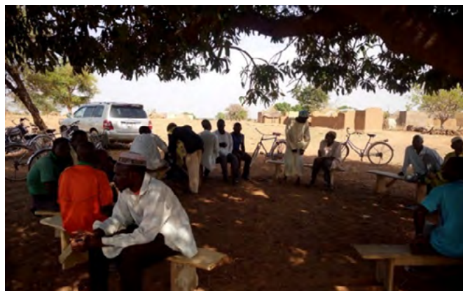
From the Burkina Faso Project – Discussions at an innovative platform meeting in Nobere commune.

The project on 'Agroecological practices in parklands in Burkina Faso' has ensured the sustainability of the Innovative Platforms, which contain WhatsApp groups for exchange, creation of local cooperatives, an increase of income-generating activities and support to identify key value chain actors. An integrated study of cost-benefits from conventional and agroecological farms (n=160) has been submitted to a peer-reviewed journal, and another one on value chains of three different parkland products is in the making.