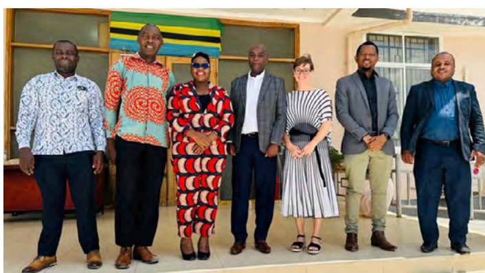
At a meeting with the Director of Training and Research within the Ministry of Agriculture, the project team was asked to share a summary statement of the project findings, approach and recommendations, together with a concept note for national upscaling that he would like to present to his superiors.

One of the main outputs from the project was the design and use of a training intervention that, through easy visualization, helped understand what gendered gaps and gendered differences are, how they can arise and what they can mean for agricultural extension interventions.