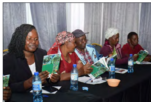
Launch of the manual on cultivation and preservation of indigenous vegetables

The project 'Transformation of pastoral livelihoods through enhanced capacity for adaptation of nutrition and commercialization policies to local contexts, West Pokot', Kenya, is linked to a PhD project. The collaboration with the PhD student has generated one manuscript published,