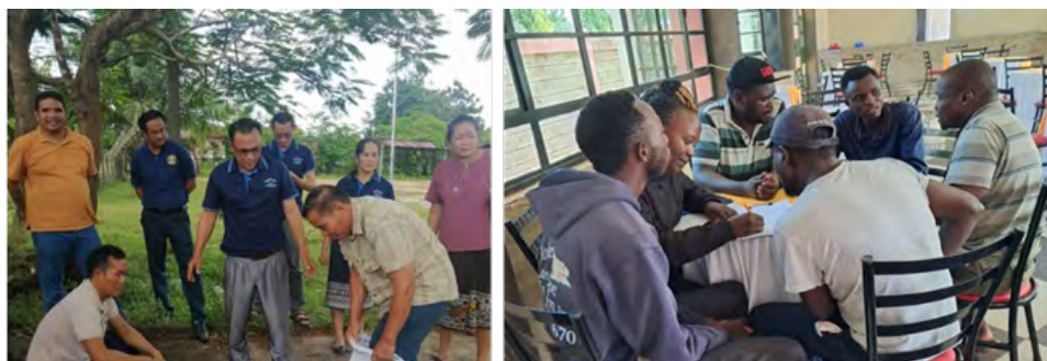
Left: Practices on grass silage making during the training for smallholder farmers at Thaphabath district, Bolikhamxay province, by a DAFO staff from Khamkerth district, Laos. Right: Group discussion on the challenges facing extension service provision in Embu County during a feedback meeting held in the Sansiro hotel in Nthawa ward, Kenya.

The fourth project in Challenge 3, 'Arrangements needed for women to access, attend and implement agricultural advice (GenSens)', was finalised in October 2024. The aim was to translate the findings and insights gained from an initial systematic review of the literature on the topic of what arrangements are necessary for women to access and implement relevant agricultural advisory extension, into real policy and practice change on-the-ground in Tanzania.