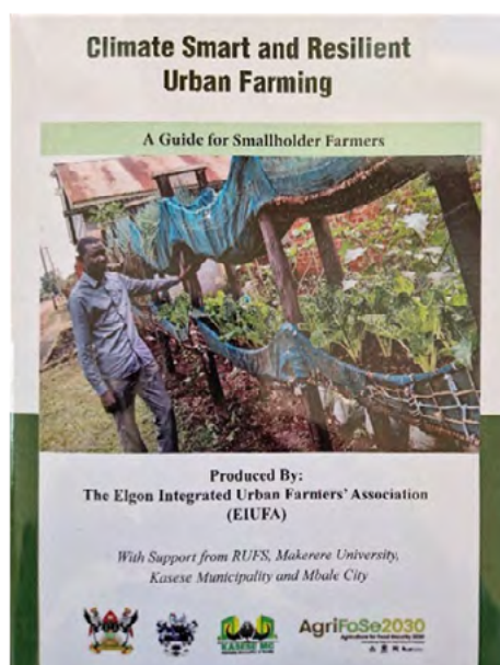
A handbook for camel husbandry

one is currently under second review and one is in draft form. These manuscripts explore links between farm diversity and diet diversity, farm types and food security and nutritional content of diets.