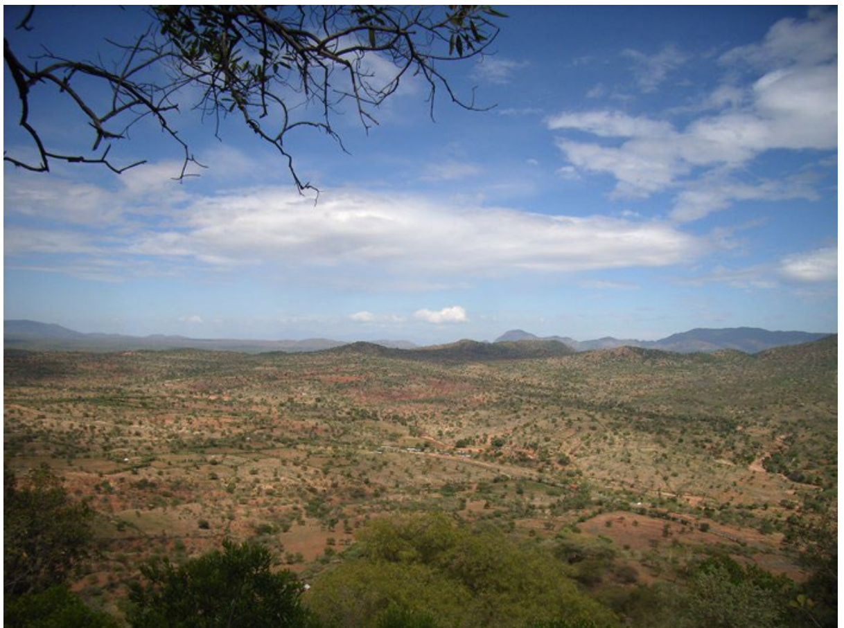
The landscapes where the project is active are dominated by agro-pastoralist and pastoralist communities.