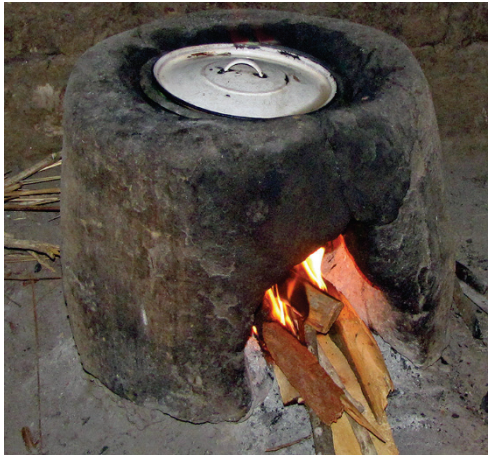
Woman fetching water from a well restored by Green Resources and energy efficient stove.

The company has invested in several development- and poverty alleviation activities in the villages. Our research shows that while many people appreciate activities that they have benefited from, these do not reach all. Especially the poorest individuals and households are not reached by interventions. In addition, from the perspectives of those reached by the activities, these have so far not sufficiently compensated for the loss of agricultural and grazing land in the plantation.