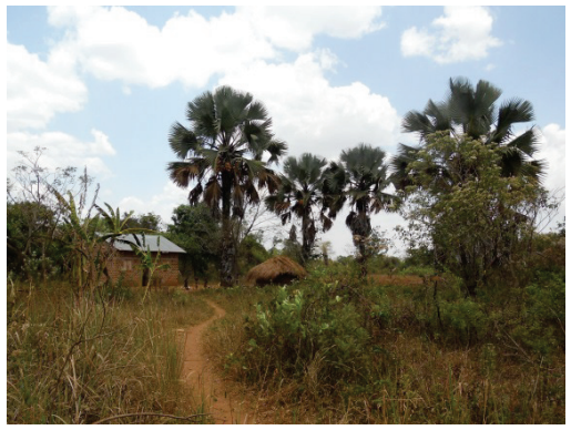
Houses in one of the villages surrounding Kachung plantation.