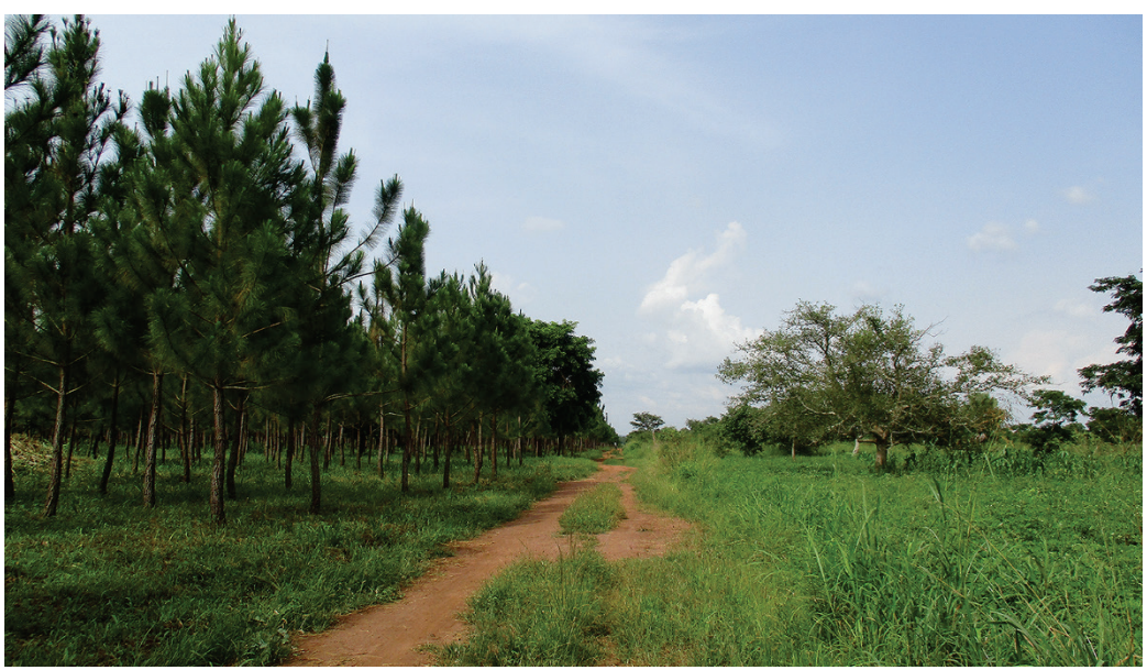
Plantation next to village land