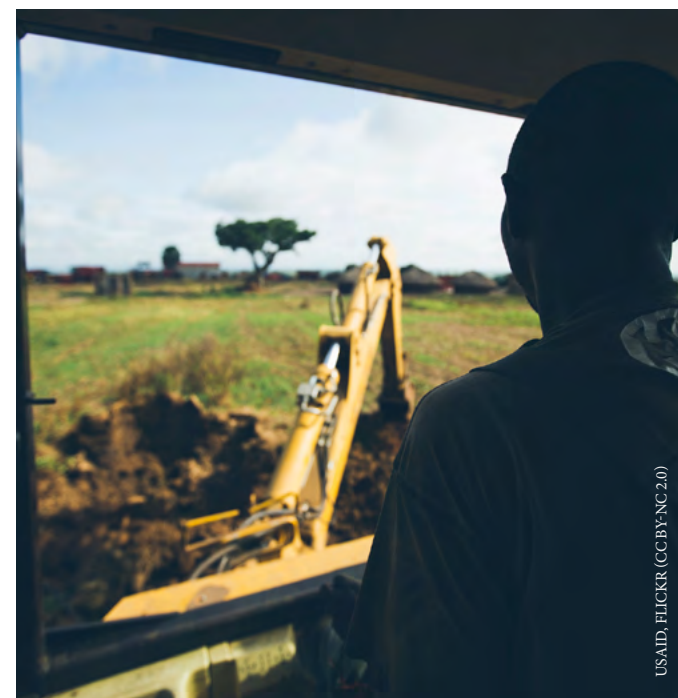
A mechanised farm in Uganda.

are strong determinants for agricultural productivity and food security in Kenya. “ The great diversity in the distribution of crops and livestock markets and value chains in various parts of Kenya is crucial to recognise in the design of extension support, R&D efforts and interventions in support of infrastructure, modern value chains and the transformation of small-scale farmers from subsistence to more commercial farmers ” Recha explains. The study has also looked at constraints and opportunities across value chains for livestock and crop produce.