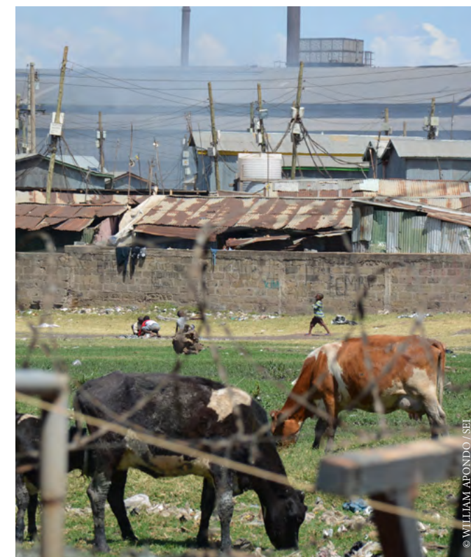
Livestock in Nairobi’s informal settlements.

A week long course was organized at SLU, engaging 20 experts in animal production, ranging from insect farming to aquaculture. The participants came from 13 different countries in SSA and Southeast Asia and were handpicked from the network of the programme due to their interest in policy and practice engagement. Participants were trained in systematic reviews, meta-analysis and how to transform research into practice, and how they can, as researchers, influence change processes in society.