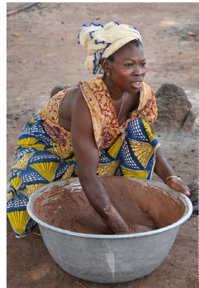
Young woman processing shea nuts