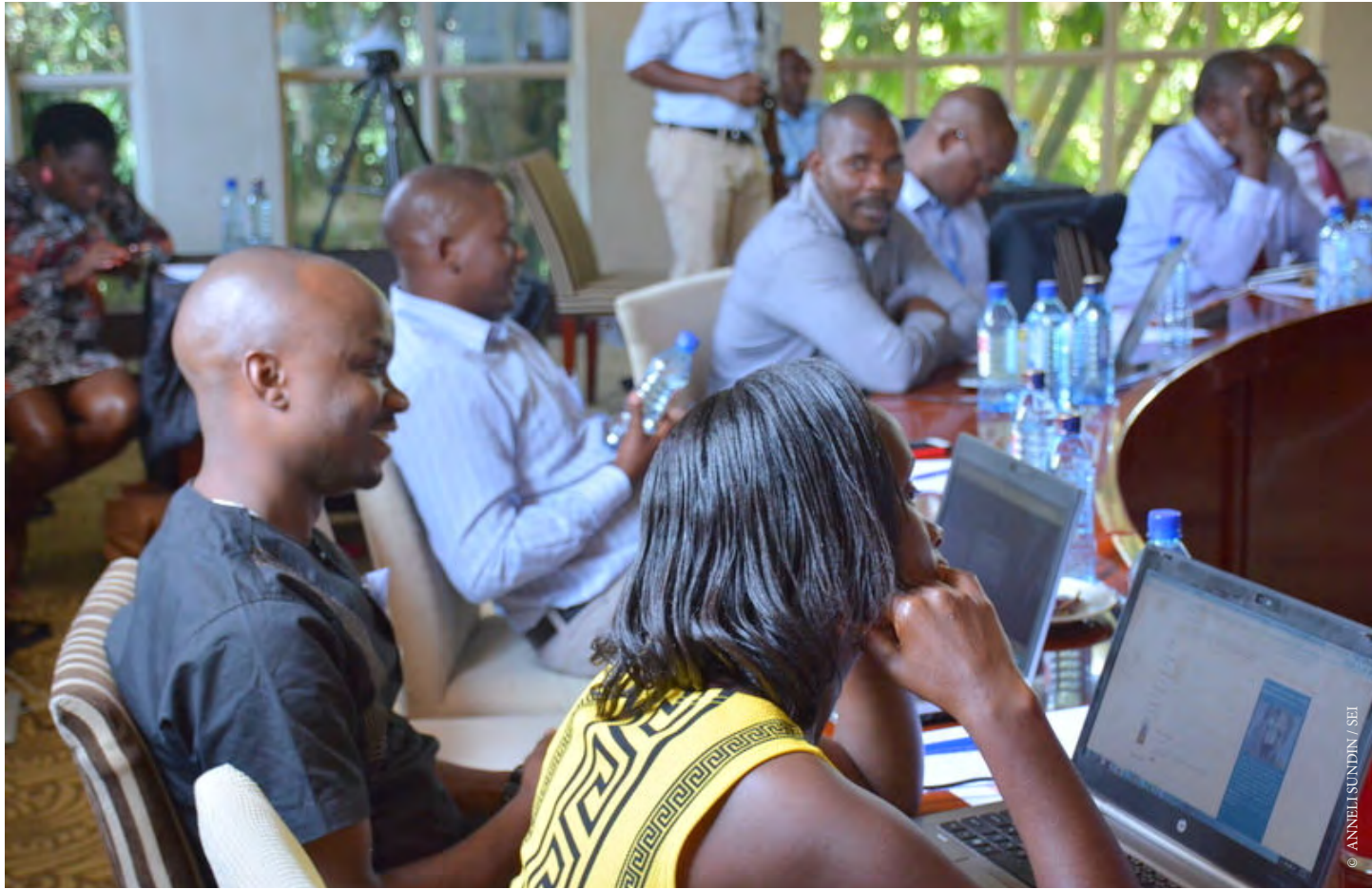
Participants at AgriFoSe2030 workshop in Nairobi January 2017.

(ILRI) and AgriFoSe2030 researchers also started “A Network of Policy Analysts for Enhanced Agricultural Development, Food and Nutrition Security in Kenya” during 2017. “ The aim of the project is to develop a pool of policy analysts able to support the development, implementation, and evaluation of policies and practices for enhanced agricultural transformation and food security in Kenya ”, says the project coordinator Joseph Karugia, ILRI. Around seven experts in Kenya will provide capacity development support to the network by developing and delivering training materials as well as continuously mentoring, coaching and advising a group of PhD graduates.